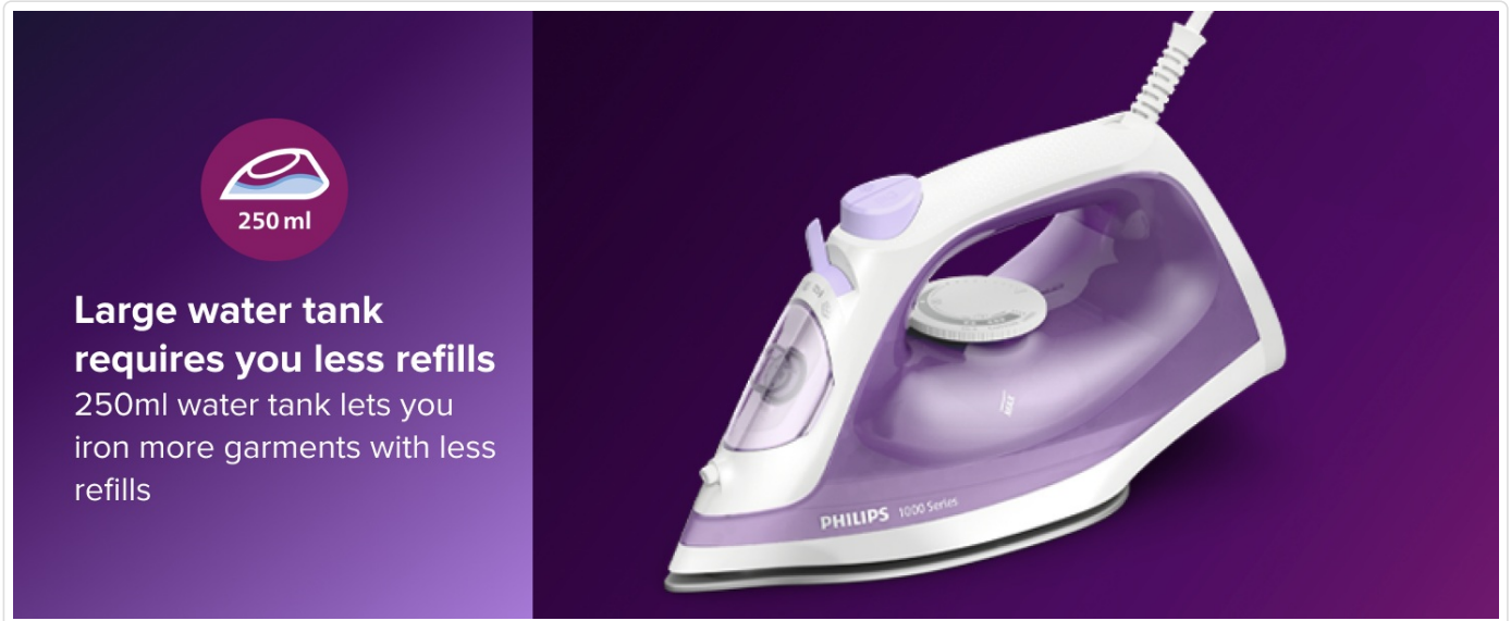
Figure 2: Image showing the large 250ml water tank of the Philips 1000 Series Steam Iron, indicating its capacity for fewer refills during use.