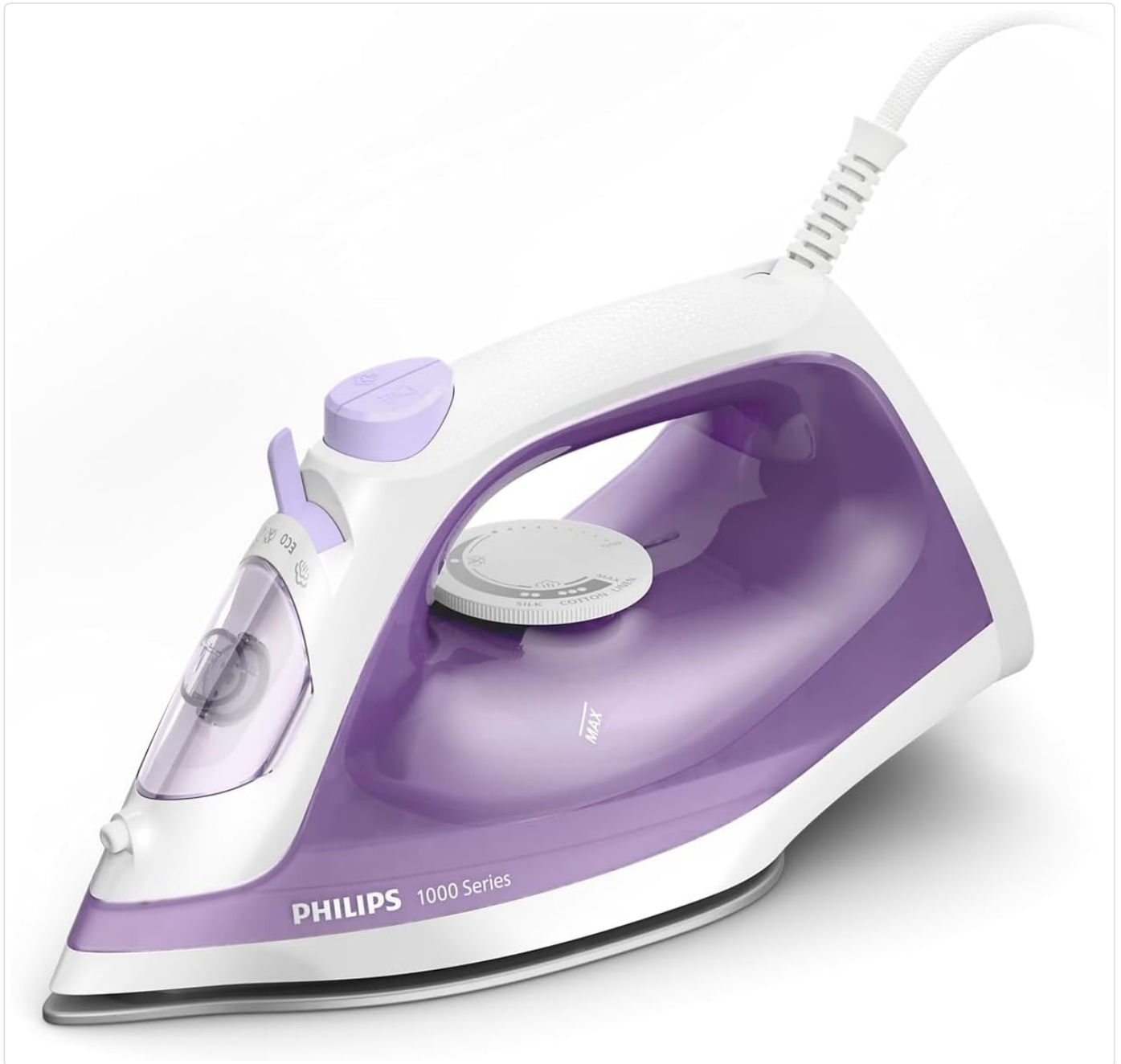
Figure 1: Overview of the Philips 1000 Series DST1040/30 Steam Iron, showing the water tank, soleplate, temperature dial, and steam controls.

Familiarize yourself with the parts of your Philips 1000 Series Steam Iron.