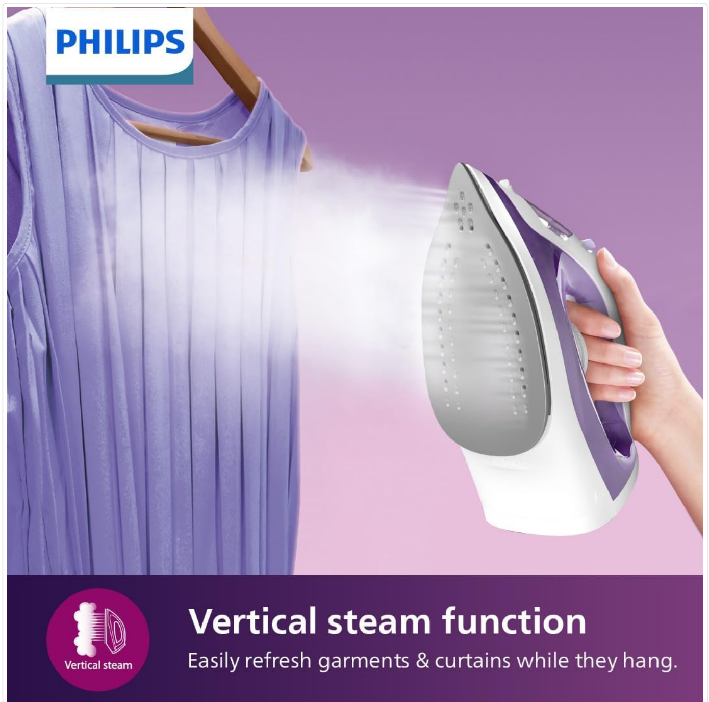
Figure 5: The Philips 1000 Series Steam Iron being used in a vertical position to steam a hanging garment, showcasing its vertical steam function.