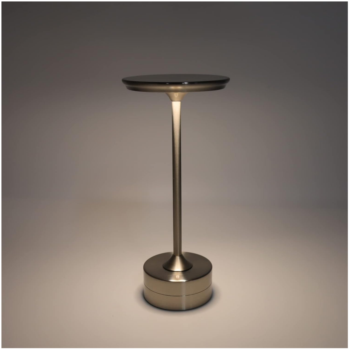
Image: plplaaoo Cordless Table Lamp with ordinary light. The third available light mode.