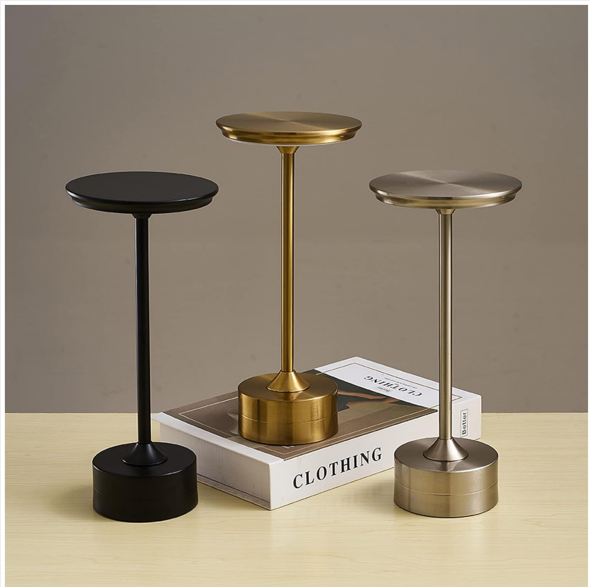
Image: Three plplaaoo Cordless Table Lamps. The lamps are available in various finishes, showcasing their elegant design.

The plplaaoo Cordless Table Lamp features a sleek design with a durable iron, aluminum, and acrylic construction. It includes a built-in 2000mAh rechargeable lithium battery, offering 10-15 hours of working time on a full charge. The lamp provides three light sources: white light, warm light, and ordinary light, with adjustable brightness up to 150lm.