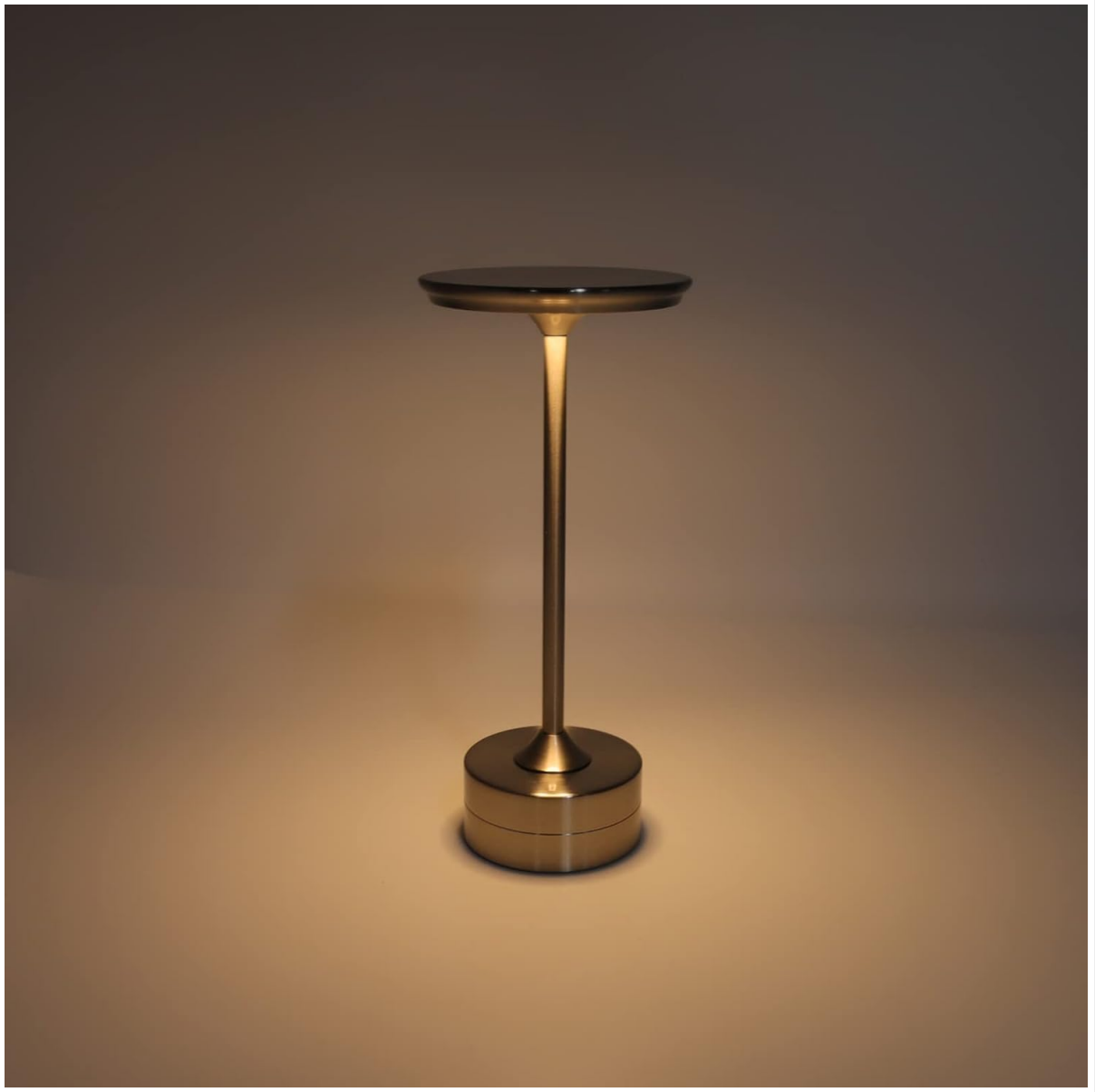
Image: p|plaaoo Cordless Table Lamp with warm light. Another available light mode.