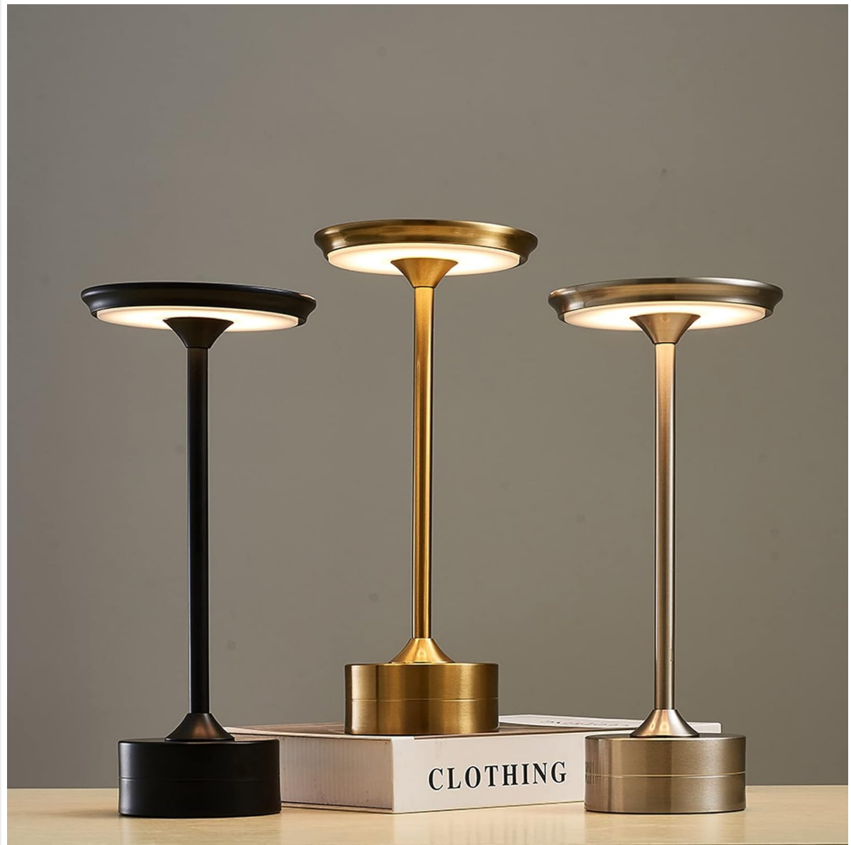
Image: Three plplaaoo Cordless Table Lamps illuminated. This demonstrates the different light modes available.