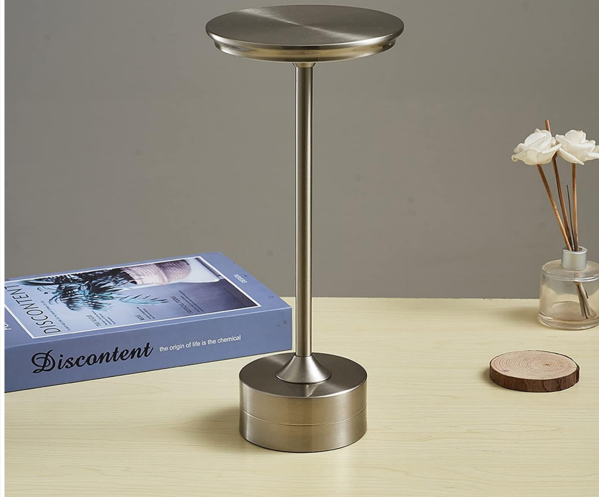
Image: Single plplaaoo Cordless Table Lamp. This image highlights the lamp's rechargeable battery and extended working time.

Built in 2000mAh rechargeable lithium battery 10-15 hours working time