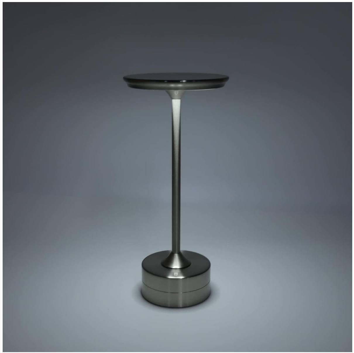
Image: plplaaoo Cordless Table Lamp with white light. One of the available light modes.