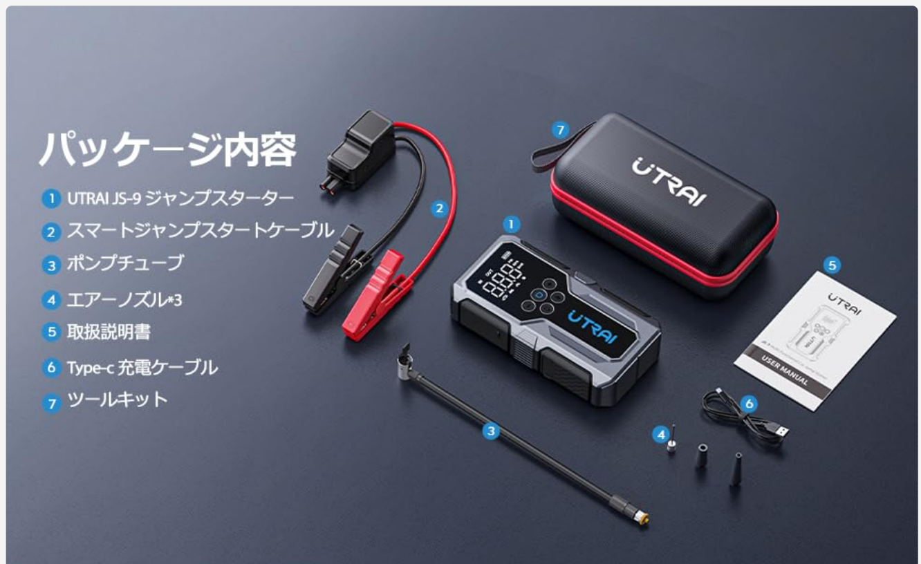
Figure 3: All items included in the UTRAI JS-9 package, neatly arranged to show the jump starter unit, smart cables, air hose, nozzles, charging cable, and storage case.