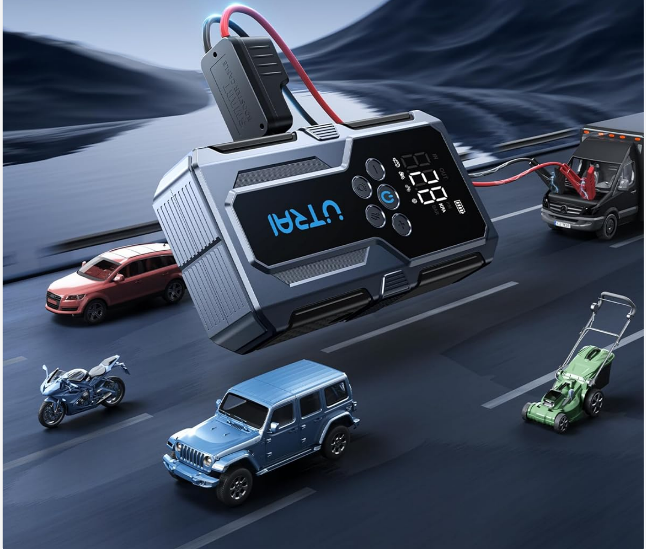
Figure 6: The UTRAI JS-9 in action, connected to a car battery for jump starting, illustrating its capability to revive various types of vehicles.