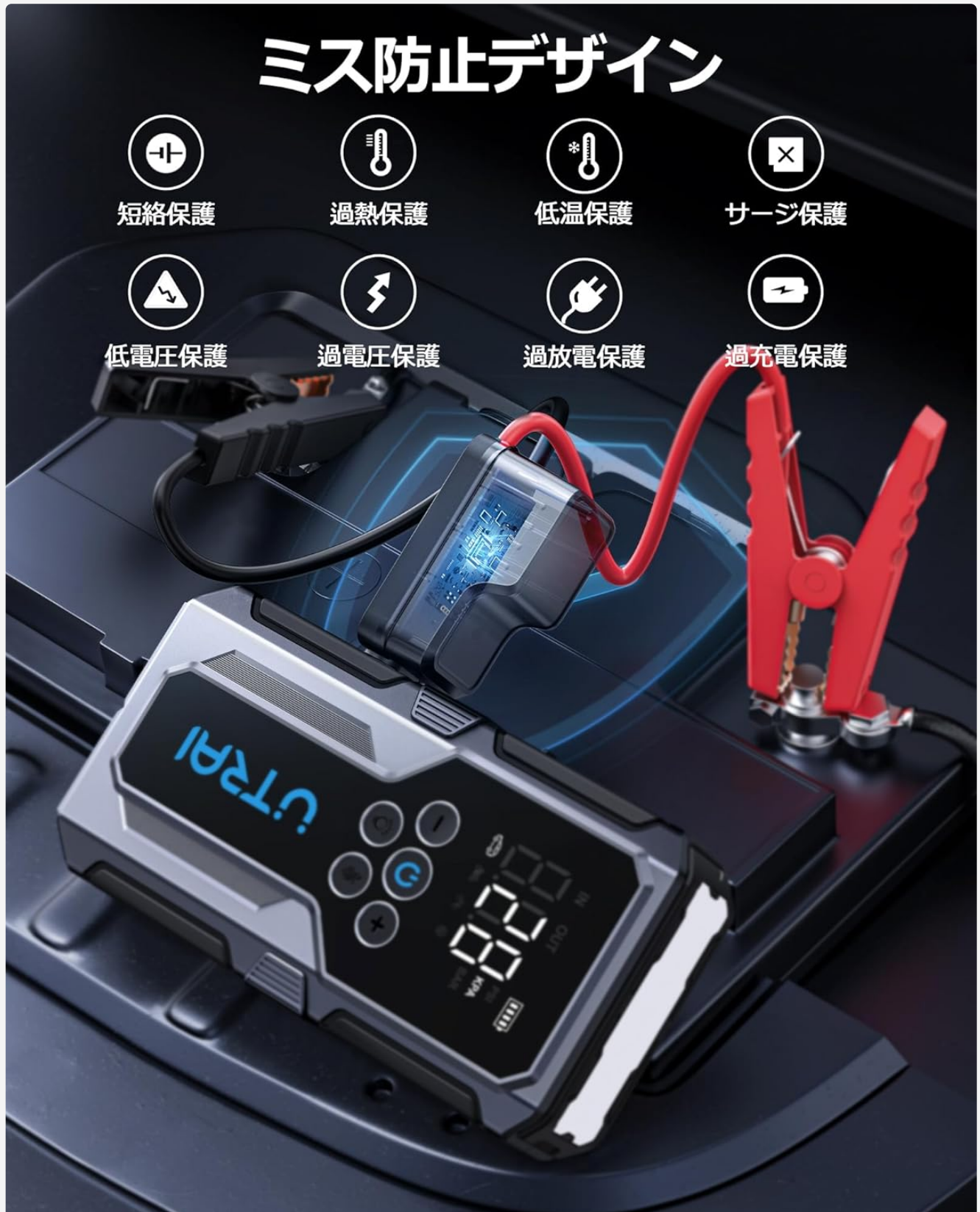
Figure 2: Visual representation of the comprehensive safety protection features integrated into the UTRAI JS-9, ensuring safe and