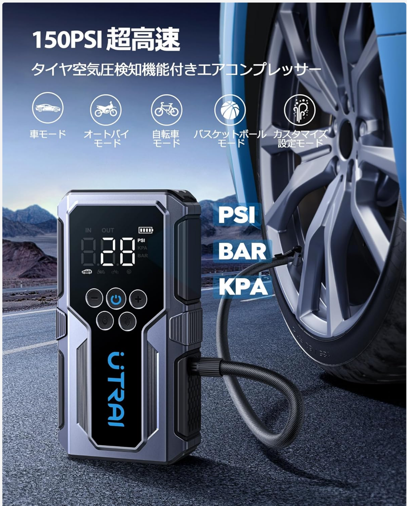
Figure 7: The UTRAI JS-9 connected to a car tire, demonstrating its air compressor function with the display showing pressure units (PSI, BAR, KPA).