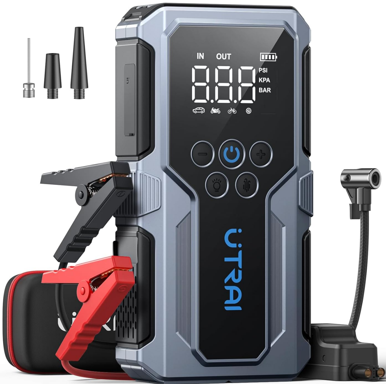
Figure 1: The UTRAI JS-9 Multi-functional Jump Starter, showcasing its compact design and included accessories like jump cables and air hose.