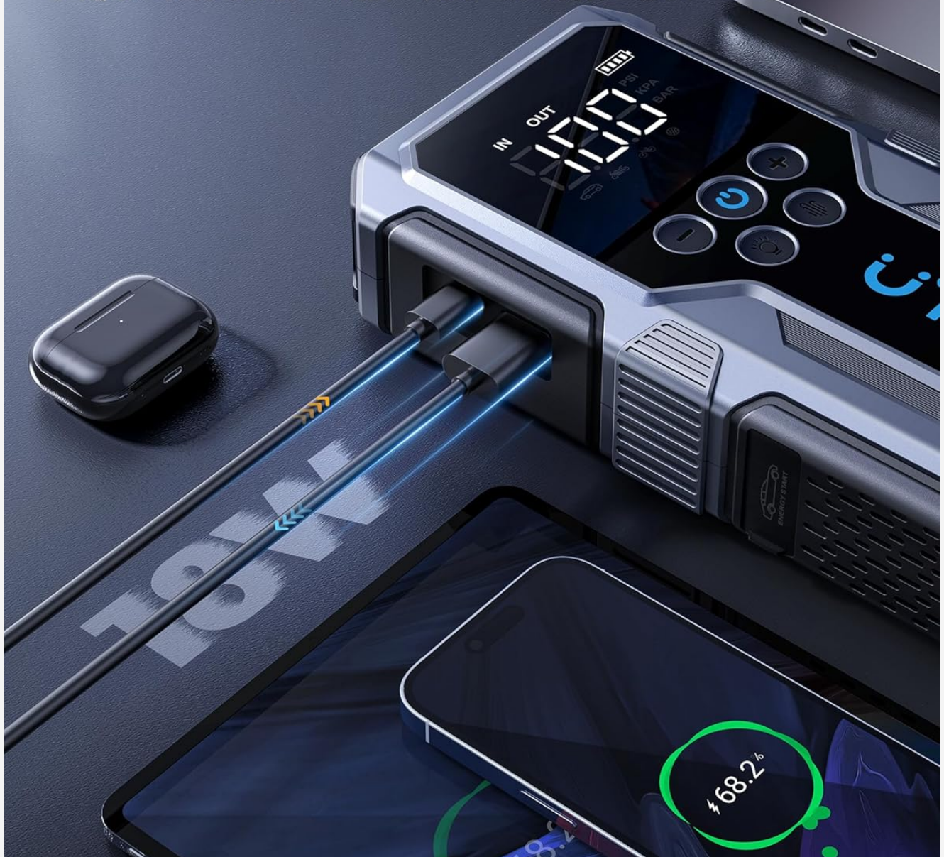
Figure 9: The UTRAI JS-9 functioning as a fast-charging power bank, connected to and charging a smartphone and a tablet simultaneously.