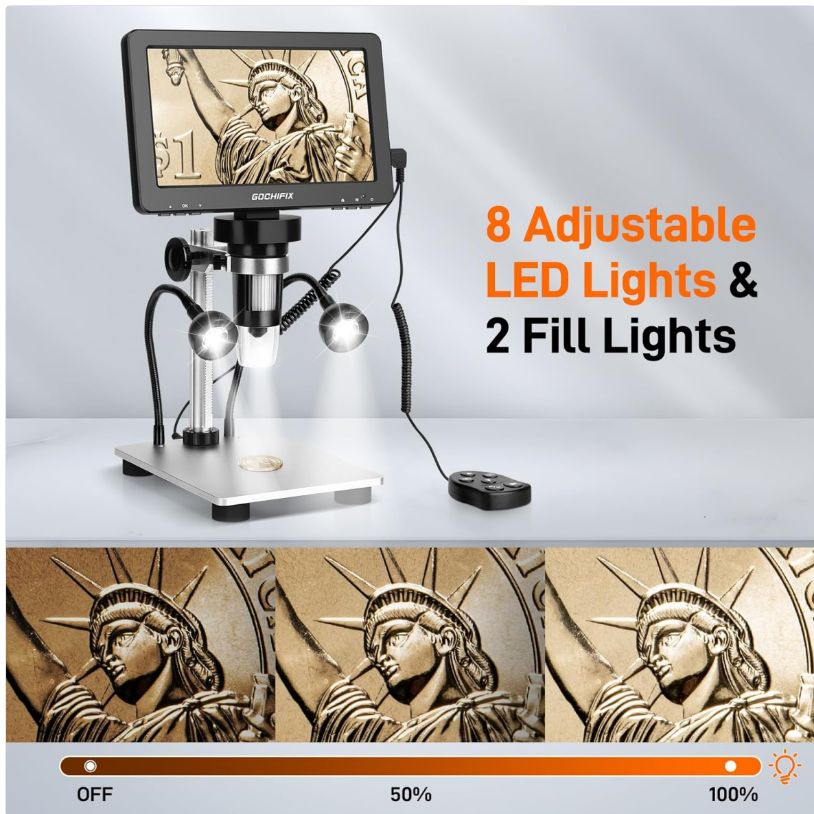
Figure 5.2: Adjustable 8 LED lights and 2 fill lights.