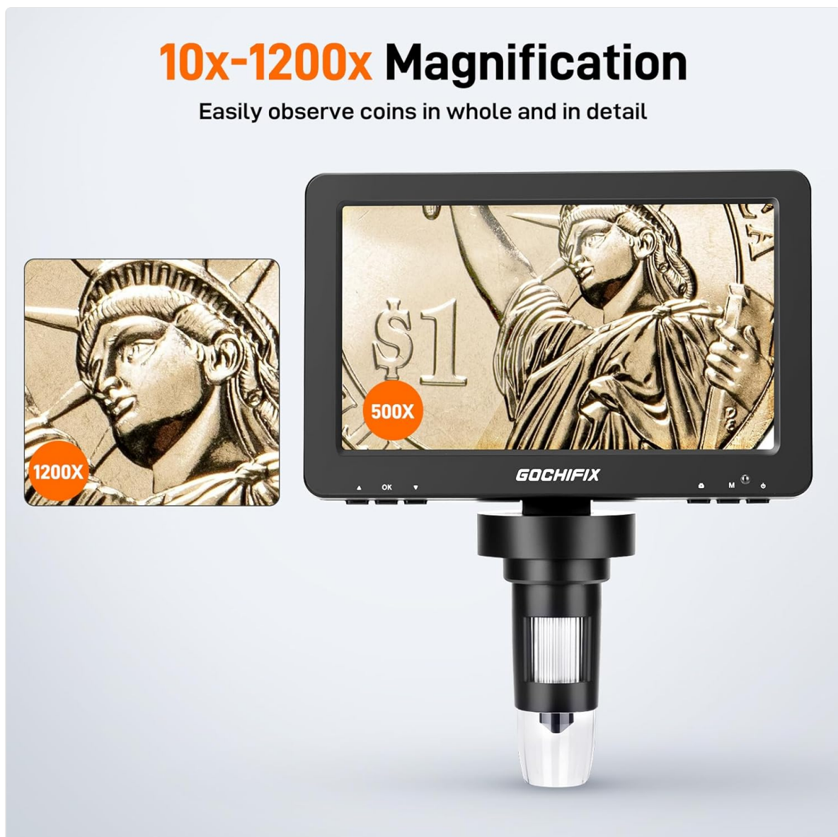
Figure 5.1: Example of 10x-1200x magnification on a coin.

Rotate the focus wheel on the microscope objective to bring your object into clear view. Adjust the height of the microscope unit on the stand using the side knobs for broader magnification changes.