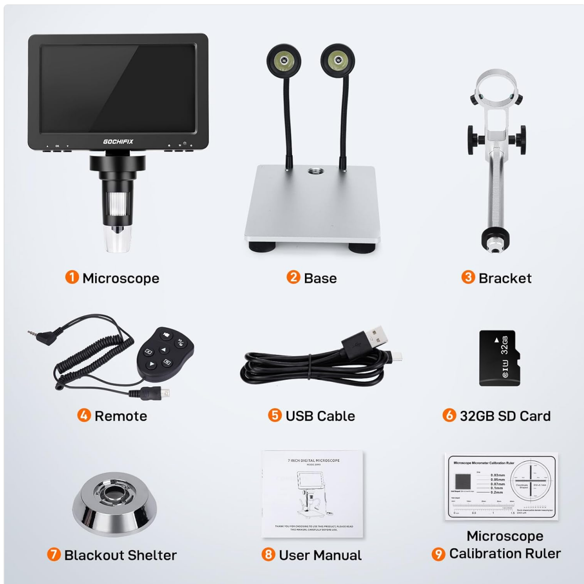
Figure 5.3: Inserting the 32GB Micro SD card.