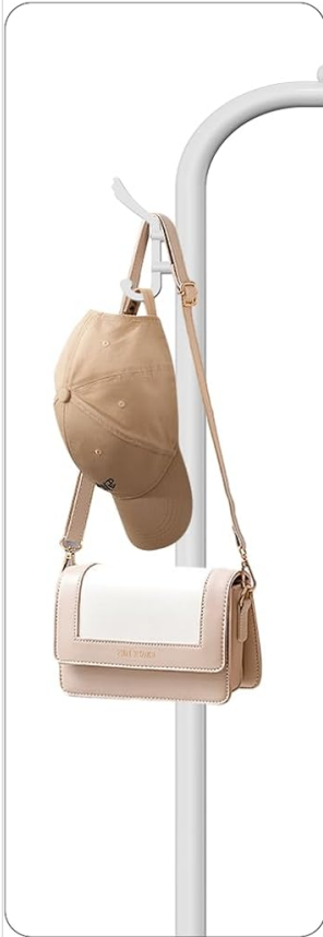
Bags and Hats