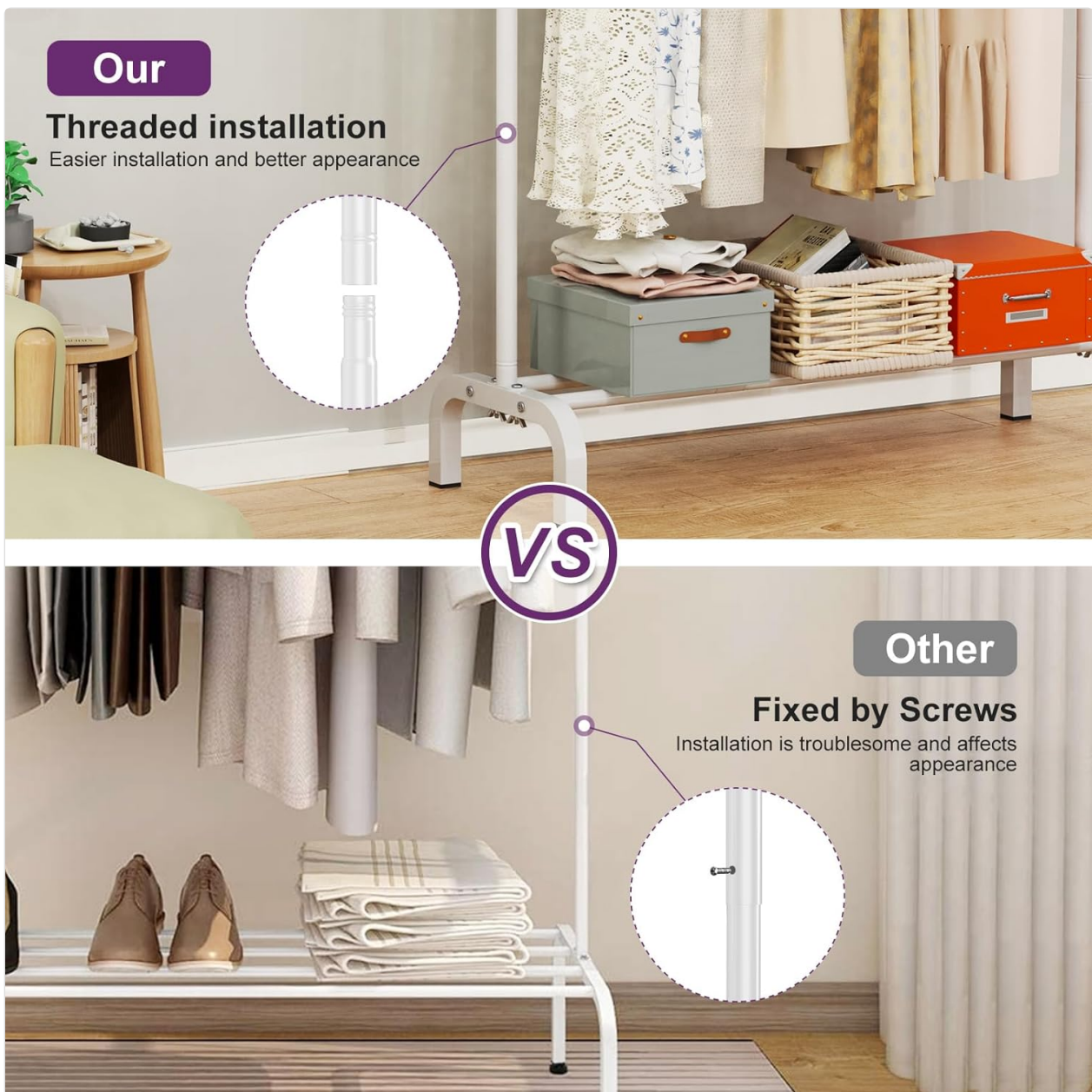
Image: A visual comparison highlighting the threaded installation method of the LOEFME Clothes Rail, which offers a more seamless look compared to traditional screw-fixed designs.

The LOEFME Clothes Rail features a threaded installation design for easier assembly and a cleaner appearance, eliminating the need for external screws. Assembly is straightforward and typically requires no tools.