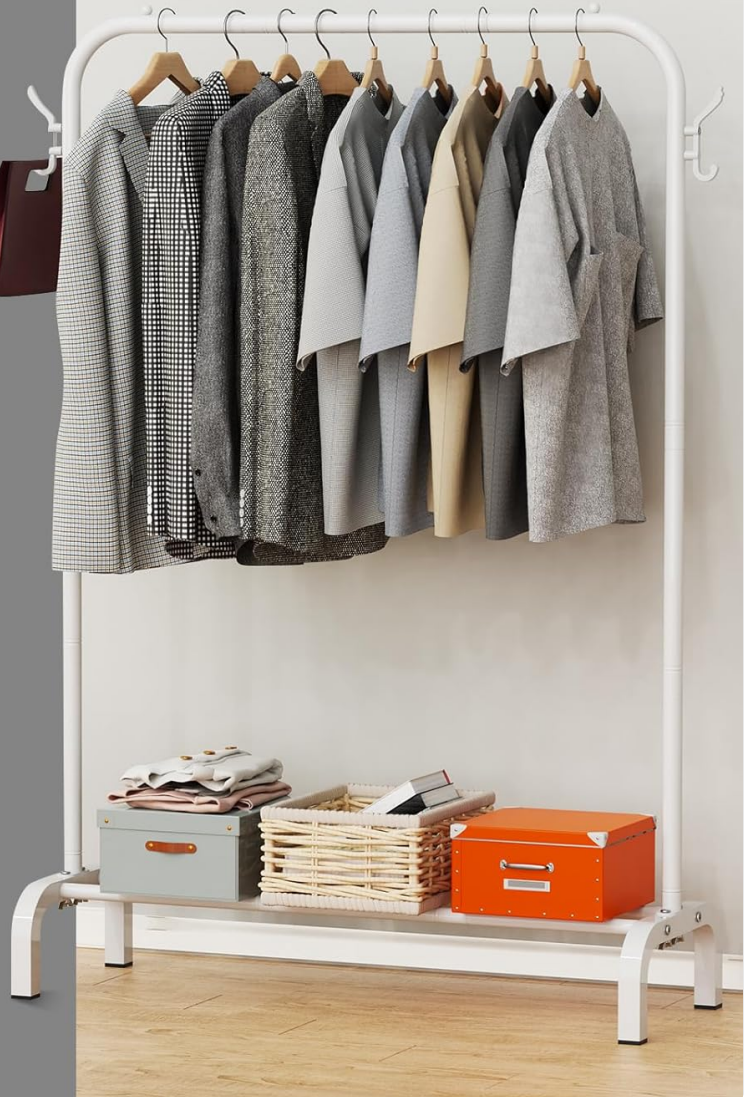
Image: A visual representation of the clothes rail's 3-in-1 functionality, highlighting its use as a clothes hanger, storage rack, and coat rack.