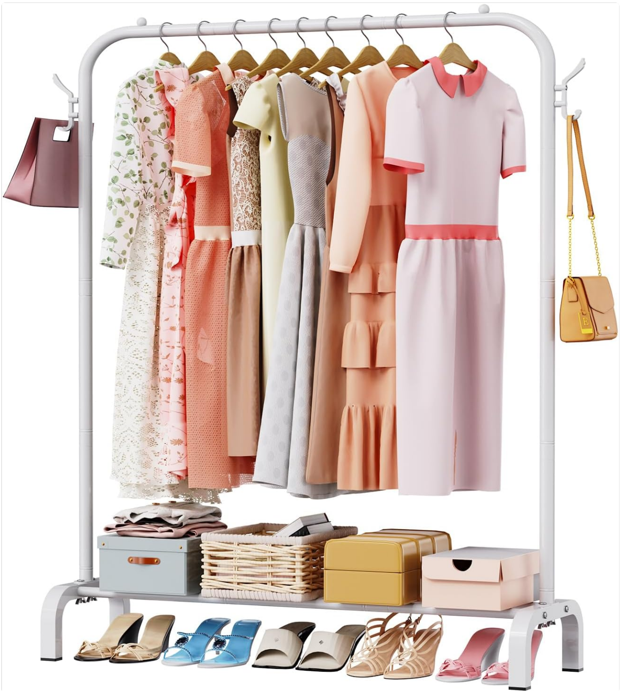
Image: The LOEFME Clothes Rail showcasing its full storage capacity with various garments, footwear, and storage containers.