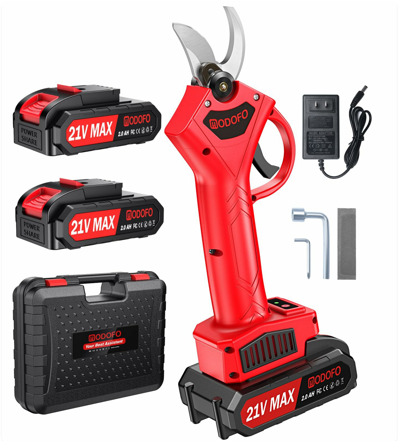
Image: MODOFO Electric Pruning Shears kit including the shears, two batteries, charger, and accessories in a protective case.