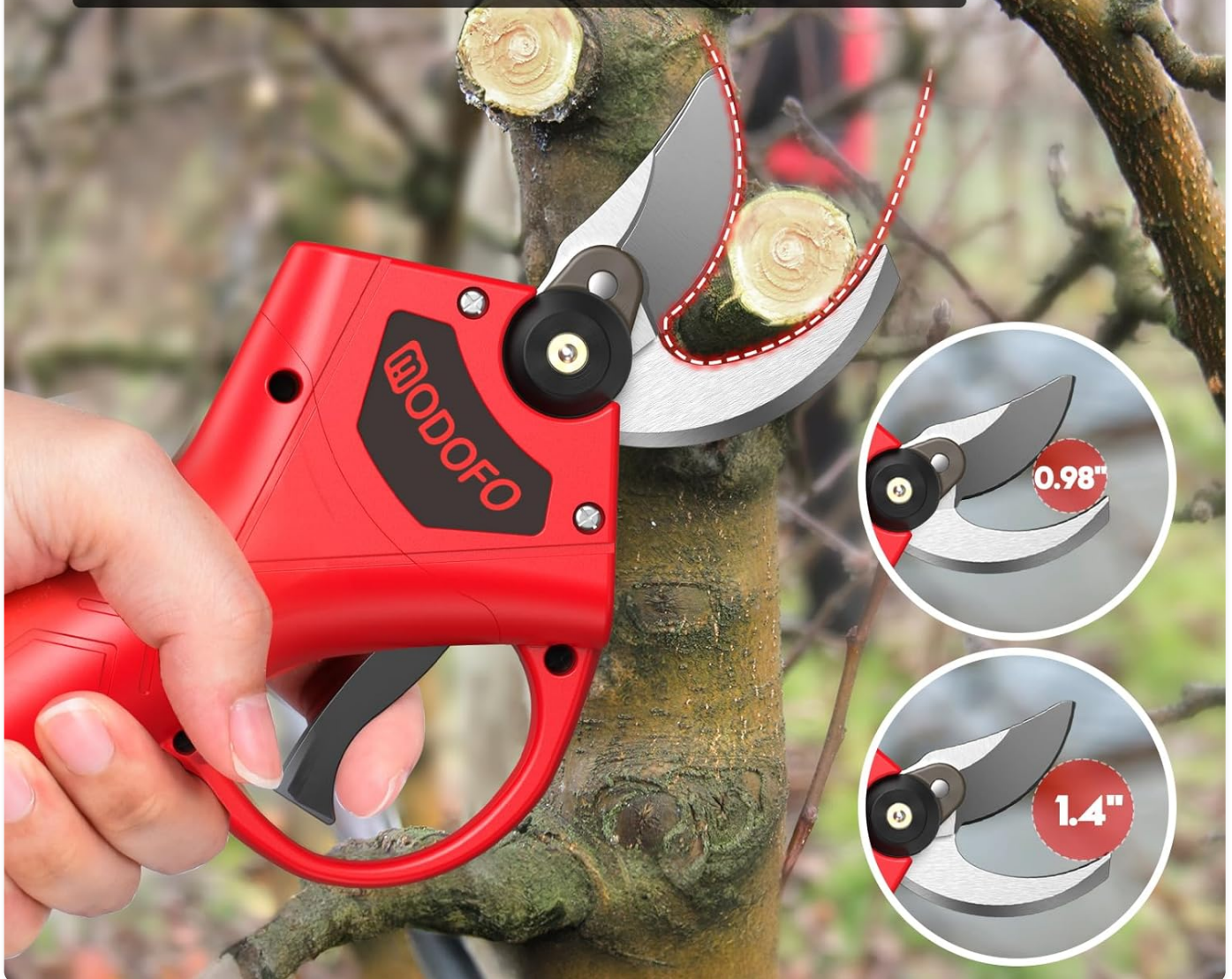
Image: The MODOFO Electric Pruning Shears demonstrating its adjustable cutting diameter feature, showing cuts of 0.98 inches and 1.4 inches.