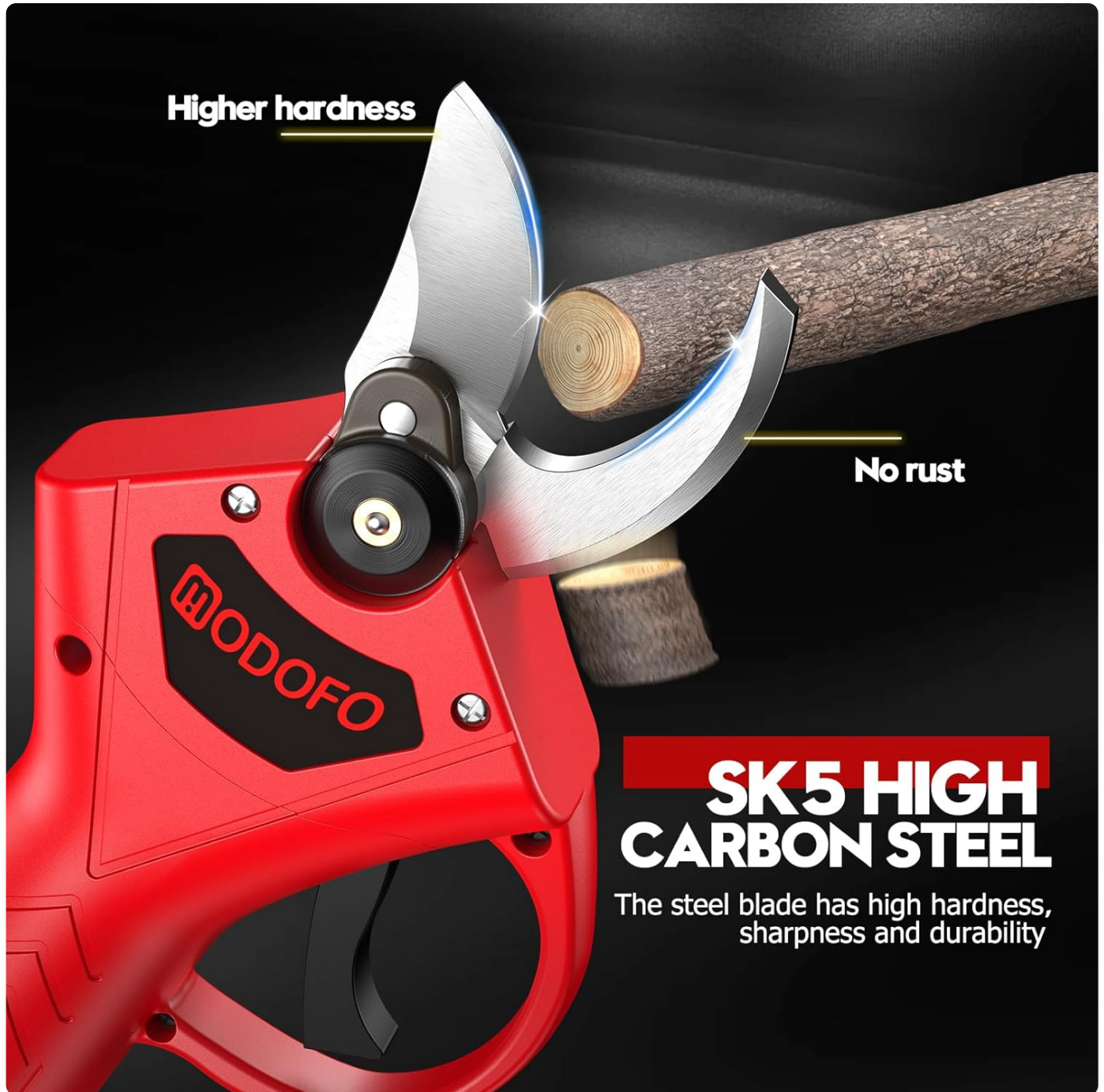
Image: A close-up view of the MODOFO Electric Pruning Shears blades, emphasizing their SK5 High Carbon Steel construction for durability and sharpness.

The SK5 high-carbon steel blades are rust-resistant and designed for longevity. Use the provided sharpening stone to maintain blade sharpness. If blades become dull or damaged, use the small wrenches to replace them with the spare set included in your kit.