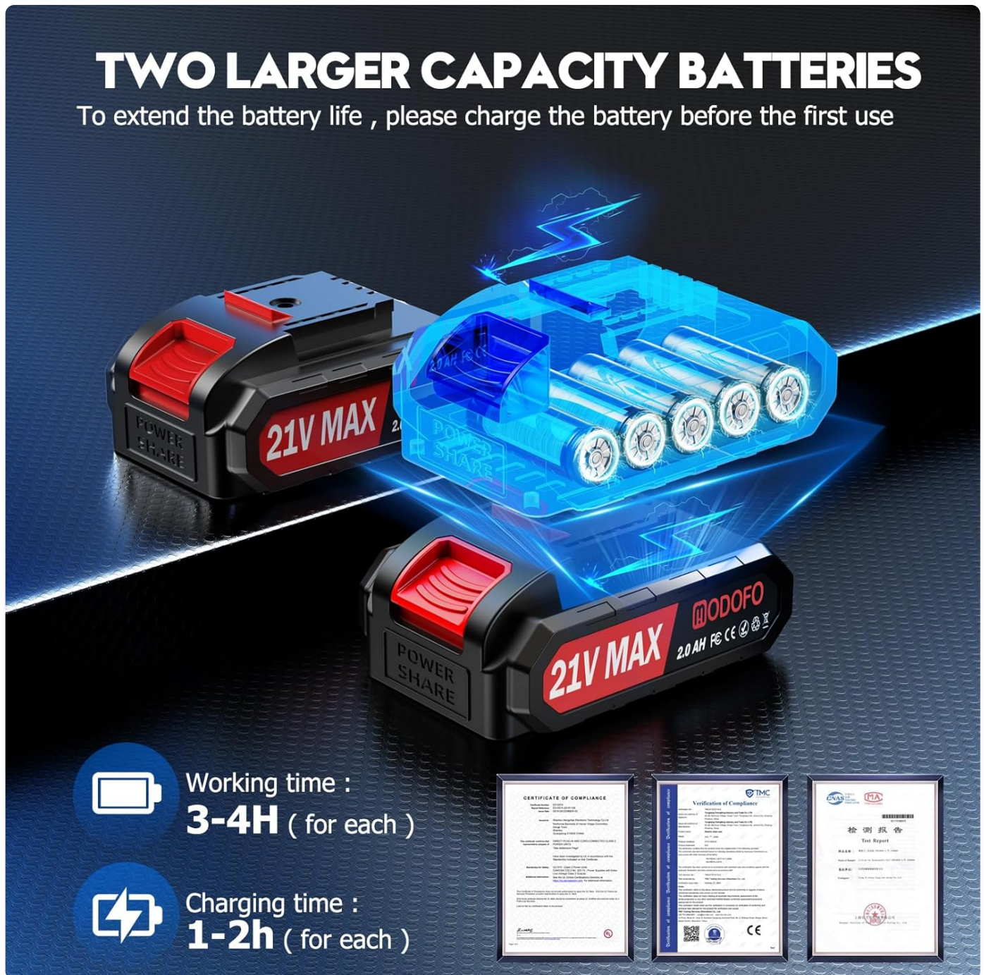
Image: Illustration of two MODOFO 21V Max batteries, highlighting their capacity and charging time.