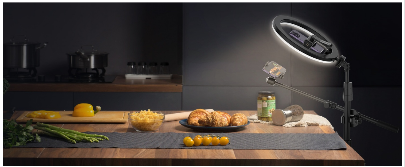
Figure 2: Illustration of the 3 light modes and 10 brightness levels, highlighting CRI 95+ for accurate color reproduction.