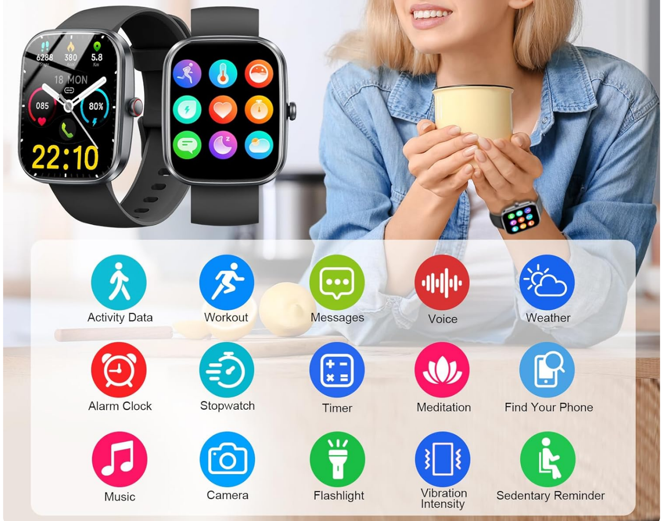
Figure 3.5: Overview of multifunctional smartwatch features.