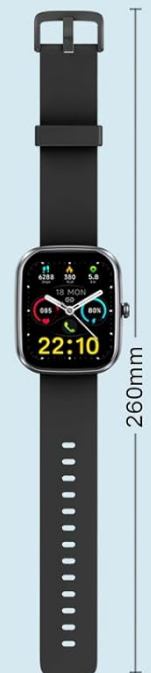
Figure 6.1: Battery and physical dimensions of the smartwatch.