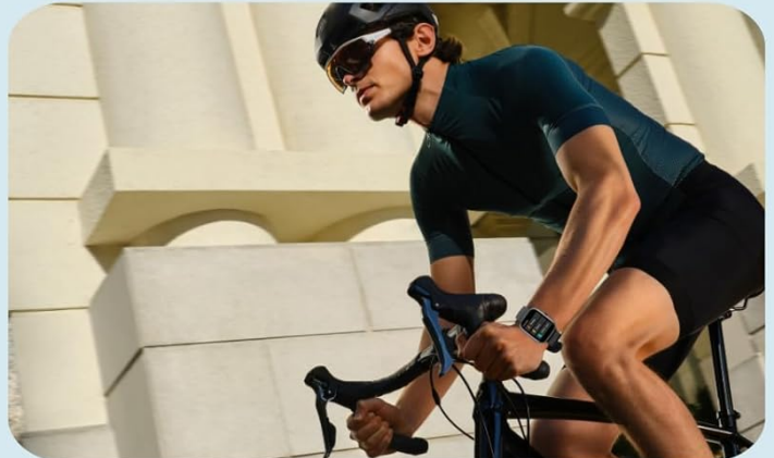
Figure 3.3: Overview of sports modes and activity tracking.