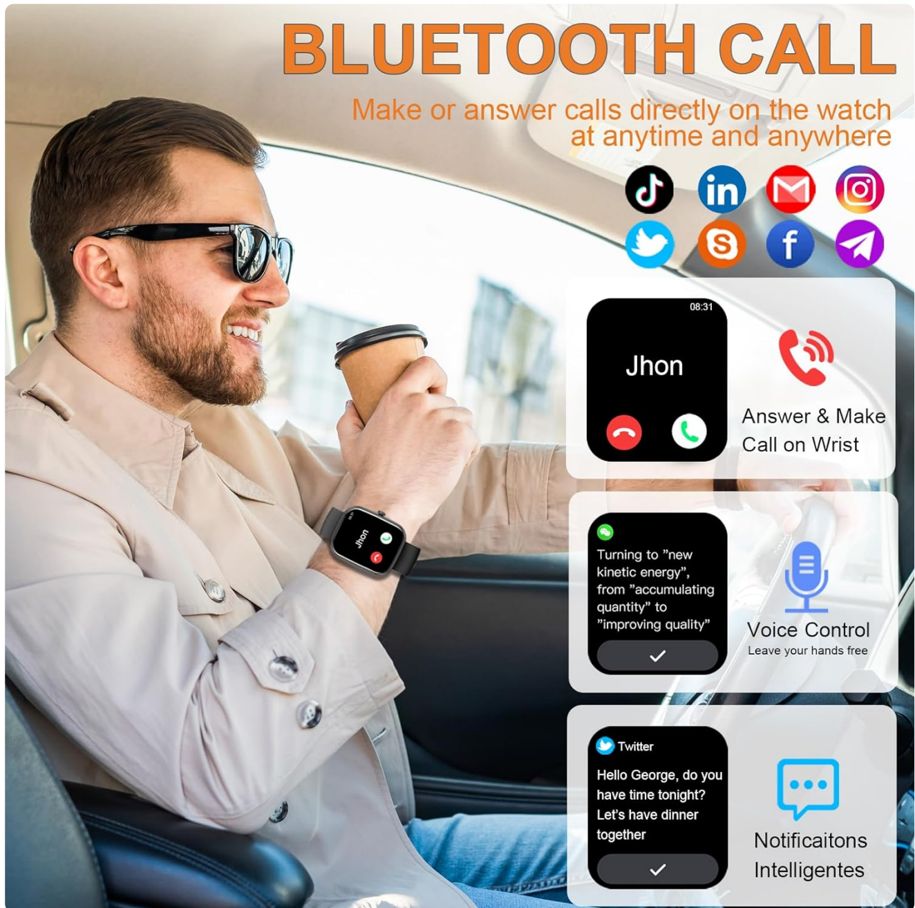
Figure 3.2: Bluetooth call and notification features.

from various apps, including messages and social media alerts.