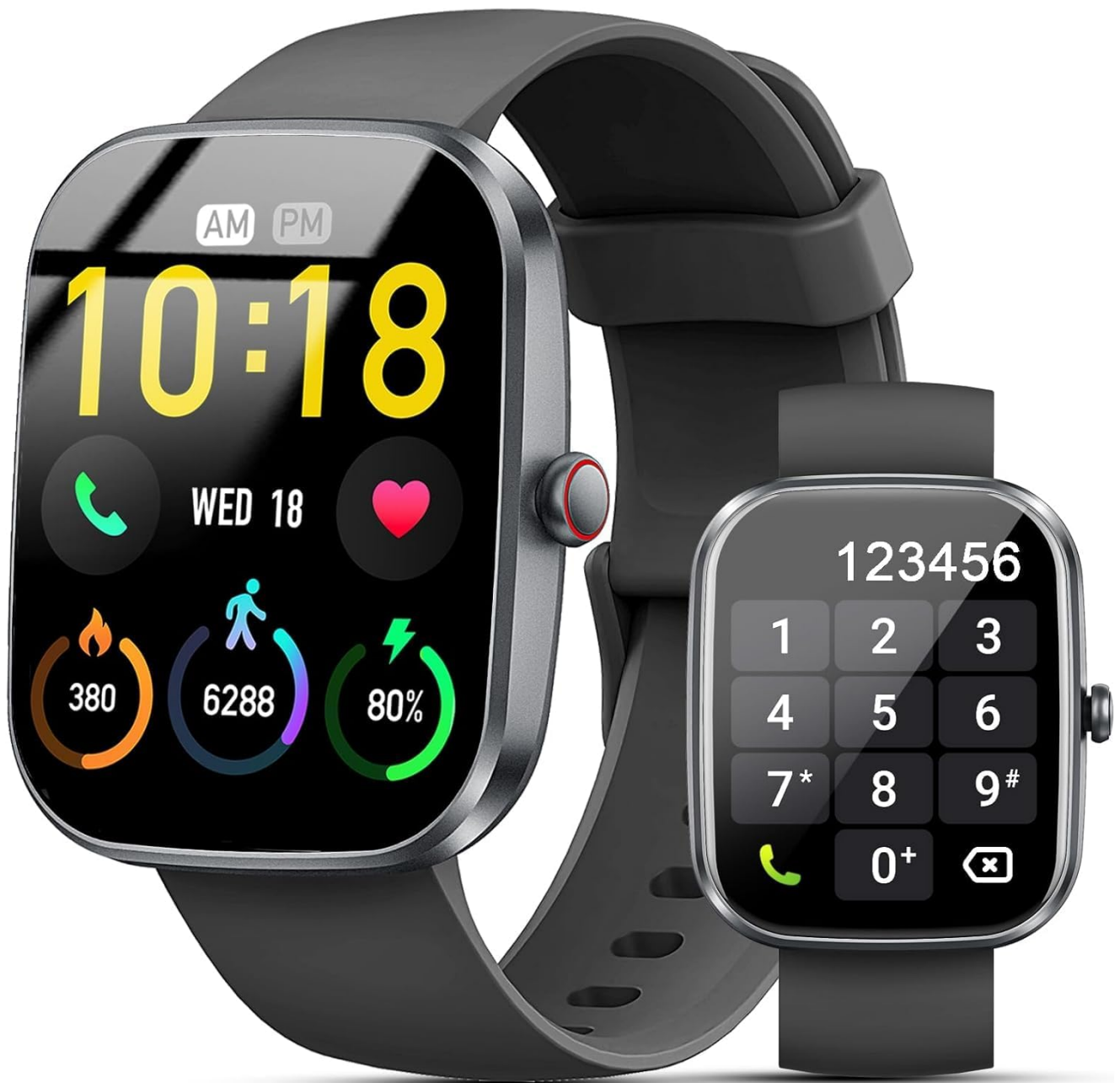
Figure 1.1: Kuizil Smartwatch and its dial pad interface.