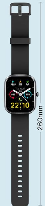
Figure 2.1: Smartwatch battery information and charging method.