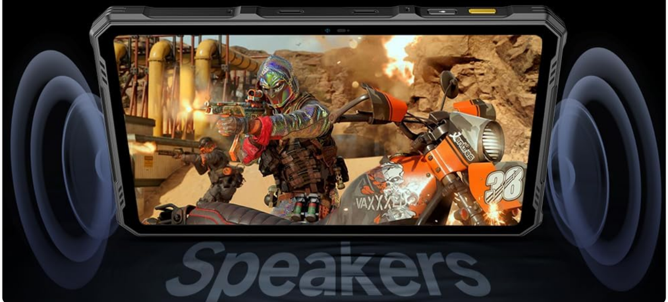
Image: The Ulefone Armor PAD 3 PRO highlighting its stereo front-facing dual speakers, designed for enhanced audio quality.

Built-in symmetrical two speakers on the front offers louder stereo audio output, improved clarity, and more balanced audio experience across different frequencies. This contributes to more immersive and enjoyable multimedia experience of headset-free FM, video meetings, movies, music, and games.