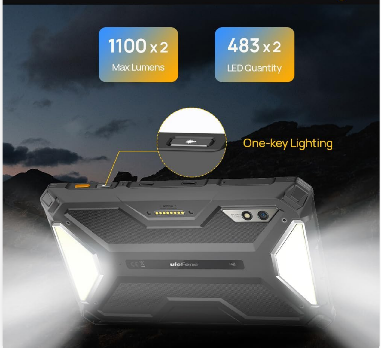
Image: The Ulefone Armor PAD 3 PRO showcasing its dual 1100 lumens LED lights, designed for powerful illumination in various settings.