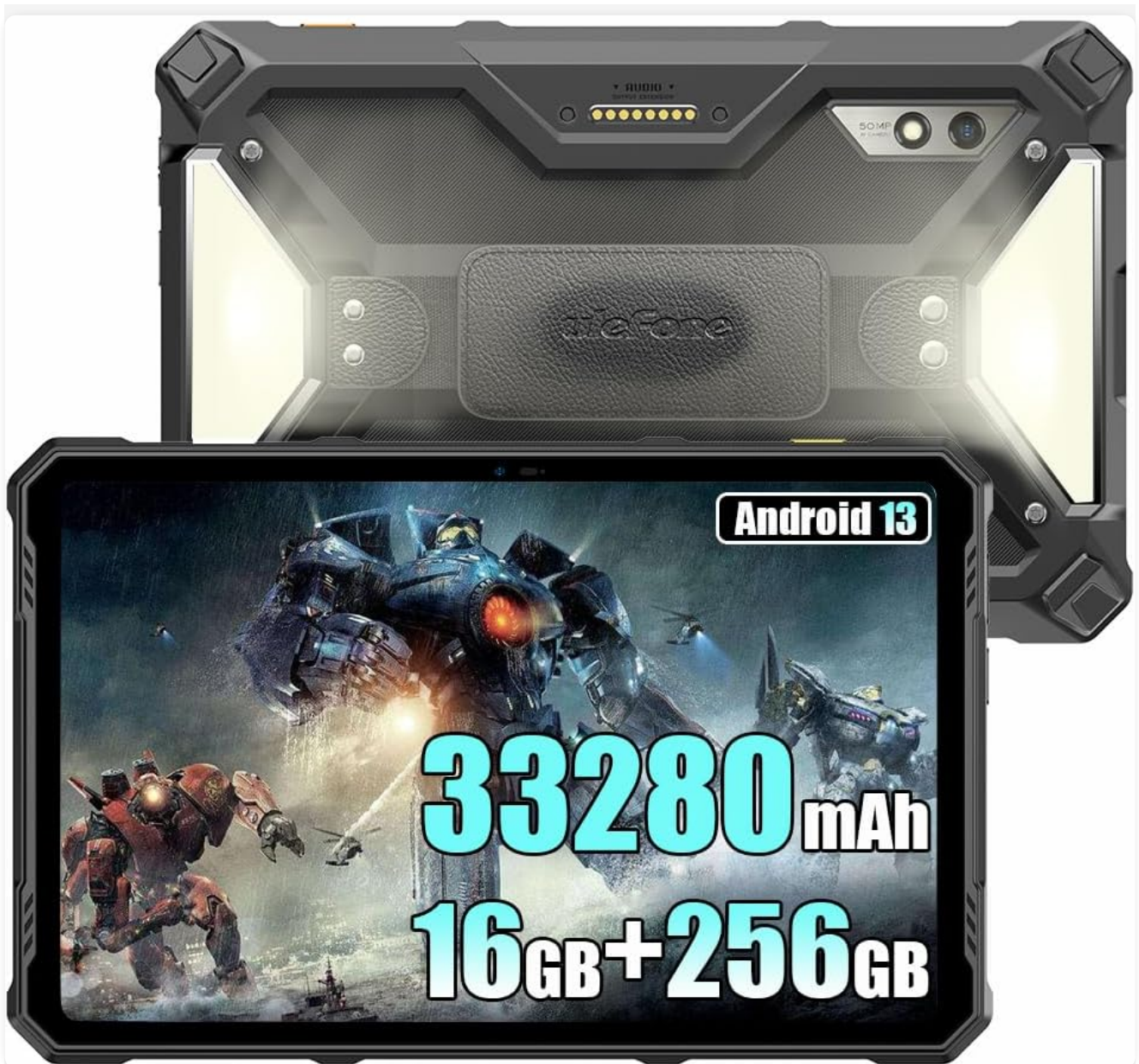
Image: Front and rear view of the Ulefone Armor PAD 3 PRO Rugged Tablet, highlighting its robust design and dual LED lights on the back, along with the large battery and memory specifications on the screen.