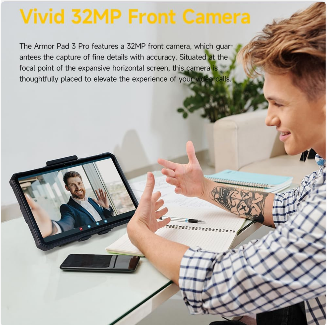
Image: A user engaging in a video call using the Ulefone Armor PAD 3 PRO, demonstrating the clarity of its 32MP front camera.

The Armor Pad 3 Pro features a 32MP front camera, which guarantees the capture of fine details with accuracy. Situated at the focal point of the expansive horizontal screen, this camera is thoughtfully placed to elevate the experience of your video calls.