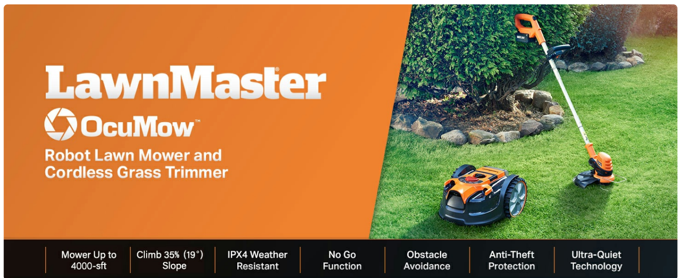
Figure 4: Robot mower operating on a lawn with a clear boundary.