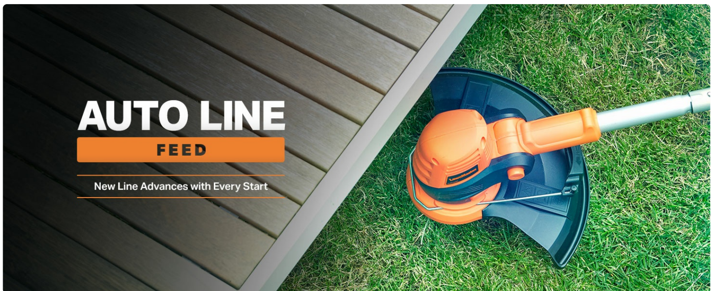
Figure 9: Trimming edges with the cordless grass trimmer.

The 10-inch cordless grass trimmer features an auto line feed, 5-position pivoting head, and a 90° rotating shaft for manicuring edges or tight areas with precision. It also includes an adjustable assist handle for user comfort and a retractable guard for trimming around plants.