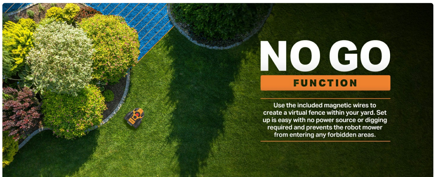
Figure 5: Implementing the No-Go Function with magnetic wire.

Use the included 33-feet of magnetic wire and pegs to create virtual fences within your yard. This is useful for preventing the robot mower from entering specific forbidden areas like flower beds or ponds. No power source or digging is required for this setup.