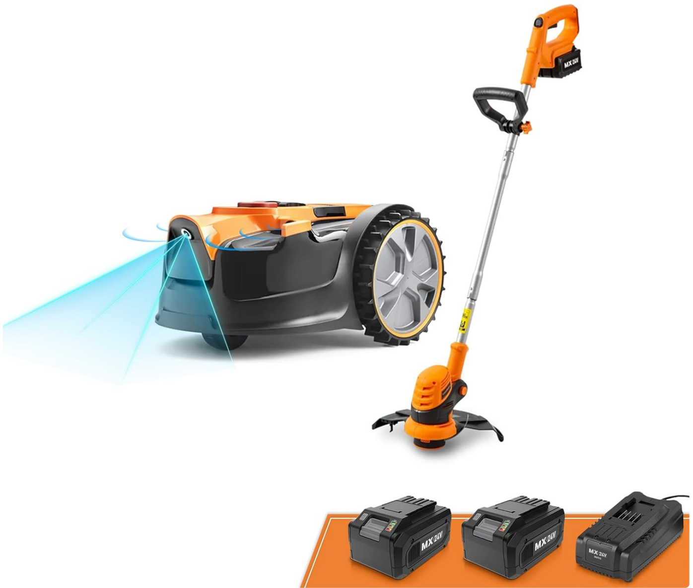
Figure 1: LawnMaster OcuMow™ Robot Lawn Mower and Cordless Grass Trimmer Combo Kit.