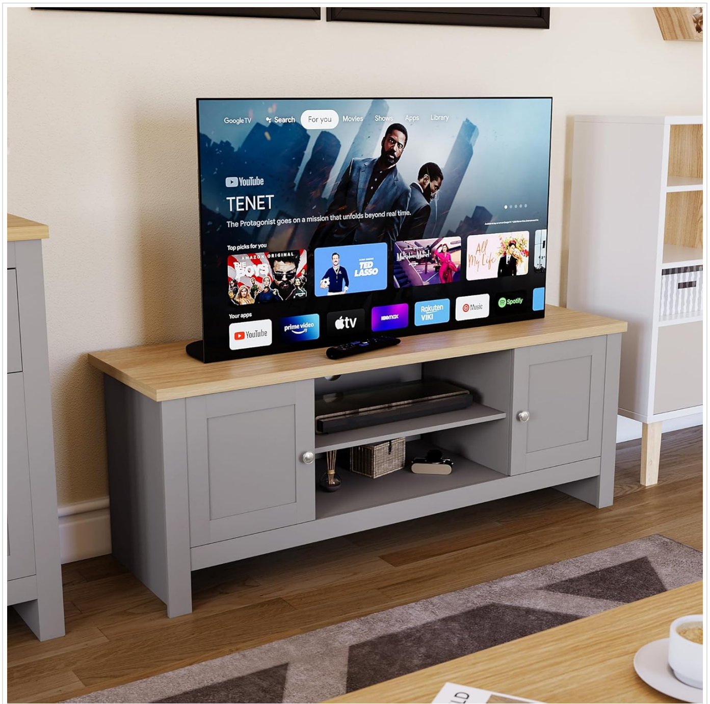
Image: Detailed view of the central shelves and one closed cabinet, highlighting storage capacity.