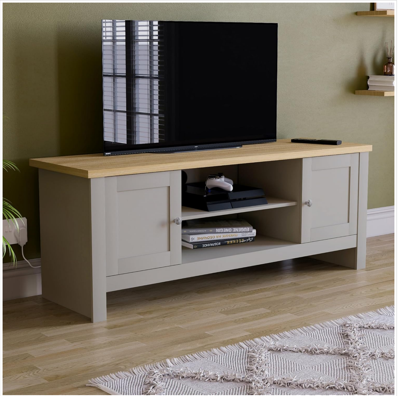
Image: The assembled TV unit with a television and media devices, demonstrating typical usage.