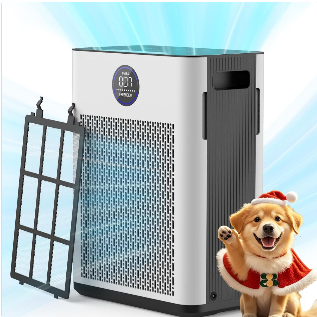
Image: The FRESHDEW AP303 Air Purifier, a white and black unit with a digital display, shown with one of its side filters partially removed. A small dog wearing a Santa hat is positioned next to the unit.