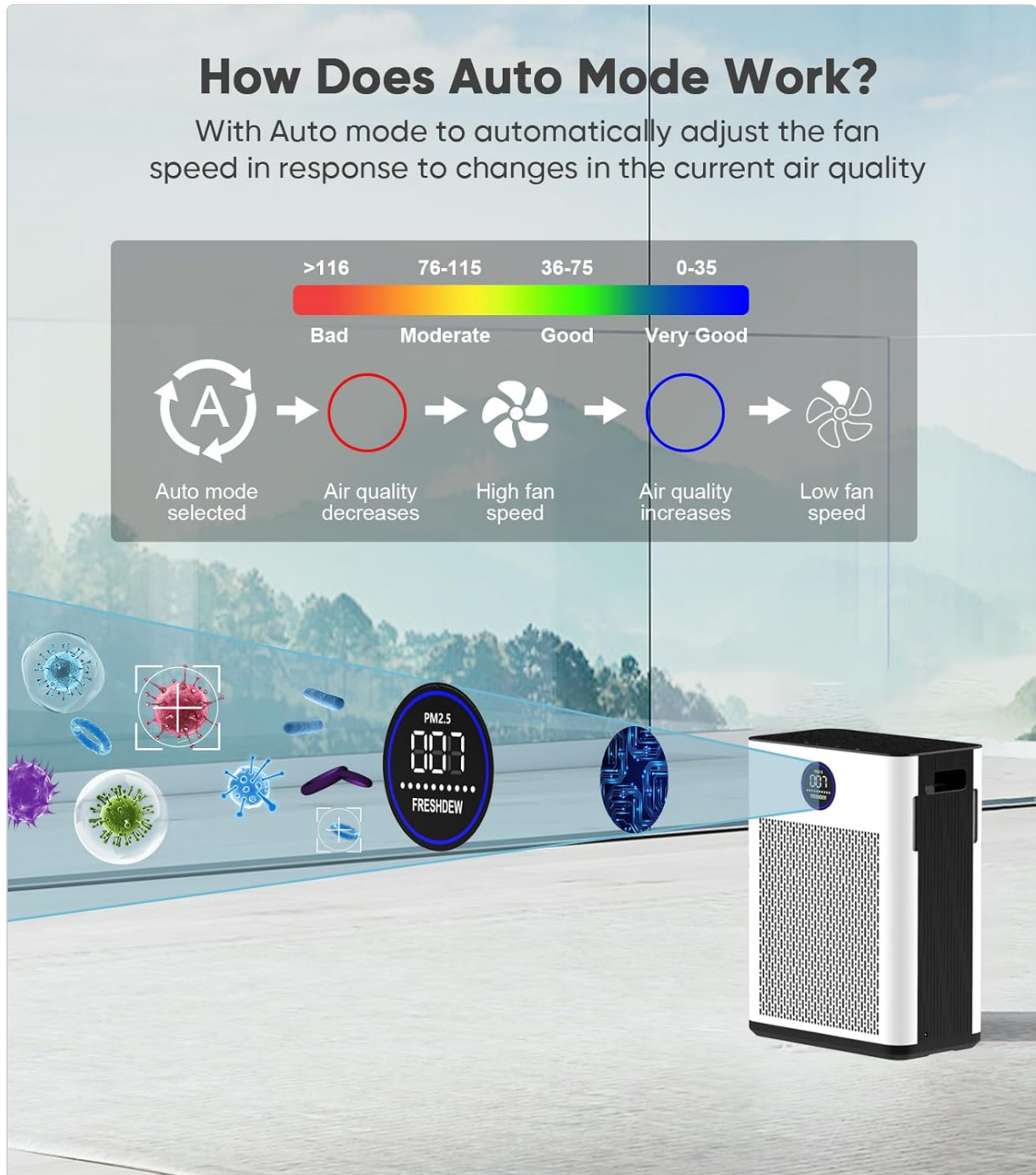
Image: Diagram illustrating the functionality of Auto Mode. It shows a scale from "Very Good" to "Bad" air quality based on PM2.5 levels, and how the air purifier automatically increases fan speed when air quality decreases and lowers it when air quality improves.

Press the Auto Mode button to activate. In Auto Mode, the air purifier uses its built-in air quality sensor to detect airborne pollutants and automatically adjusts the fan speed to optimize purification. The PM2.5 display will show real-time air quality readings.