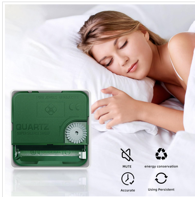
Image: Rear view of the TIMESS wall clock, highlighting the battery compartment and the silent quartz movement. A sleeping person is shown in the background, illustrating the silent operation.