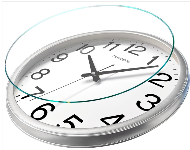
Image: Close-up of the TIMESS wall clock face, showing the clear numbers and minute markers, with the protective glass cover lifted away.