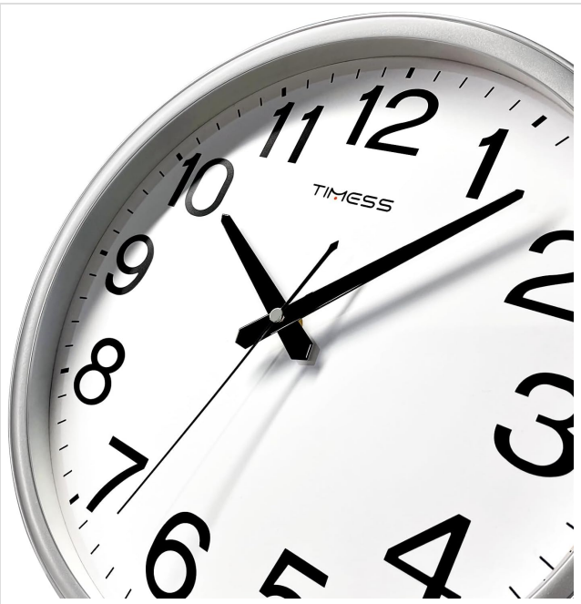
Image: Angled side view of the TIMESS 13 Inch Silent Wall Clock, showing the depth of the silver frame and the clear glass cover.