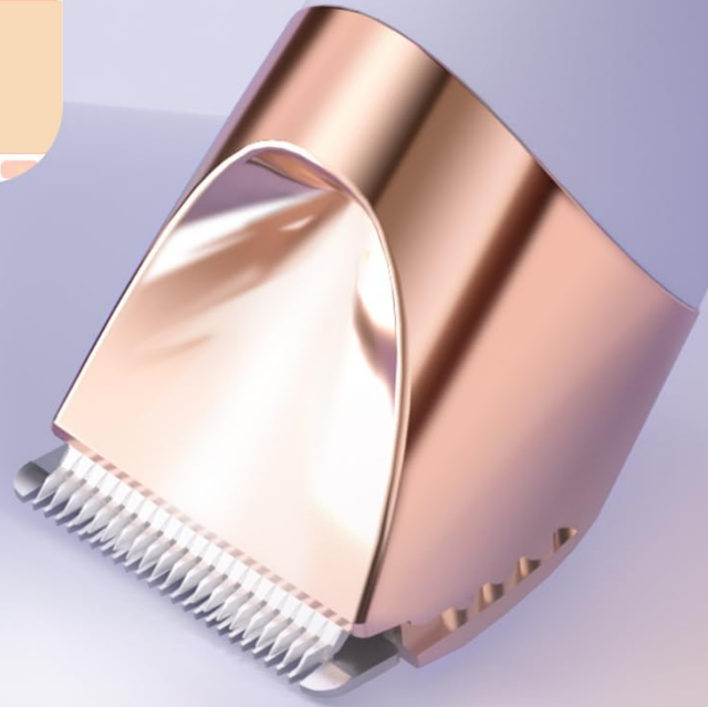
Figure 2.3: A diagram illustrating the trimmer's effectiveness for both intimate area trimming and gentle facial hair removal.

Achieve flawless facial hair removal with our gentle trimmer.