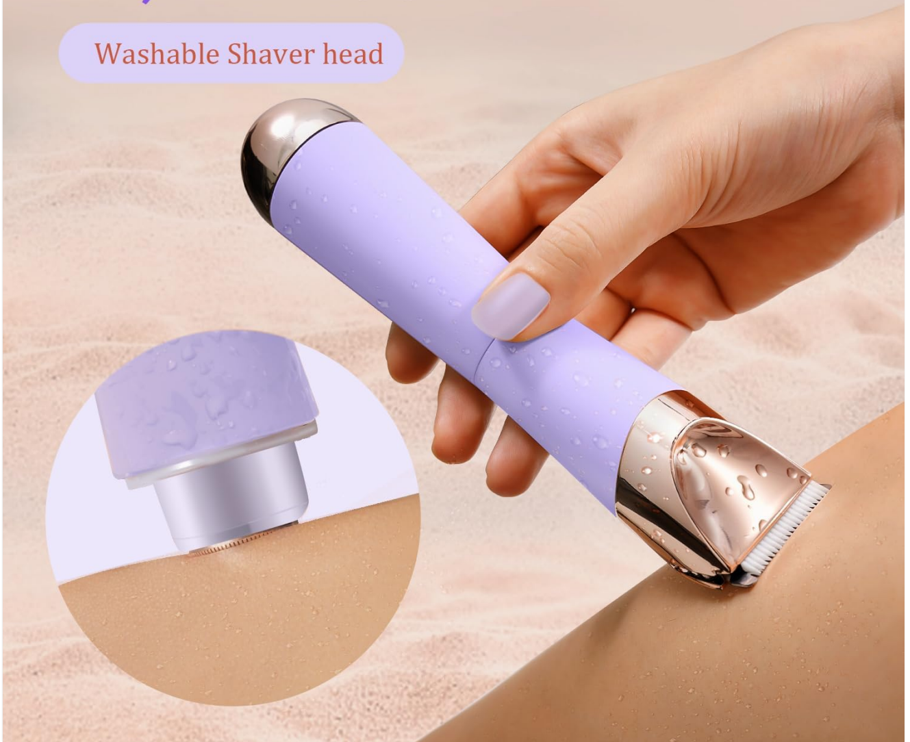
Figure 2.4: The trimmer being held over wet skin, highlighting its waterproof design for whole-body washability.