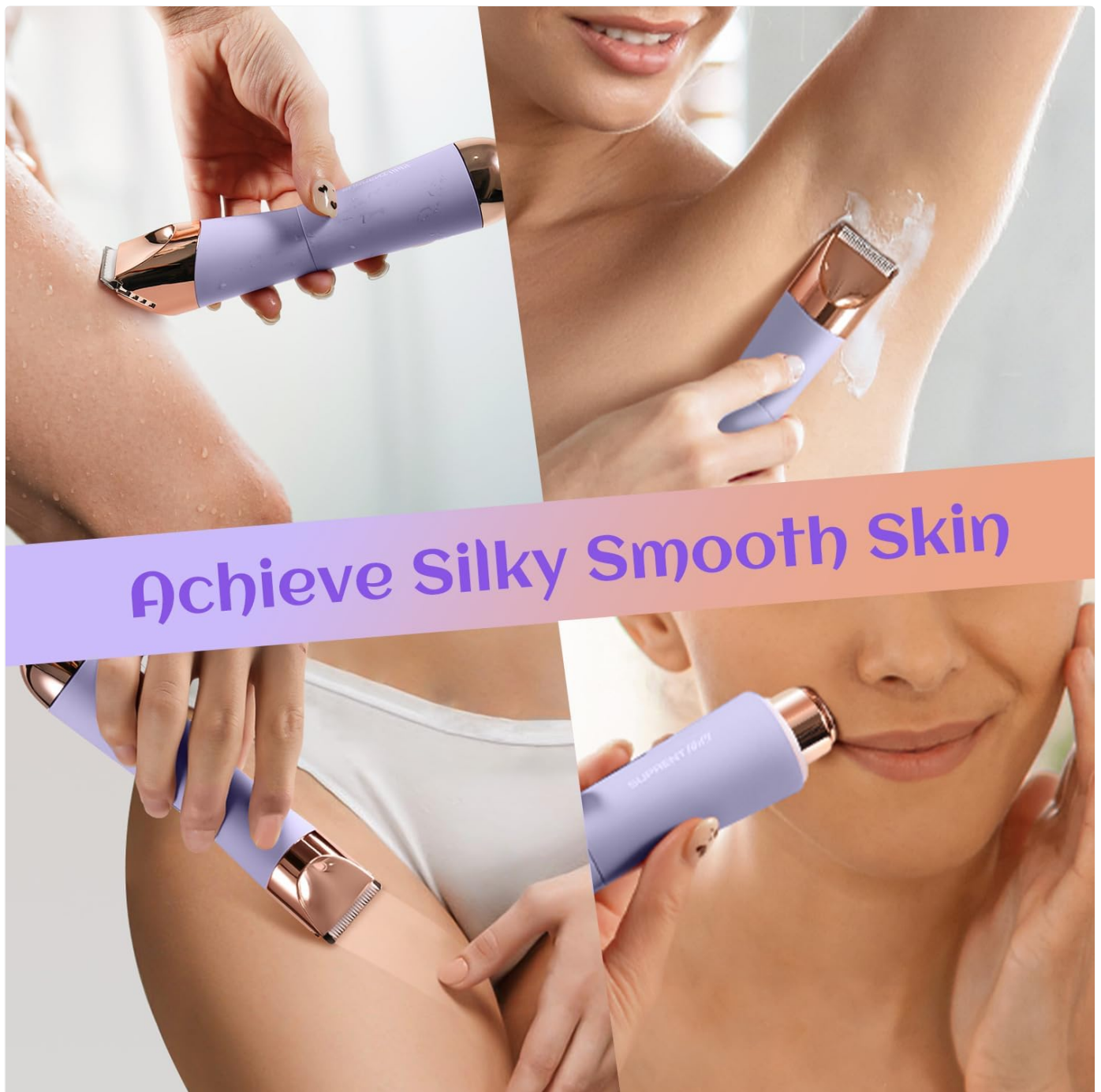
Figure 4.2: A visual representation of the trimmer being used for different grooming needs, including bikini line, underarms, and facial areas, to achieve smooth skin.