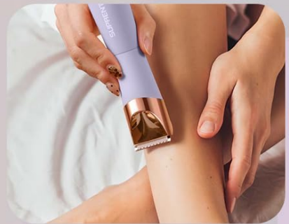
Figure 4.1: The trimmer demonstrating its versatility for use on facial hair, underarms, and legs.