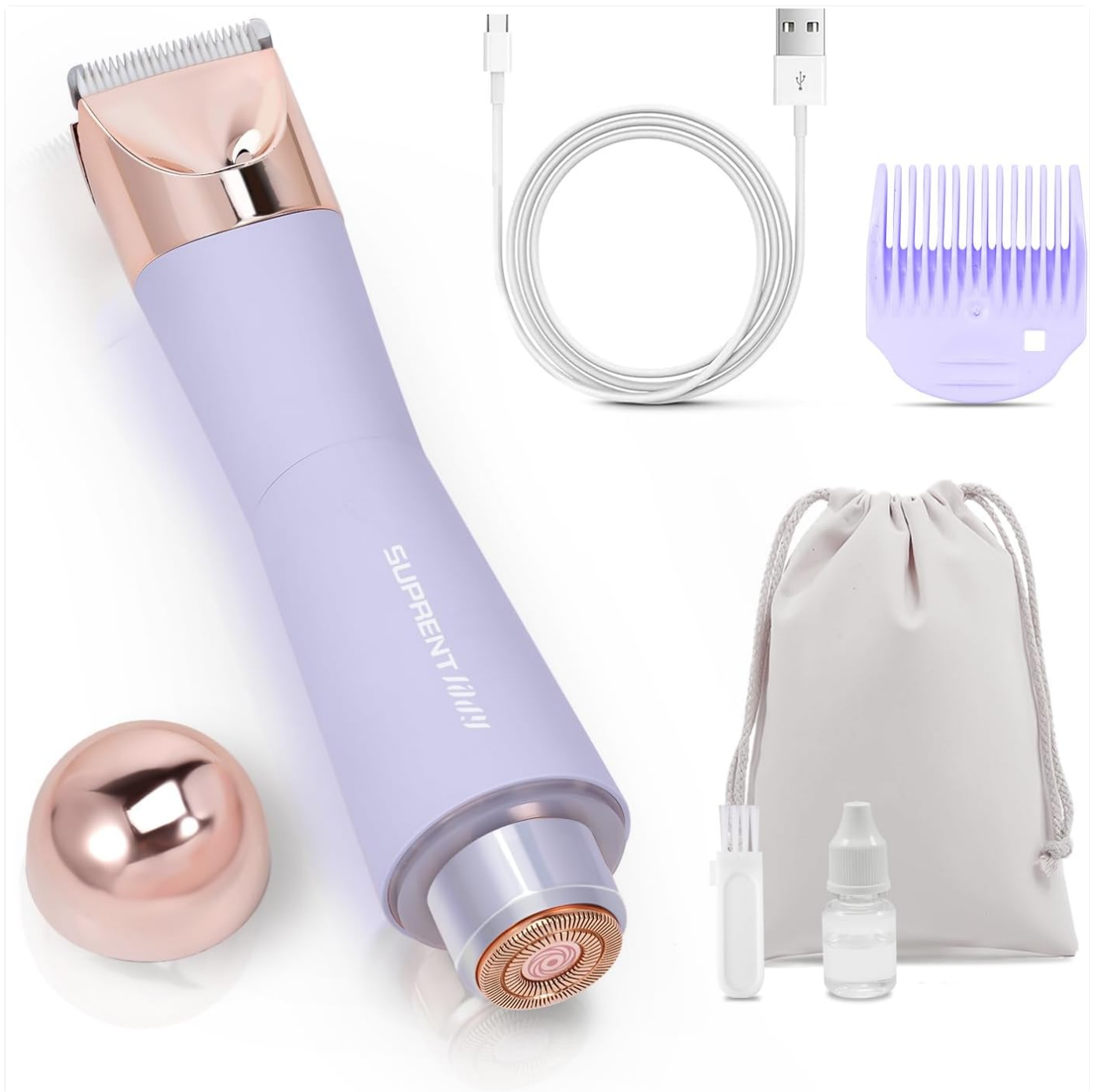
Figure 2.1: The SUPRENT BK215 Bikini Trimmer, showing the main unit with two interchangeable heads, a USB-C charging cable, a cleaning brush, a small bottle of blade oil, a length guide comb, and a storage bag.