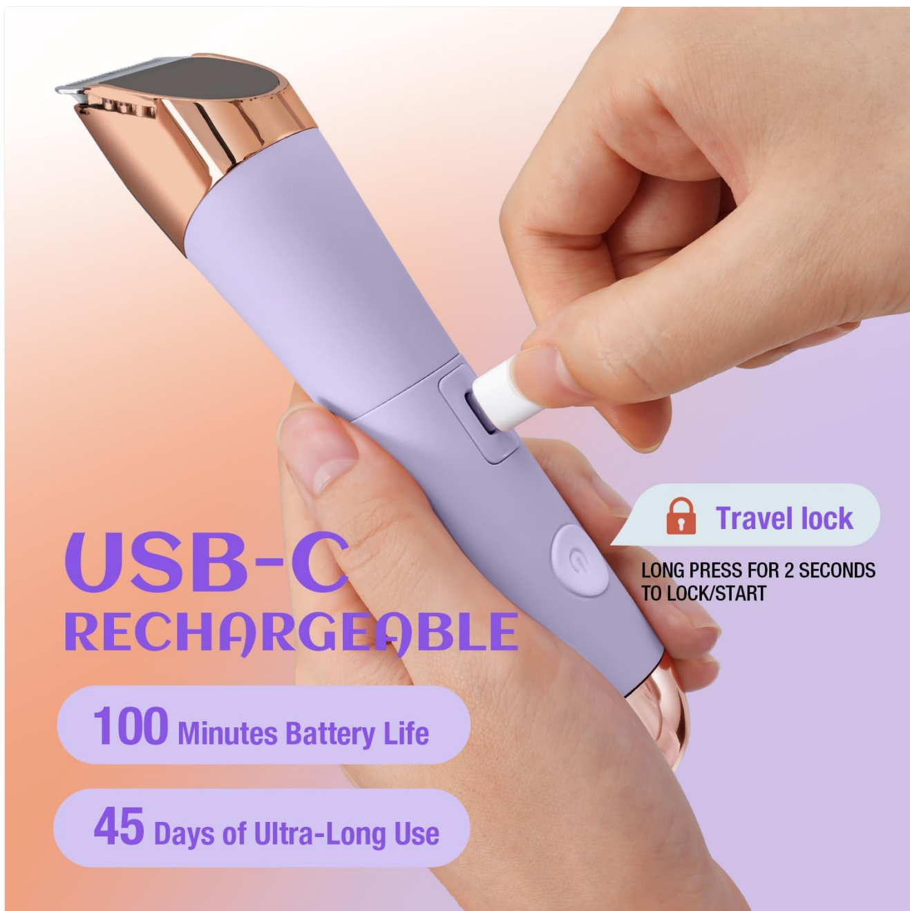
Figure 2.5: A close-up of the trimmer's USB-C charging port and the power button, which also functions as a travel lock when pressed for 2 seconds.