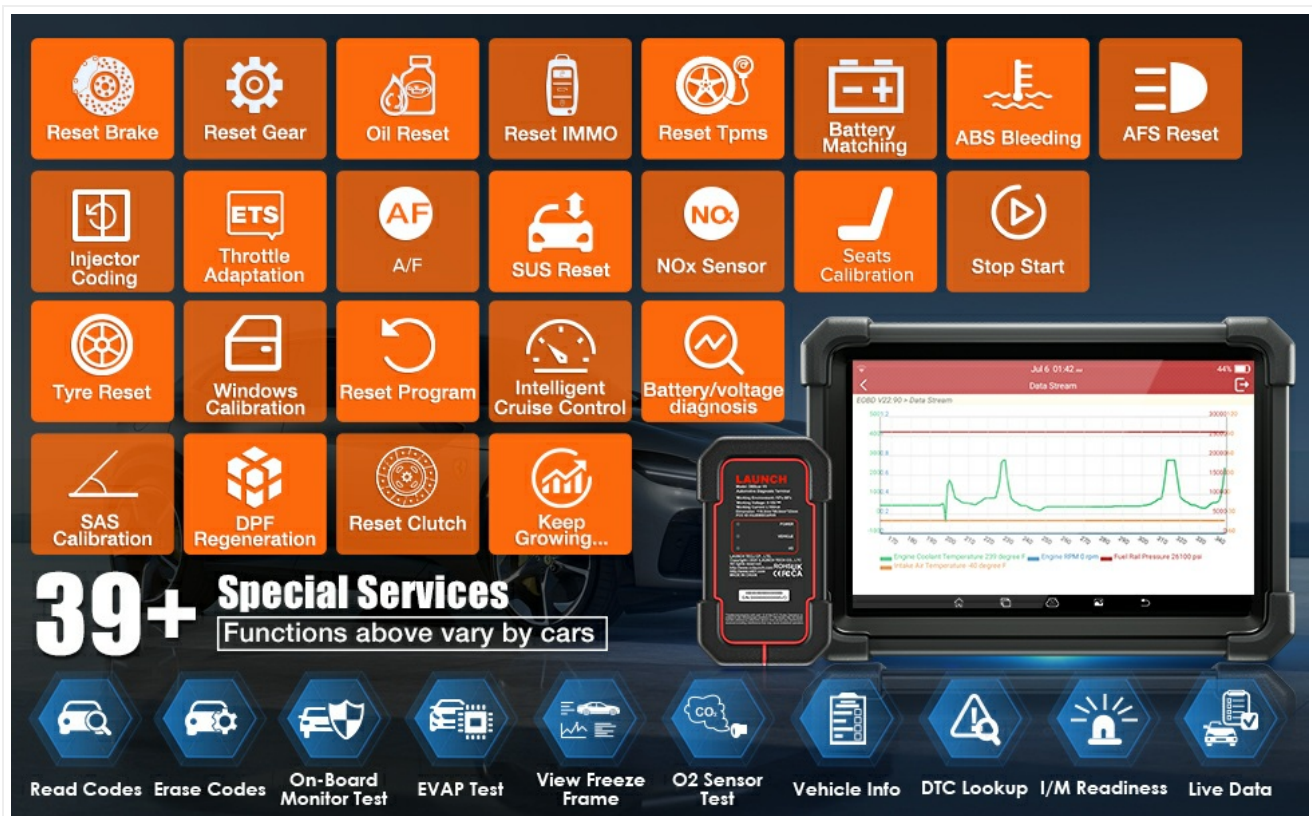
Image 4.5: The tablet interface showcasing the extensive list of over 39 special service functions available.