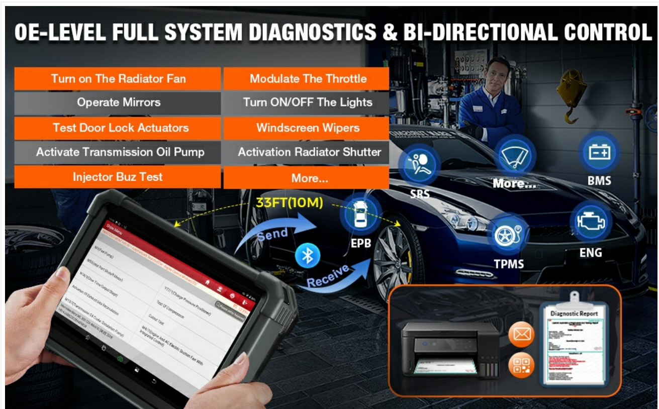
Image 4.4: A tablet screen displaying system controls for various vehicle functions, demonstrating bidirectional control capabilities.