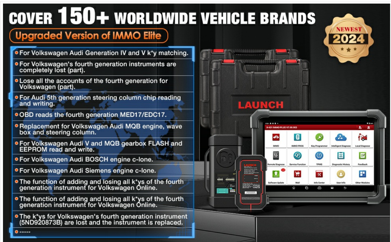
Image 4.1: The diagnostic tablet interface showing vehicle diagnostic options and broad compatibility.