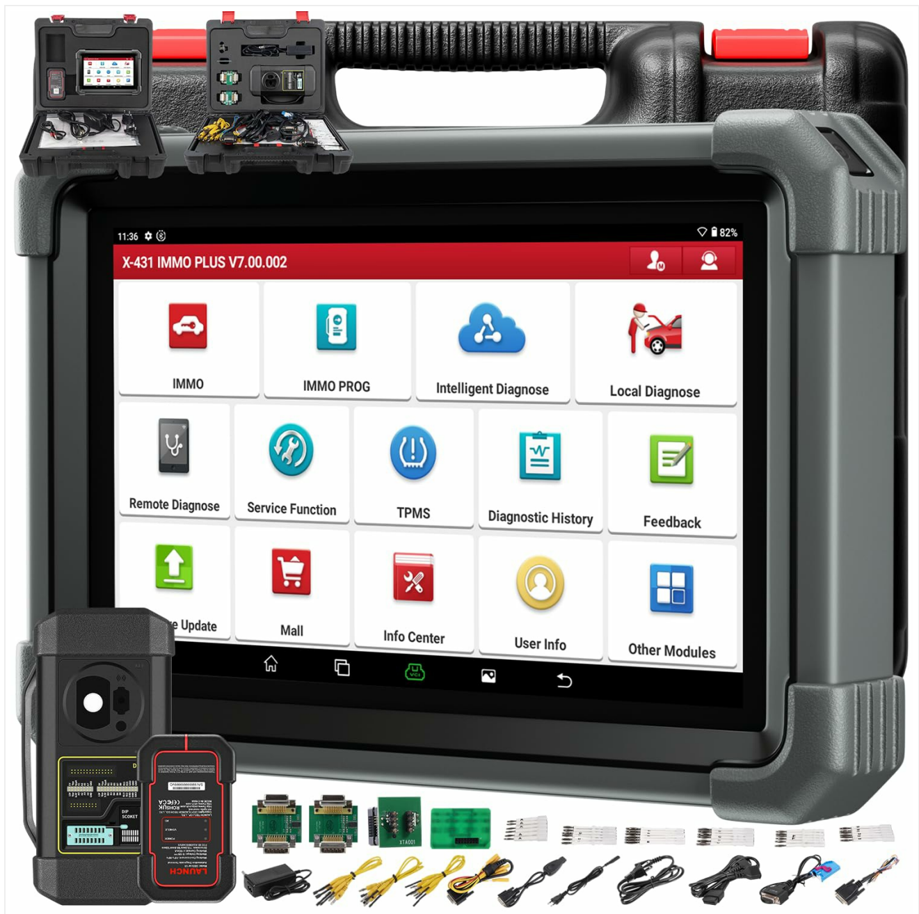
Image 1.1: The LAUNCH X431 IMMO Plus diagnostic device shown with the X-PROG3 key programmer.