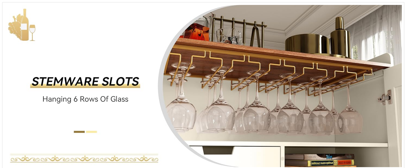
Image: A close-up view of the six rows of stemware slots, designed to securely hang wine glasses within the cabinet.