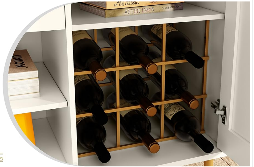
Image: A close-up view of the liquor rack, designed to hold up to nine wine bottles securely within the cabinet's lower section.