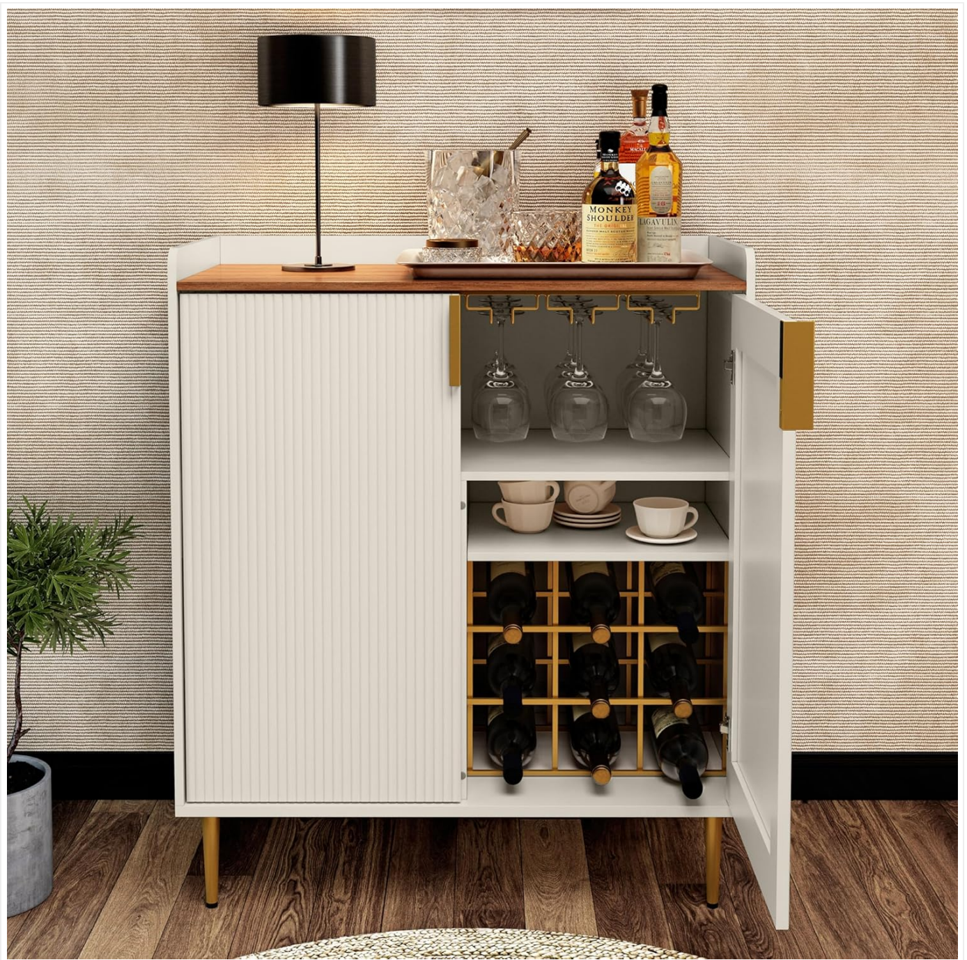
Image: The ARTPOWER Wine Bar Cabinet in white, featuring a fluted texture on the left door and an open right section displaying wine bottles, glasses, and a small lamp on top.