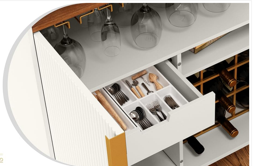
Image: A close-up view of the cabinet's drawer, shown open with various bar tools and cocktail napkins neatly organized inside.