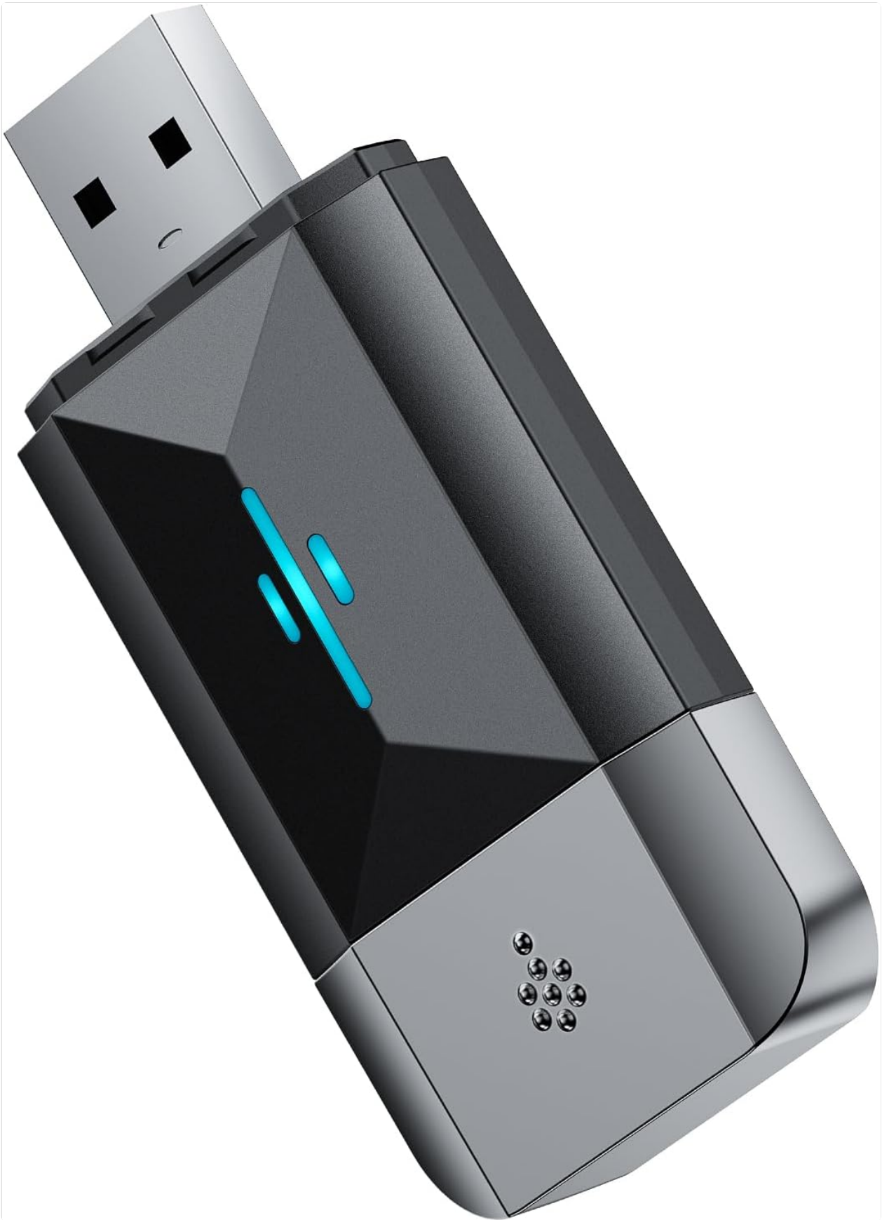
Image 1: The Volam 2 in 1 Wireless CarPlay & Android Auto Adapter, showcasing its compact design and USB connector.