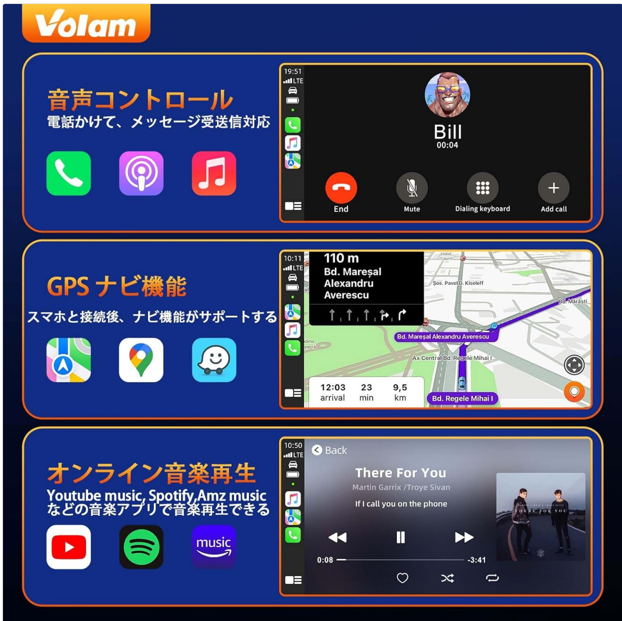
Image 6: Screenshots from a car display showing voice control features for calls, GPS navigation with map details, and online music playback interface.