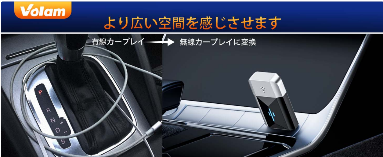
Image 2: Visual representation of converting a wired CarPlay connection to a wireless connection using the adapter, highlighting the benefit of a clutter-free car interior.