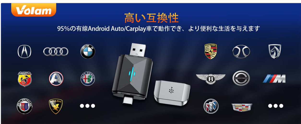
Image 3: The adapter shown alongside logos of various compatible car brands, indicating broad compatibility with vehicles that support wired CarPlay/Android Auto.