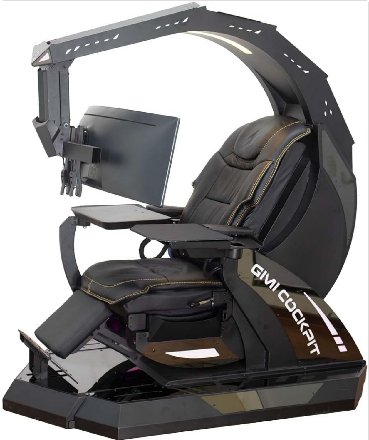
Figure 1: The Emperor GM-520 Zero Gravity Reclining Gaming Workstation in its standard configuration.