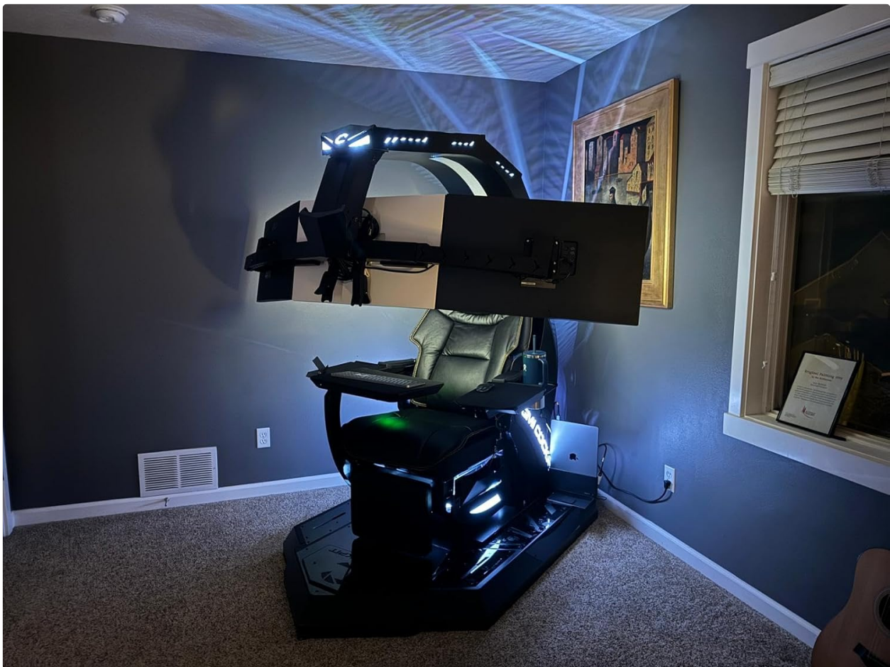
Figure 5: The Emperor GM-520 workstation integrated into a room setting, showcasing its ambient lighting features.