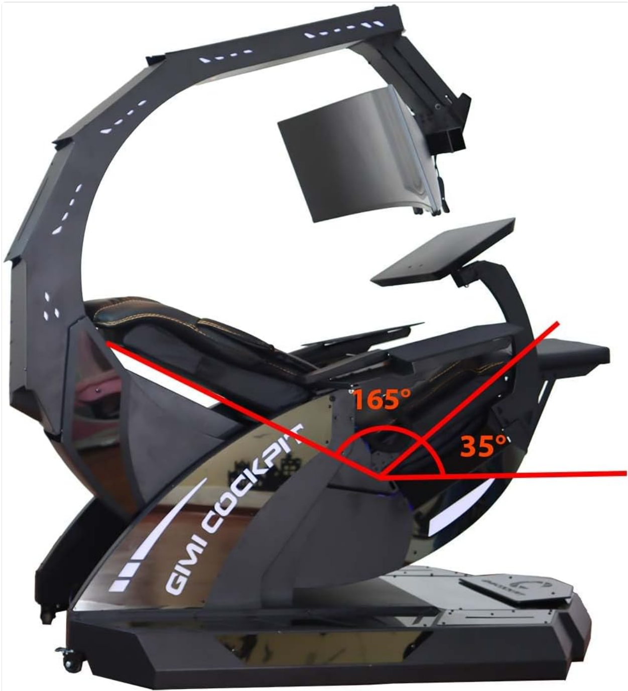
Figure 4: Illustration of the 165-degree backrest recline and 35-degree seat cushion recline capabilities of the GM-520 workstation.