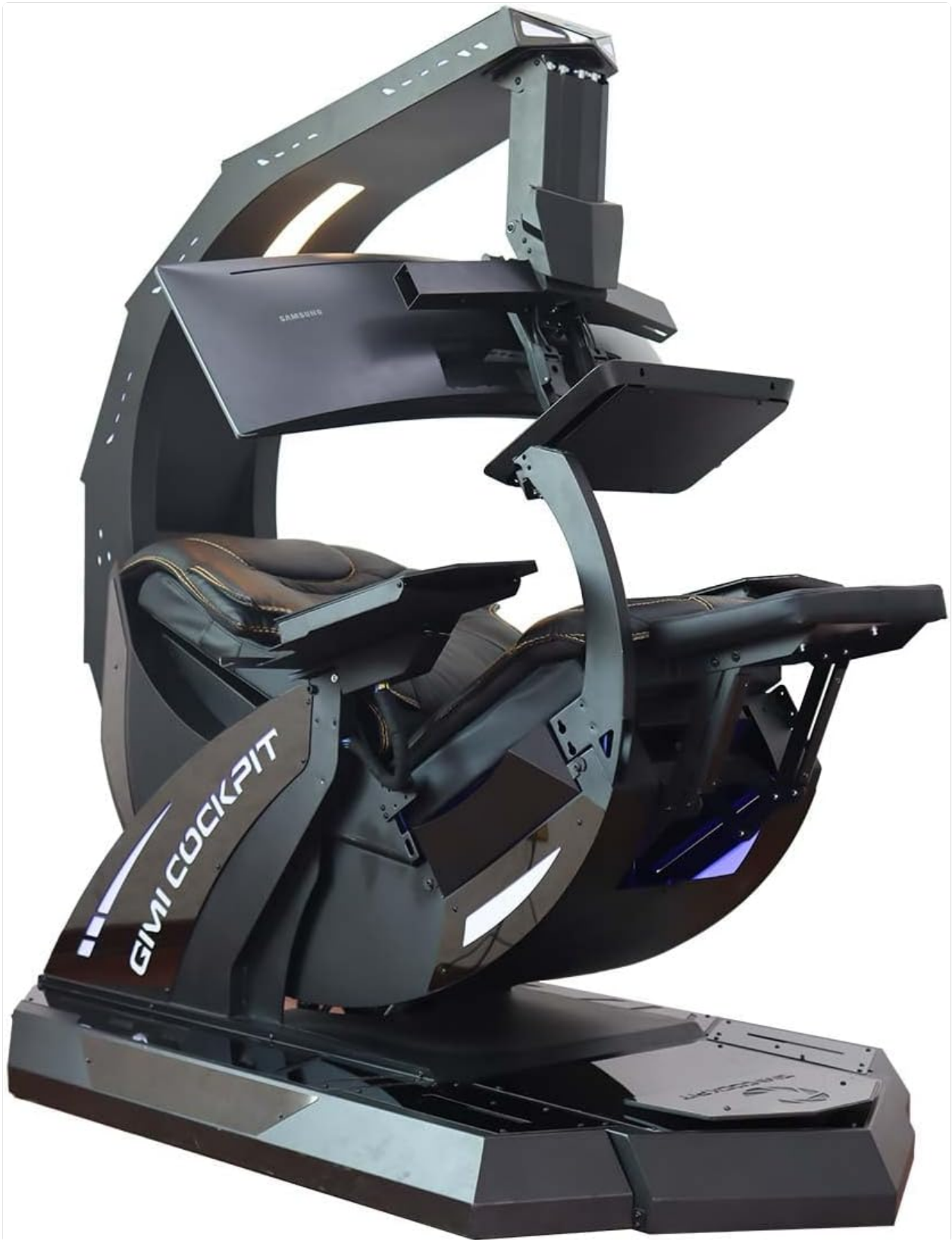
Figure 3: The workstation configured with a monitor and keyboard tray, demonstrating the adjustable components.