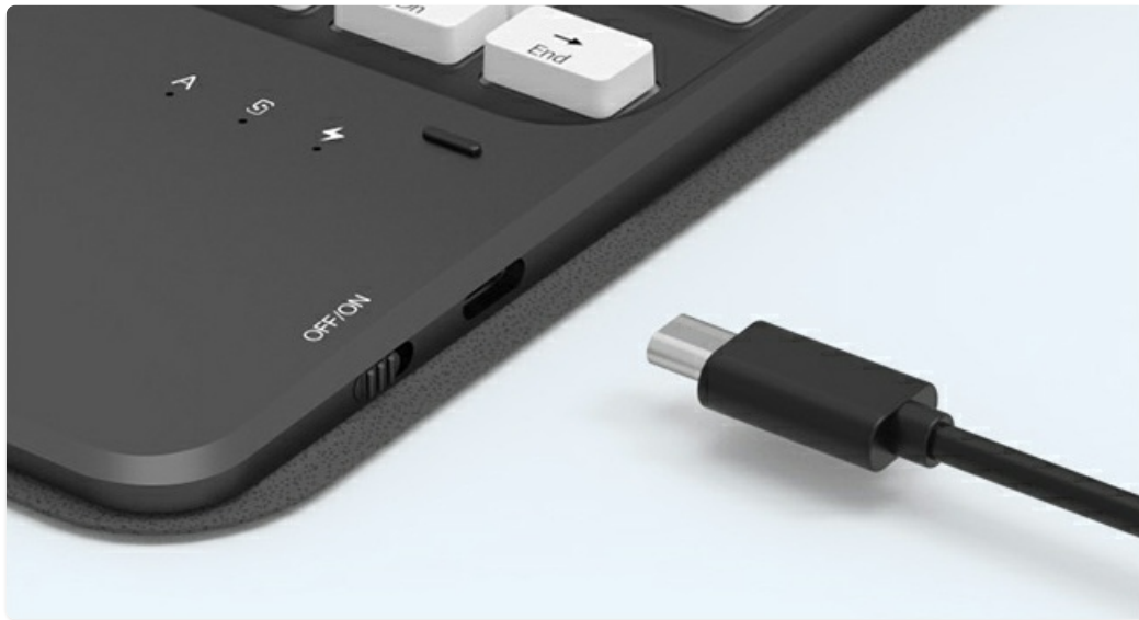
Image: Keyboard USB-C charging port.

Before first use, ensure the keyboard is fully charged. Connect a USB-C charging cable (not included) to the keyboard's charging port and a power source. The charging indicator light will show the charging status.