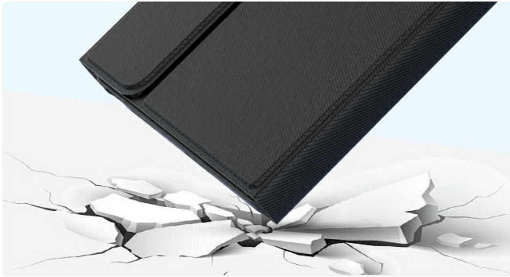
Image: Case demonstrating drop protection.