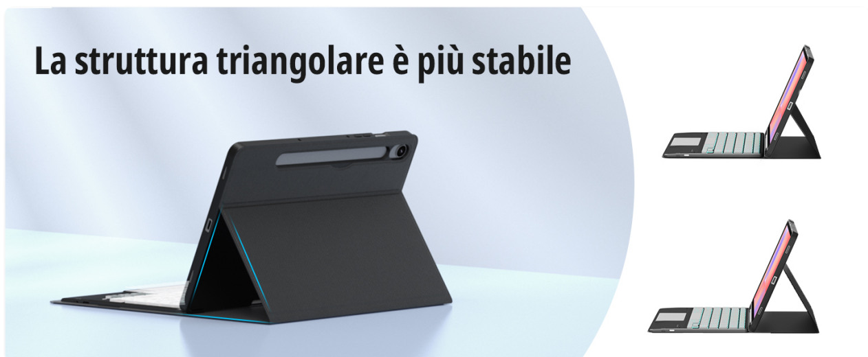
Image: Triangular stand functionality of the case.

The case features a stable triangular stand structure, allowing you to prop up your tablet at an optimal viewing or typing angle.