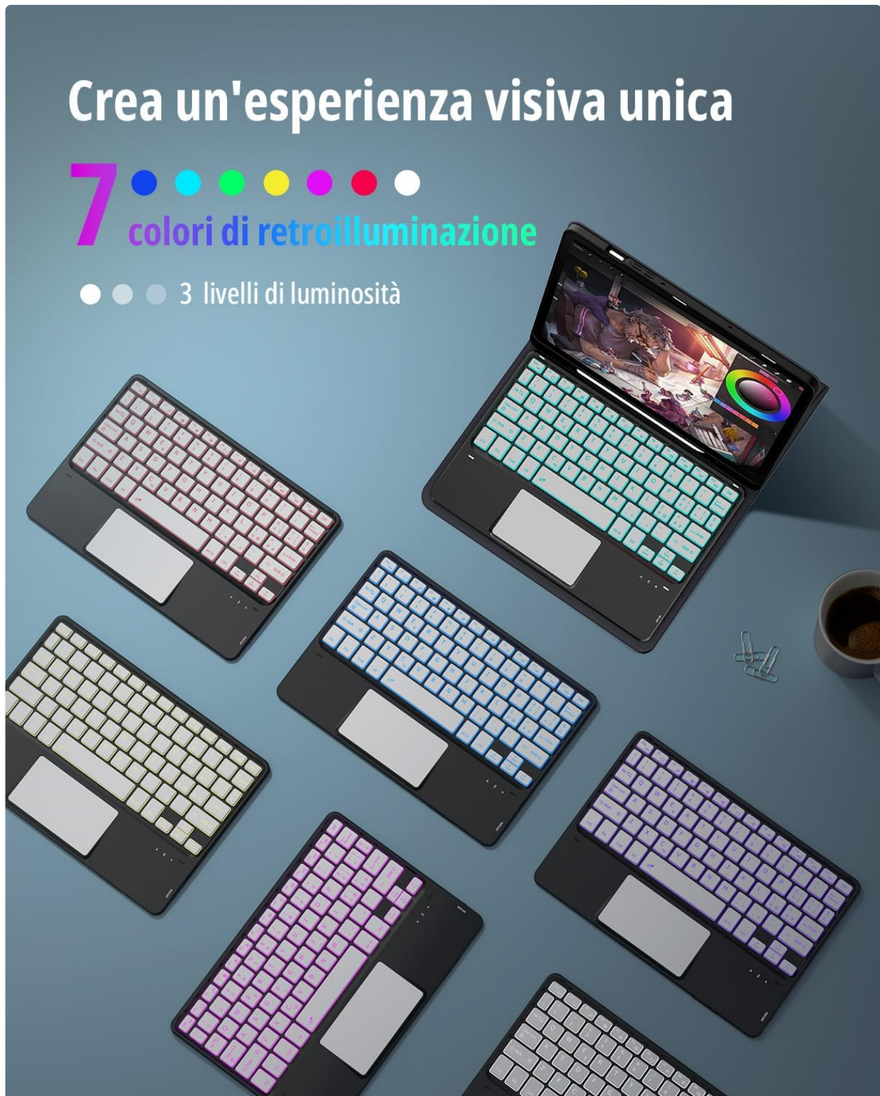
Image: Keyboard backlighting in various colors.