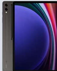
Samsung Galaxy Tab S9+ (12.4-pollici)