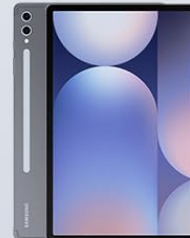
Samsung Galaxy Tab S10+ (12.4-pollici)

Image: Compatibility chart for CACOE K08 Keyboard Case.