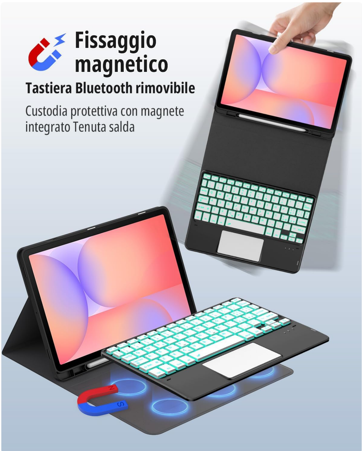
Image: Detachable magnetic keyboard.

Custodia protettiva con magnete integrato Tenuta salda