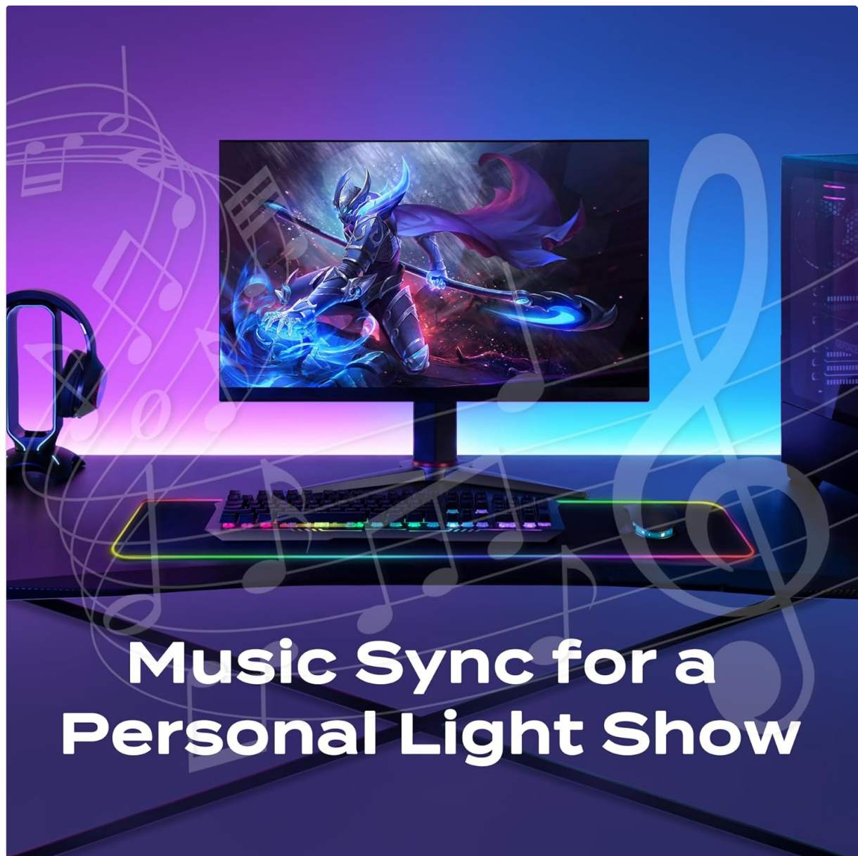
Image: A gaming desk setup with the LED strip lights installed, demonstrating the music sync feature for a personal light show.