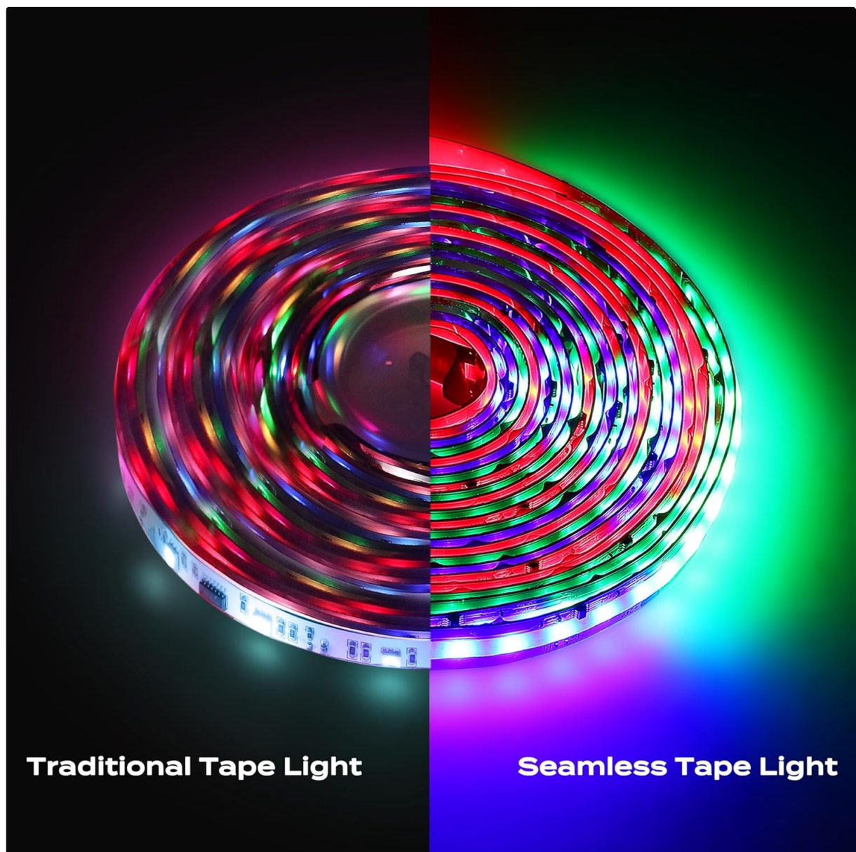
Image: A visual comparison showing the difference between traditional LED tape light with visible dots and the seamless illumination provided by the COB technology of this light strip.