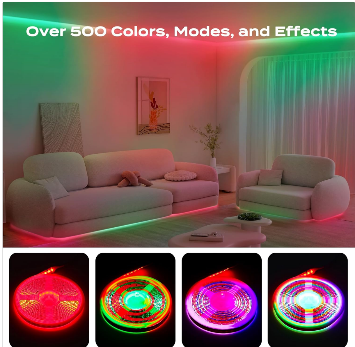
Image: A living room showcasing the wide range of over 500 colors, modes, and effects achievable with the BRIGHTLUX LED strip light.