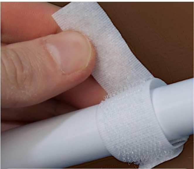
2. Fixations auto-agrippantes pratiques