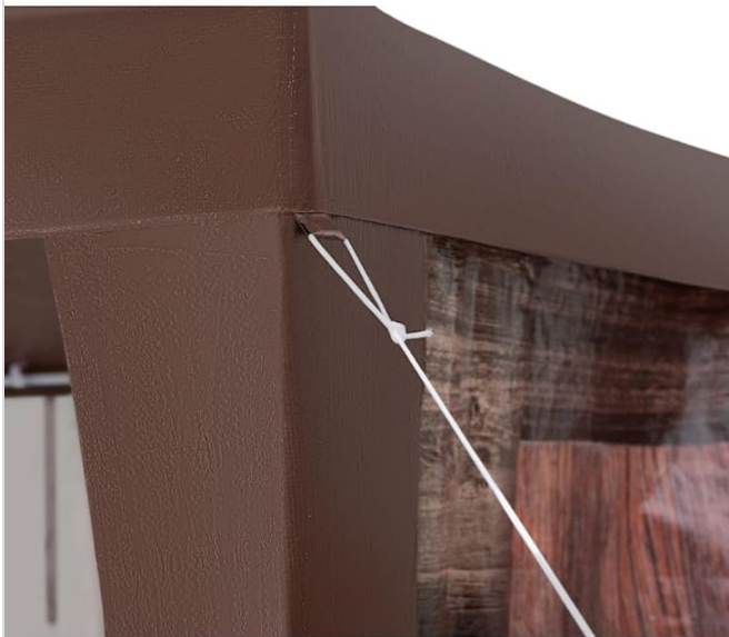
3. Cordes résistantes pour une stabilité accrue