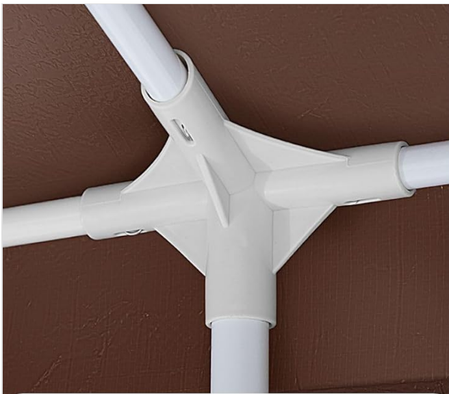
1. Montage facile et rapide par emboîtement