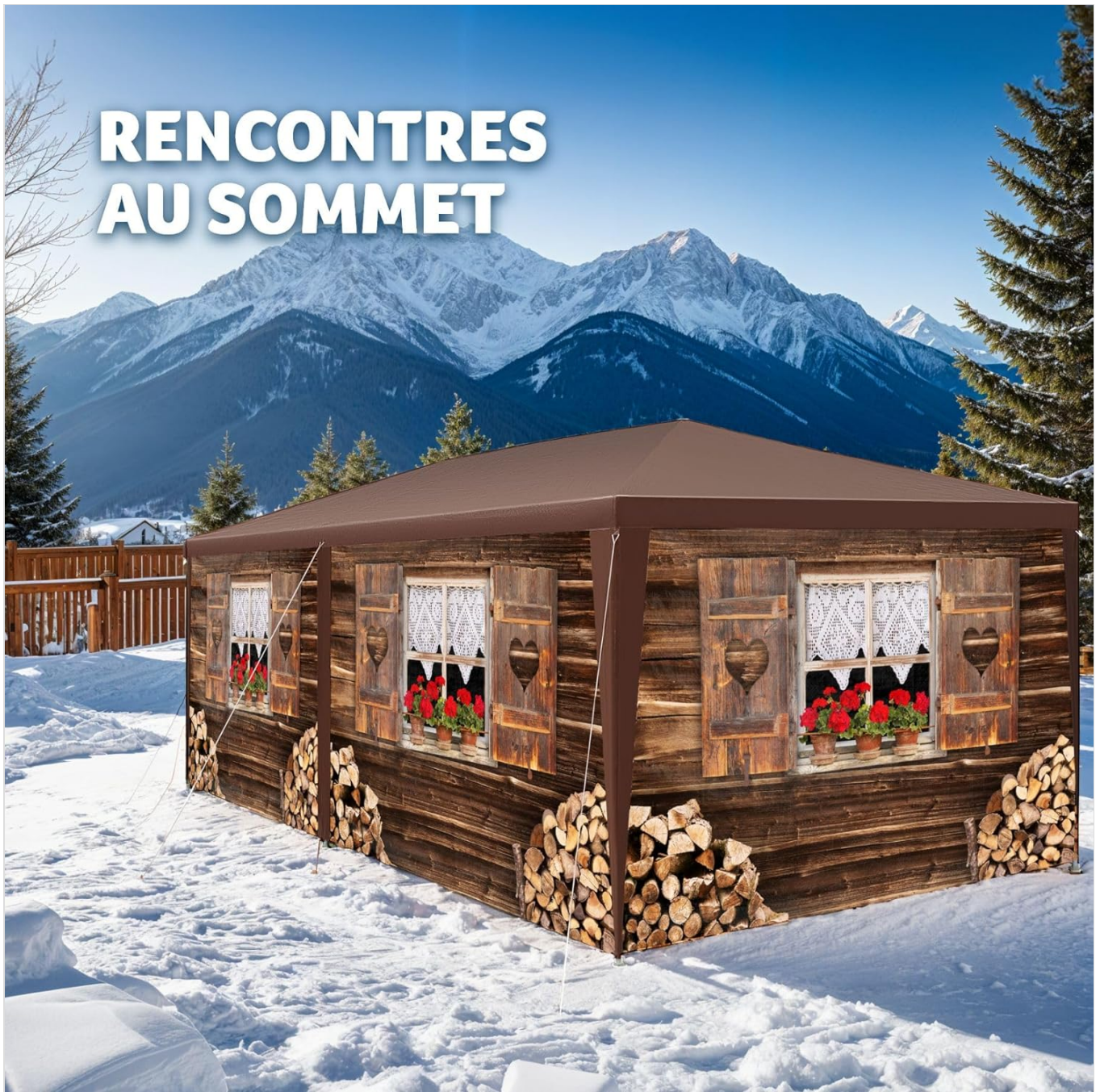
Image: The gazebo in a snowy setting, highlighting its potential for use in different climates and seasons.