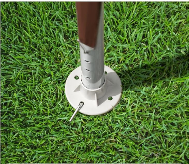
4. Pieds ancrables à l'aide de piquets