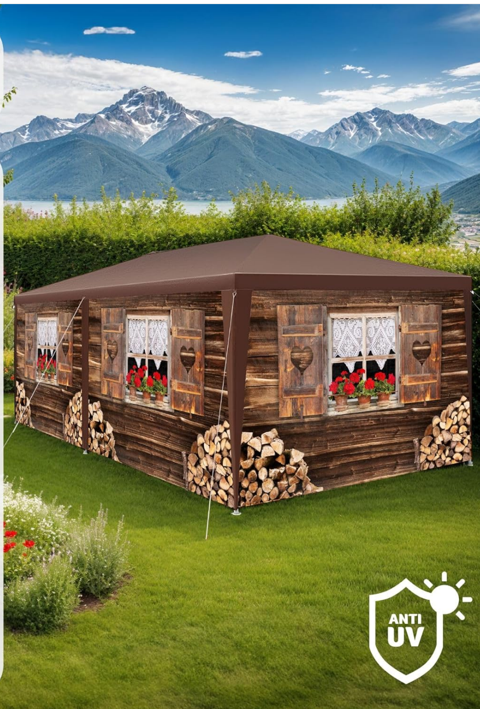
Image: Features of the tectake® gazebo, including its charming chalet style, 100% waterproof fabric, robust epoxy-coated steel frame, quick assembly, 6 flexible roll-up side panels, high stability with 6 feet and tension cables, high UV resistance, and solid anchoring with 12 pegs.

avec 12 piquets pour une stabilité supplémentaire