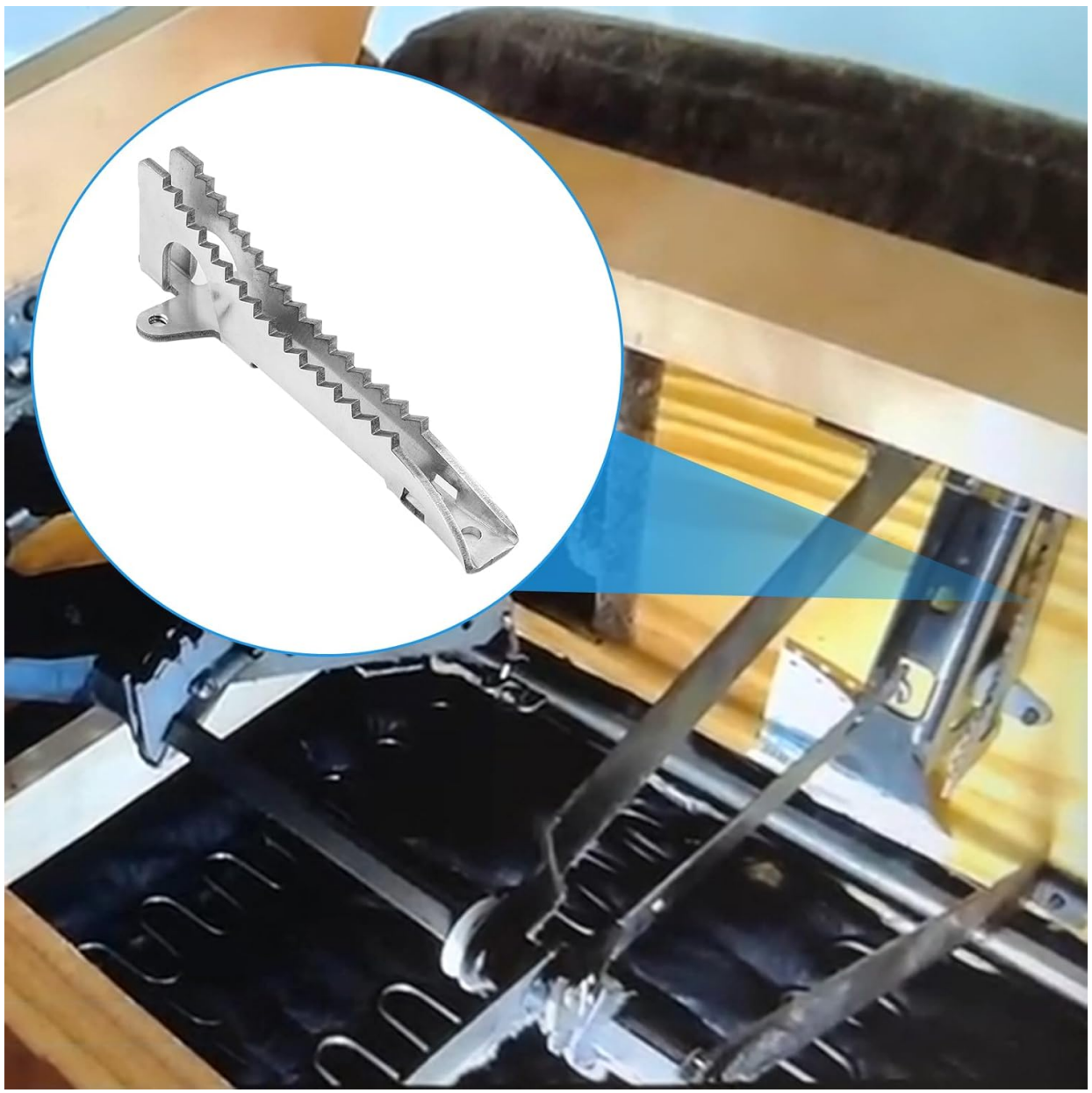
Image: The GNPADR Recliner Ratchet Pawl Rack shown in context within a recliner's internal mechanism, highlighting its placement for proper function.