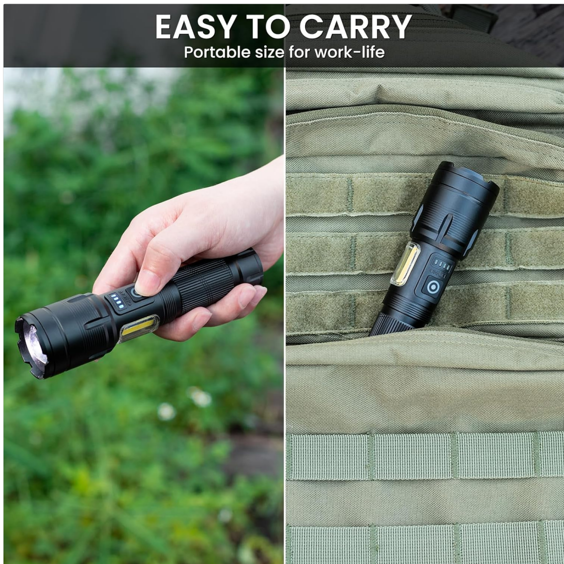
Image 1.2: The GDPLUS flashlight's compact size for easy carrying.