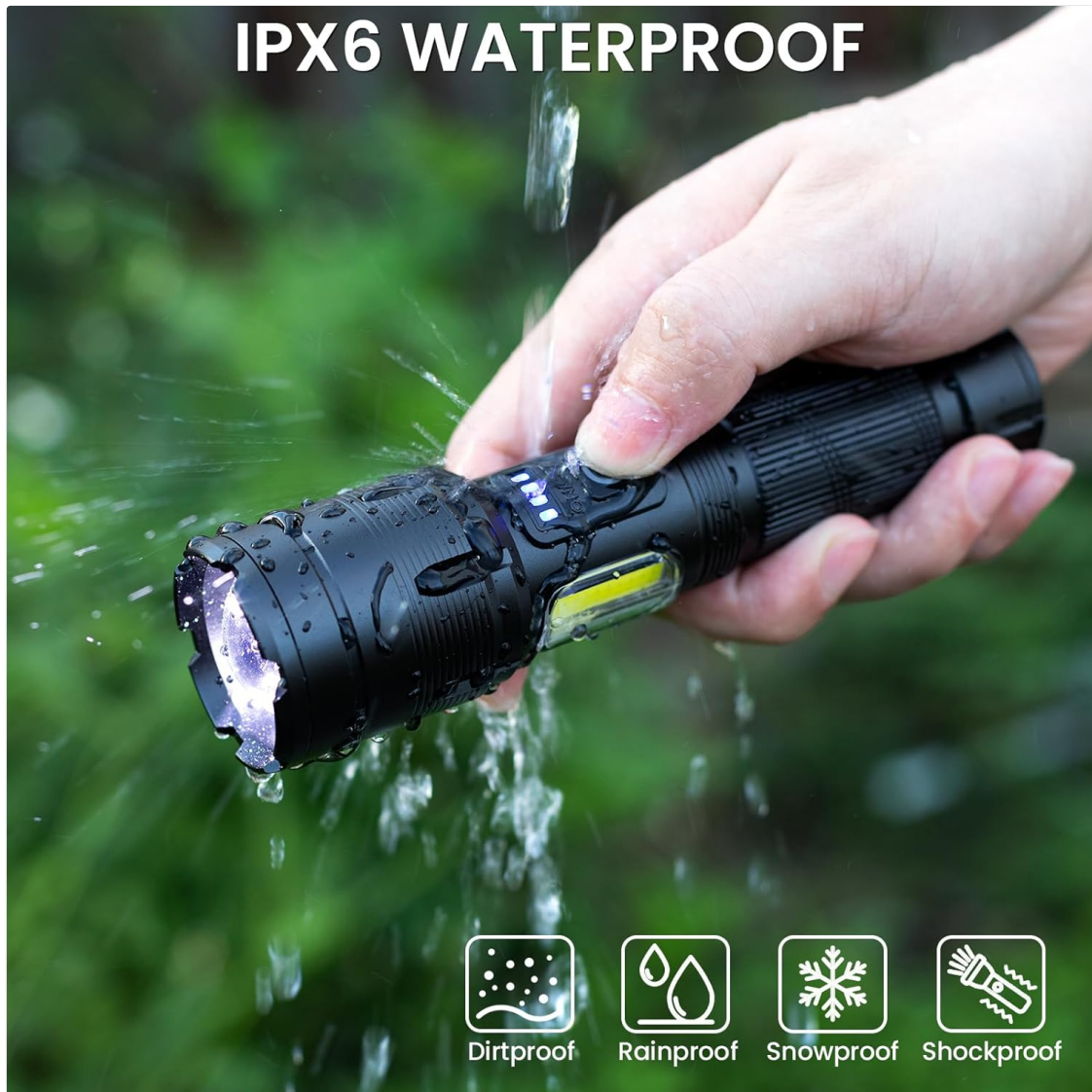
Image 4.1: The flashlight demonstrating its IPX6 waterproof capability.

The GDPLUS M007-COB flashlight is rated IPX7 waterproof, meaning it can withstand immersion in water up to 1 meter for 30 minutes. While it is highly water-resistant, avoid prolonged submersion or operating the flashlight underwater unless specifically designed for diving.