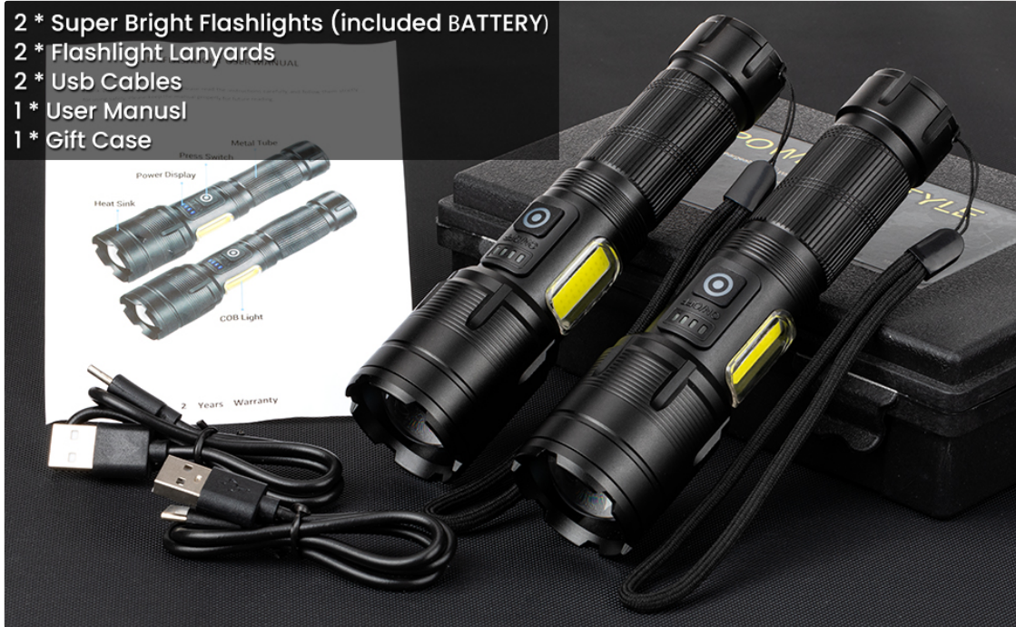
Image 1.1: Package contents of the GDPLUS M007-COB flashlight set.