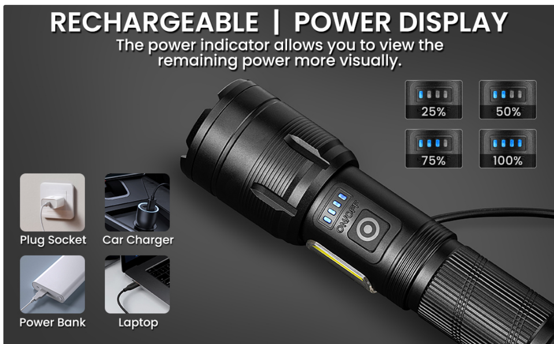
Image 2.1: Charging the GDPLUS flashlight and power indicator display.