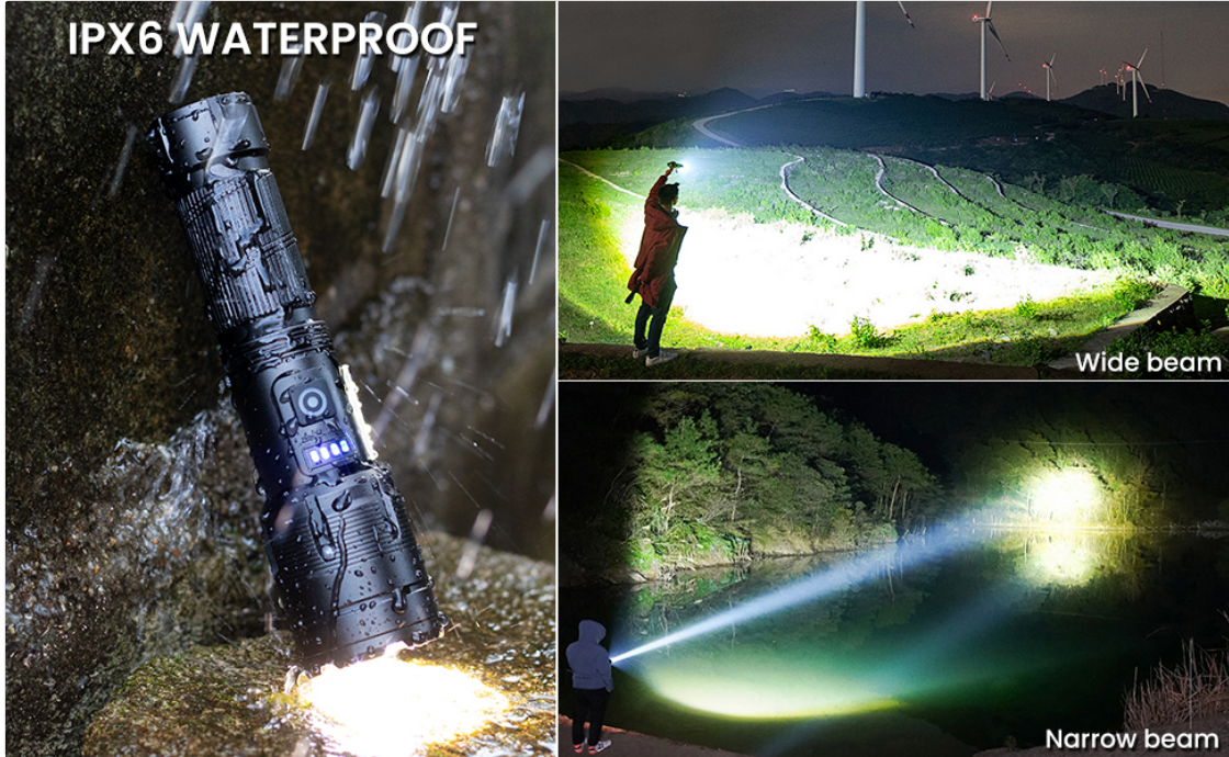
Image 3.2: Adjustable beam functionality and IPX6 waterproof feature.