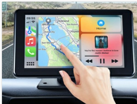
Image: Navigation interface displayed on the Carplay screen.

When connected via CarPlay or Android Auto, you can access your preferred navigation apps (e.g., Google Maps, Apple Maps, Waze) directly on the screen. Use voice commands or the touchscreen to enter destinations and follow directions.