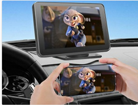
Image: Wireless HD Mirror Link functionality displaying smartphone content on the screen.