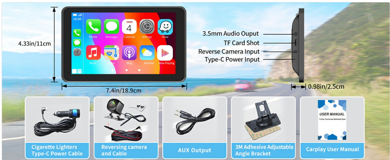
Image: Diagram illustrating the dimensions and port locations on the device.