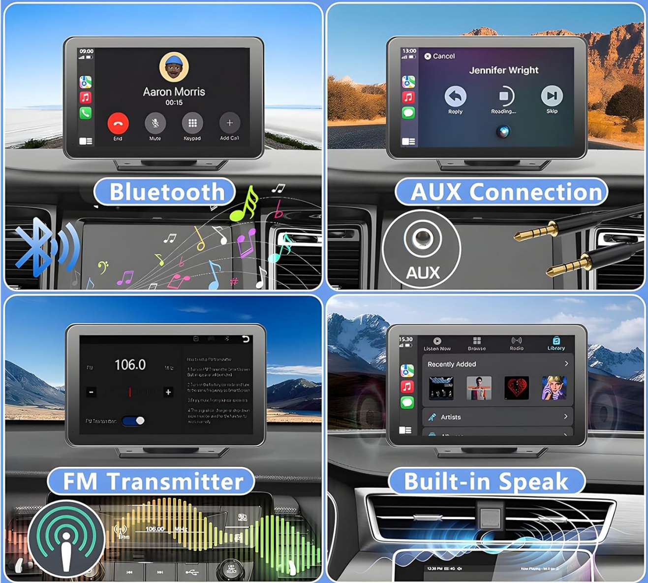
Image: Visual representation of the four available audio output methods.