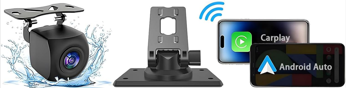
Image: The main product unit along with the backup camera, mounting bracket, and connection cables.