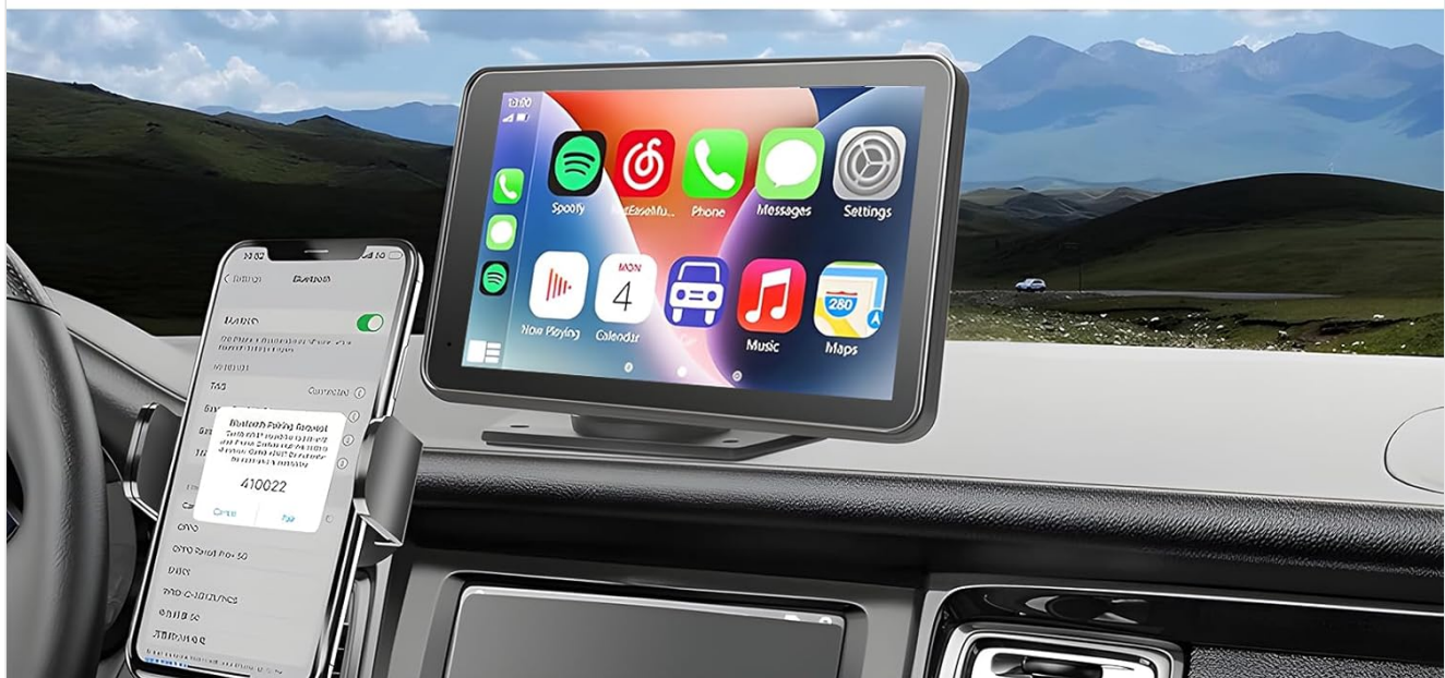
Image: Illustration of wireless connection for Apple CarPlay and Android Auto.