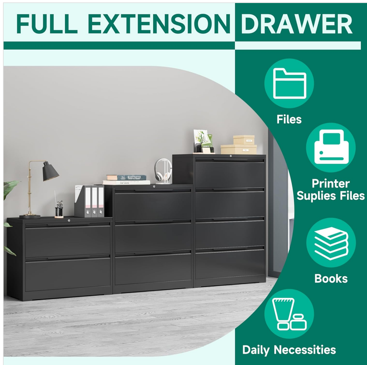
Image: Full extension drawer demonstrating ample storage space.

The drawers feature ball-bearing full suspension for smooth and quiet operation. Simply pull the drawer handle to open and push to close. The full extension design allows easy access to the entire drawer contents.