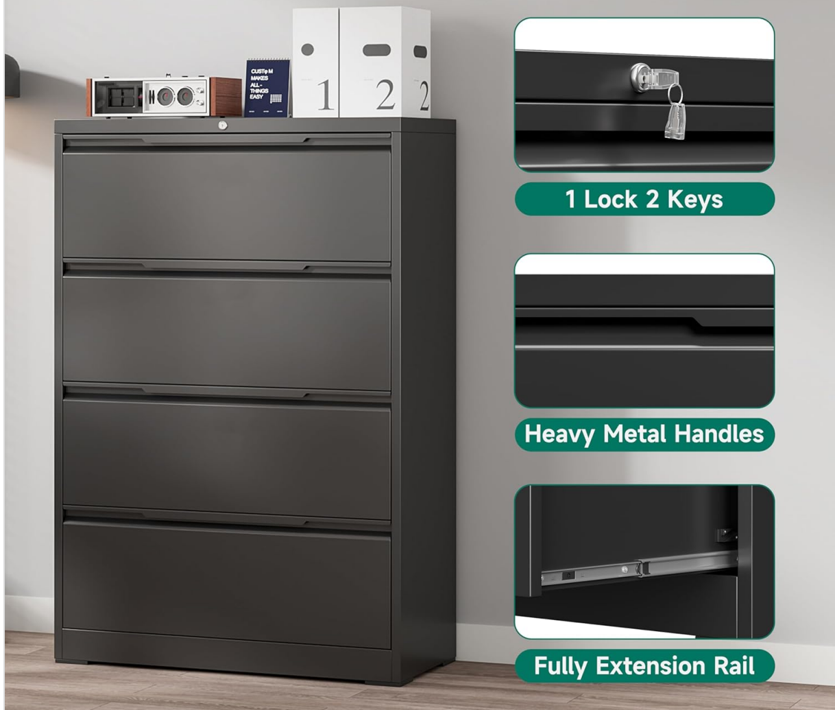
Image: Detail of the lock and included keys for securing the cabinet.