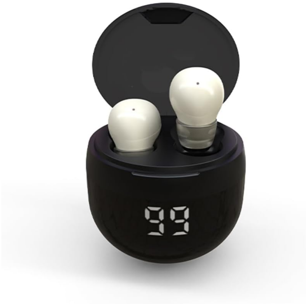
Figure 4.1: MSHUKCOE SK18 Wireless Earbuds in their charging case.