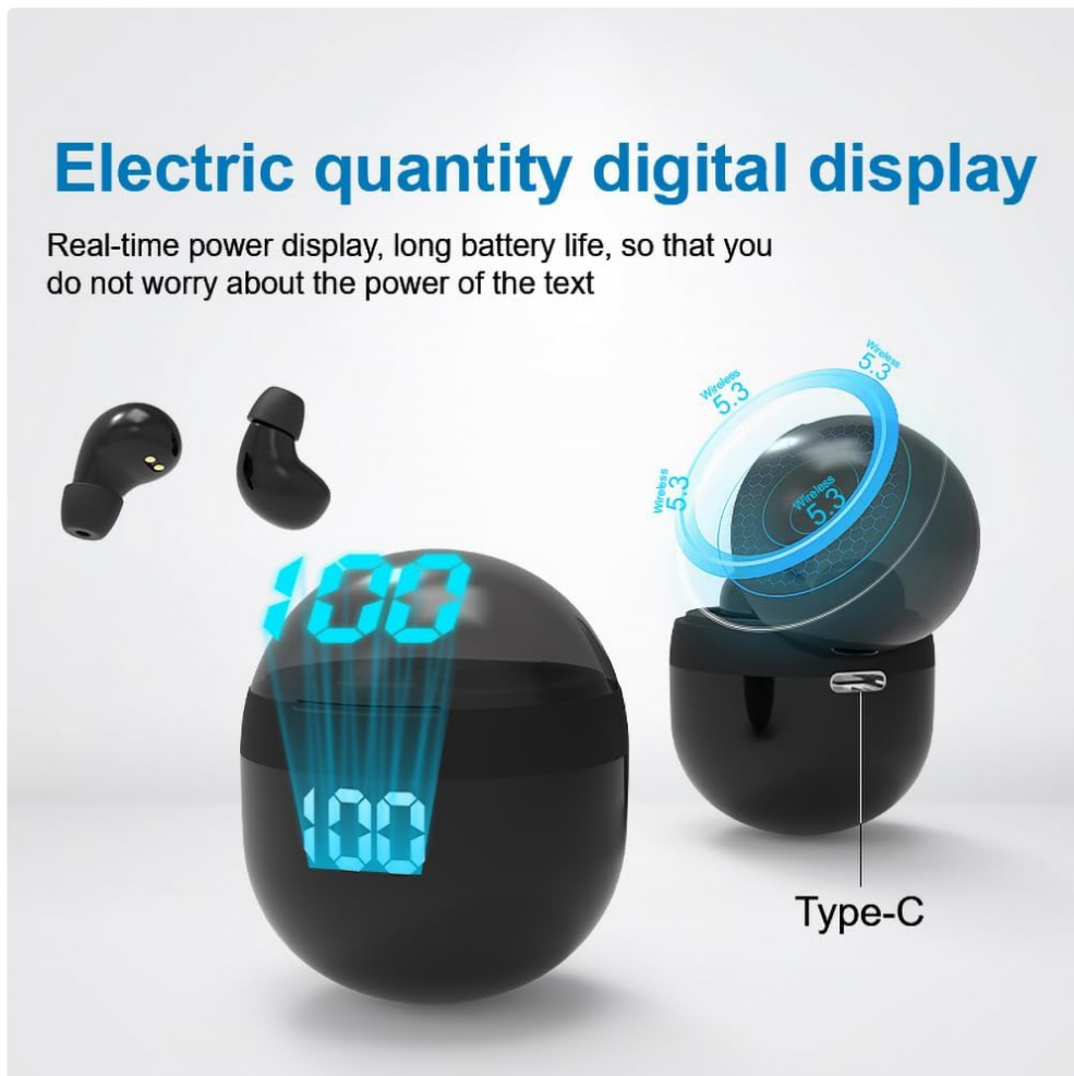
Figure 5.1: Charging the earbuds and case via Type-C port.