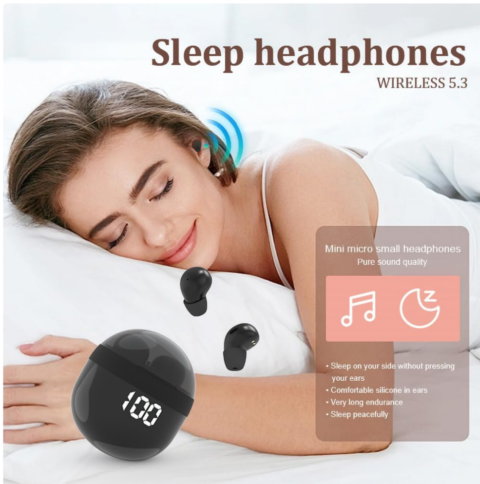
Figure 5.3: The SK18 earbuds are designed for comfortable wear, including during sleep.