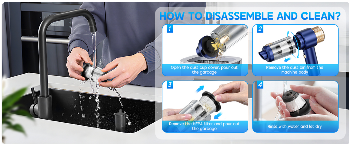
Image 5.2: Detailed steps for disassembling and cleaning the filters.