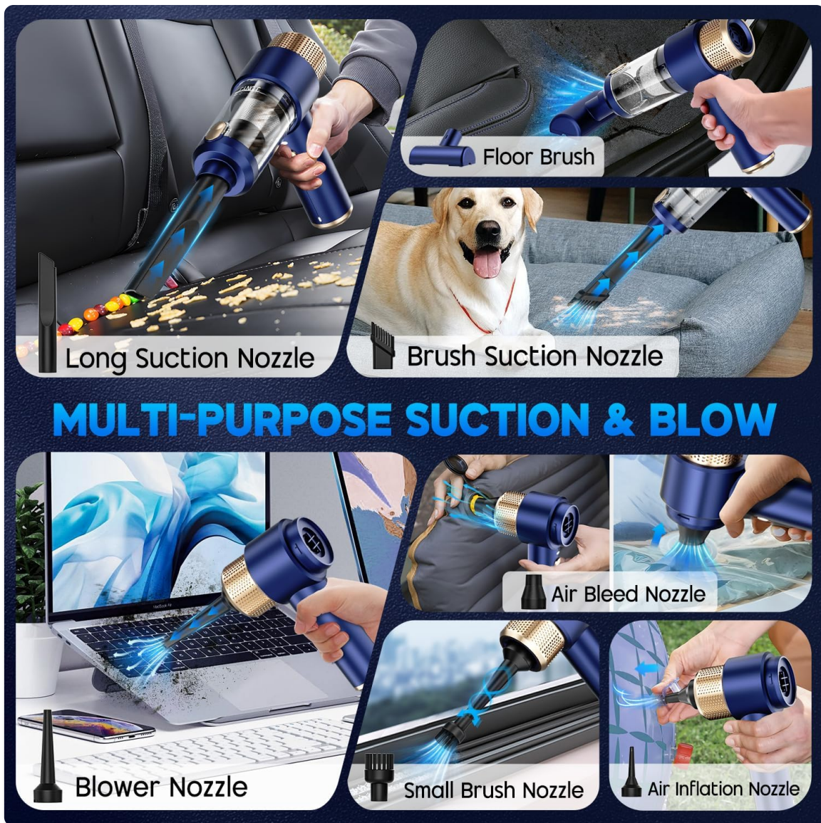
Image 4.2: Multi-purpose nozzles for diverse cleaning and inflation needs.