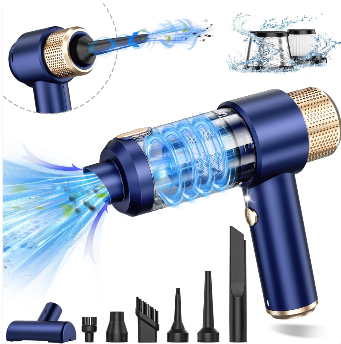
Image 1.1: JONYJ Handheld Car Vacuum Cleaner with included accessories.