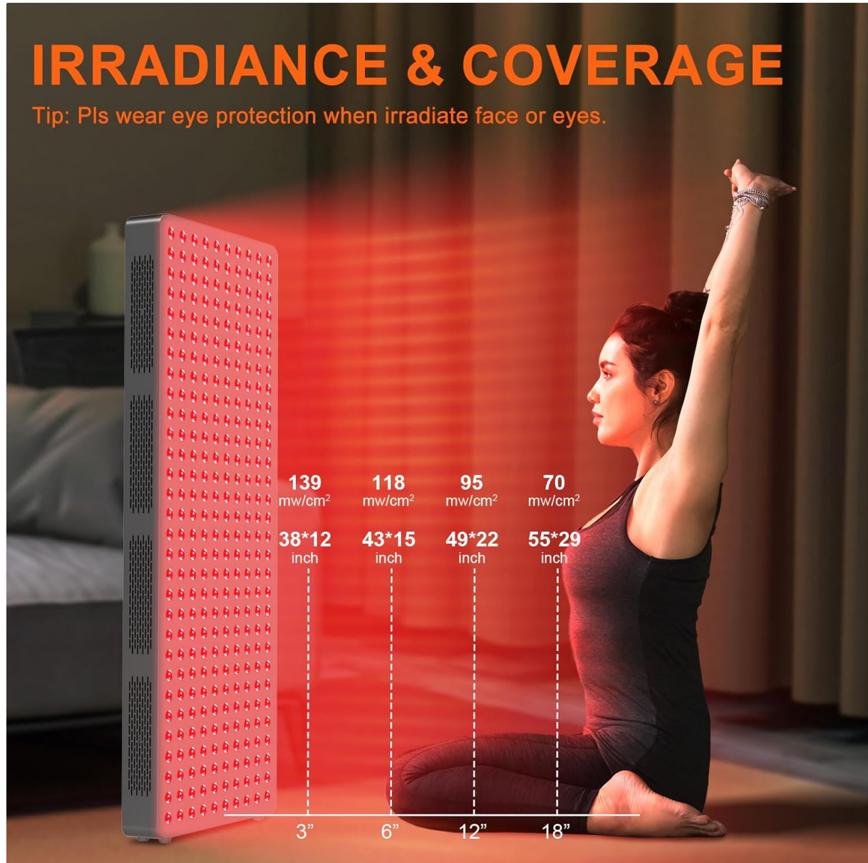
Figure 5: Diagram illustrating irradiance levels and coverage at various distances from the device.