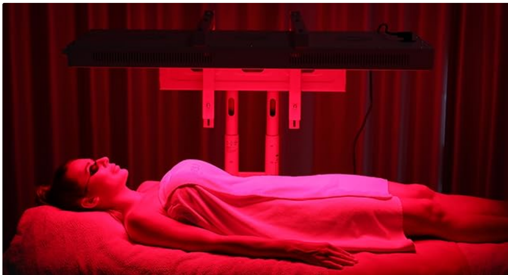
Figure 6: Example of a user receiving red light therapy in a horizontal position.