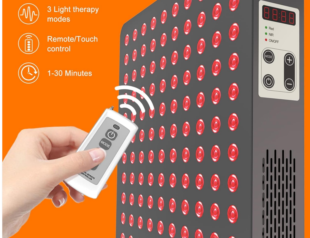
Figure 4: The device features a user-friendly control panel and remote for easy operation.