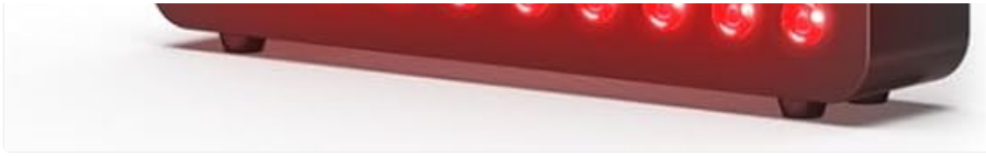
Figure 1: BONTANNY Red Light Therapy Device XL 400W.