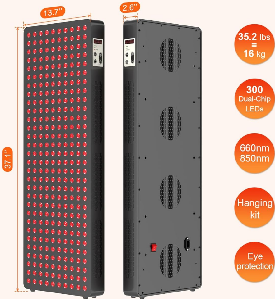
Figure 9: Visual representation of product dimensions and key specifications.