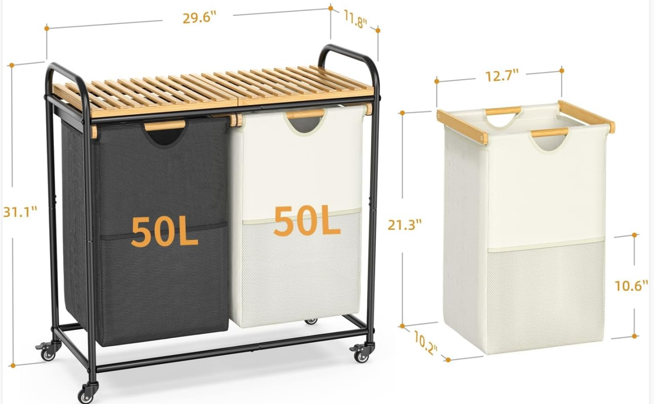
Image: Detailed dimensions and capacity information for the laundry hamper.