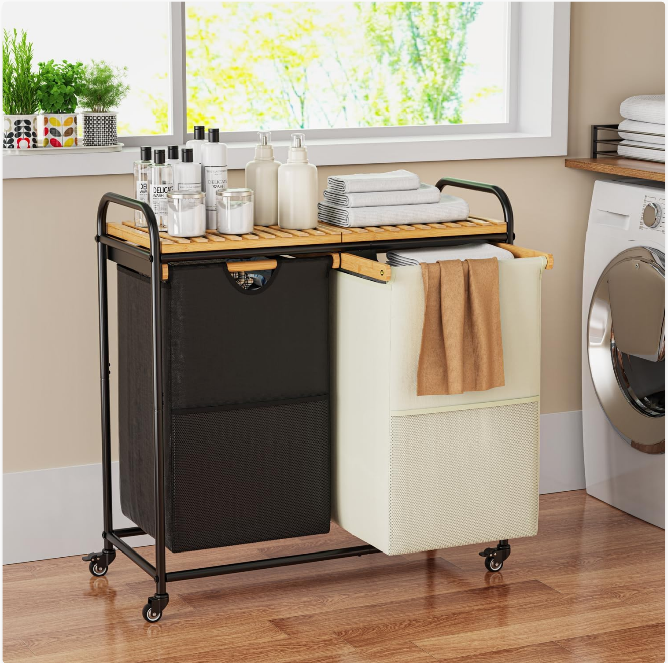
Image: The laundry hamper in a functional laundry room environment.