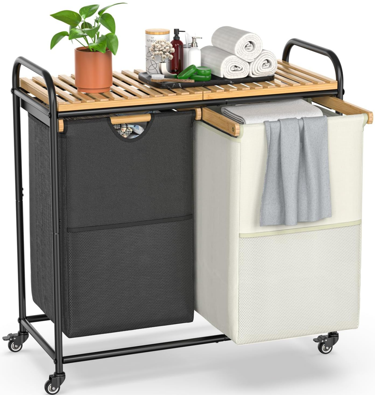
Image: The complete laundry hamper, showcasing the bamboo top shelf.