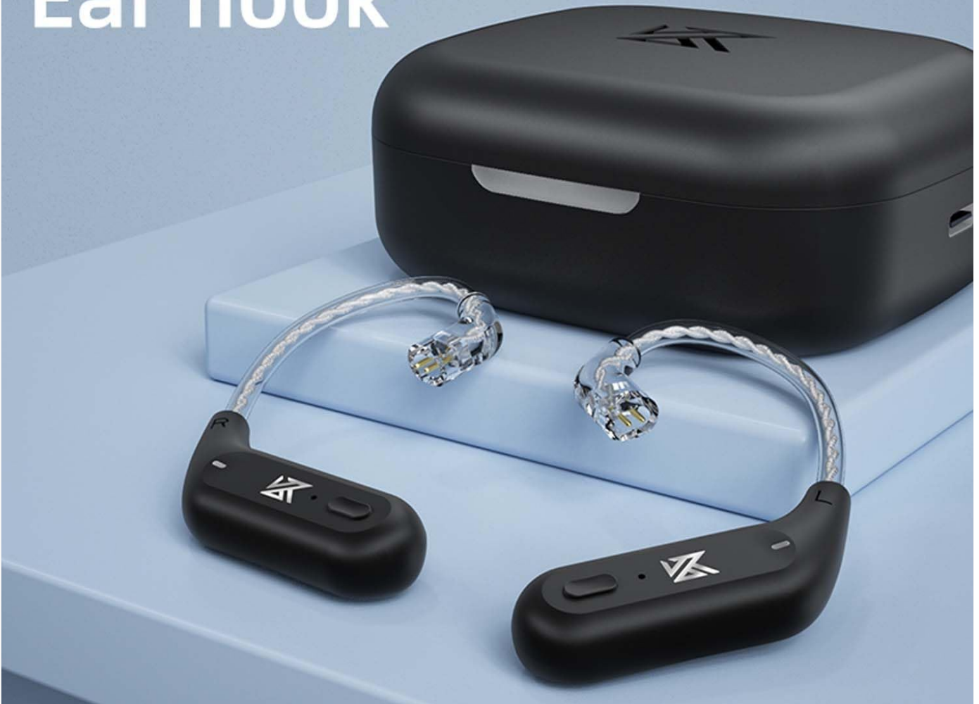
Image: The KZ AZ09 Wireless IEM Bluetooth Adapter earhooks and charging case.