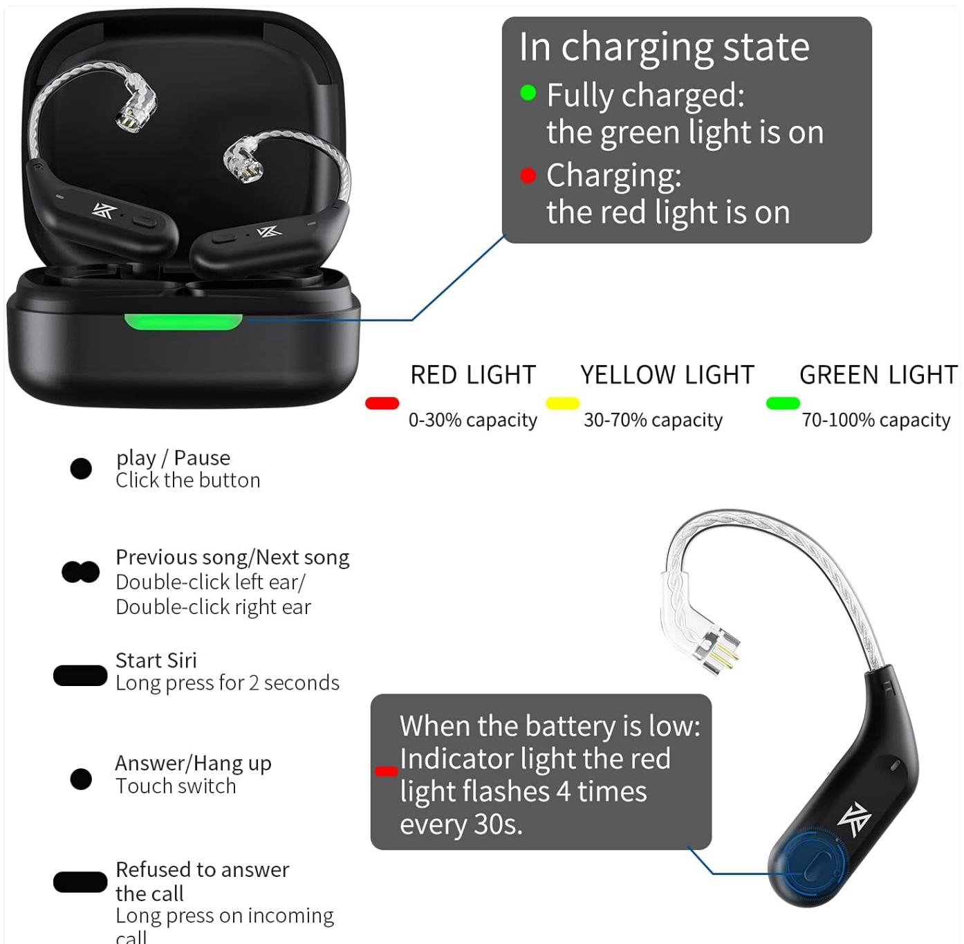
Image: Visual guide to the multi-functional button controls on the earhooks.