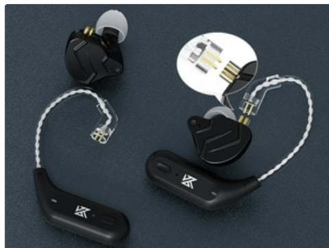
Image: The KZ AZ09 earhooks shown connected to compatible In-Ear Monitors.

Note: This specific model is for C-pin IEMs. Ensure your IEMs are compatible with the C-pin 0.75MM connector. Compatible models include KZ ZSN PRO, ZSN PRO-X, ZS10 PRO, ZS10 PRO X, ZS12 PRO X, ZS10 PRO 2, EDX PRO, CASTOR, ZAR, PR2, ZAX, AS24, AS24 PRO, ZAS, ZS-X, CCA CRA, and C12.