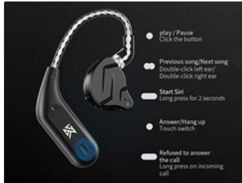
Image: Visual representation of AAC Advanced Audio Coding Transmission Technology.