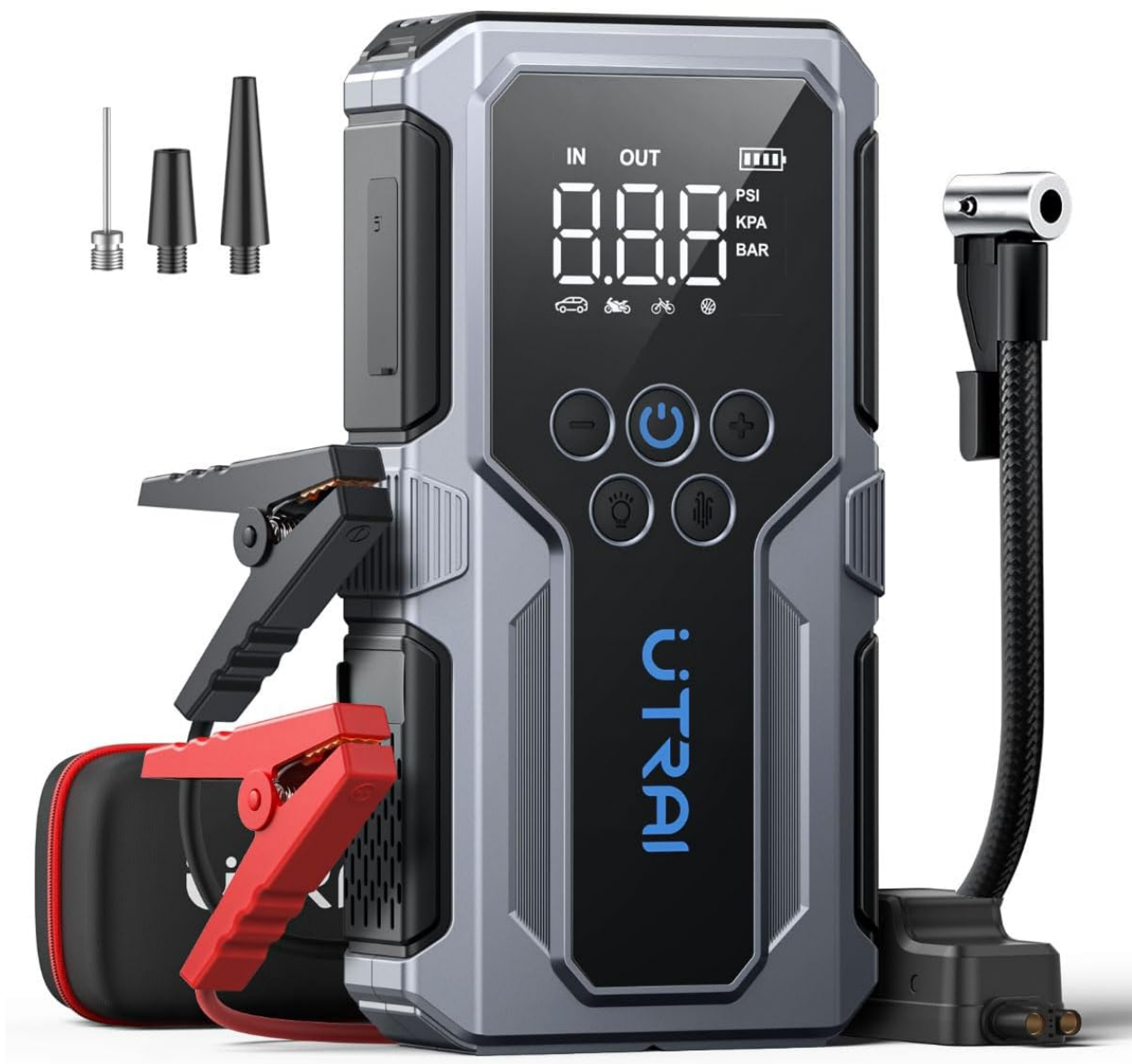
Image: UTRA I JS-9 Car Jump Starter with Air Compressor.