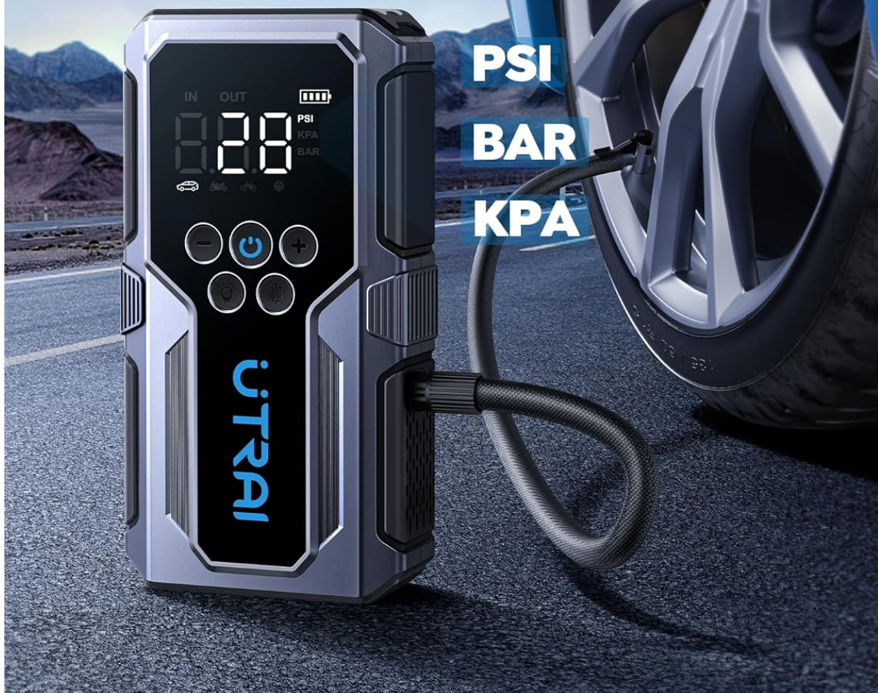
Image: The UTRAI JS-9 features a 150 PSI ultra-high-speed air compressor with tire pressure detection, supporting PSI, BAR, and KPA units.