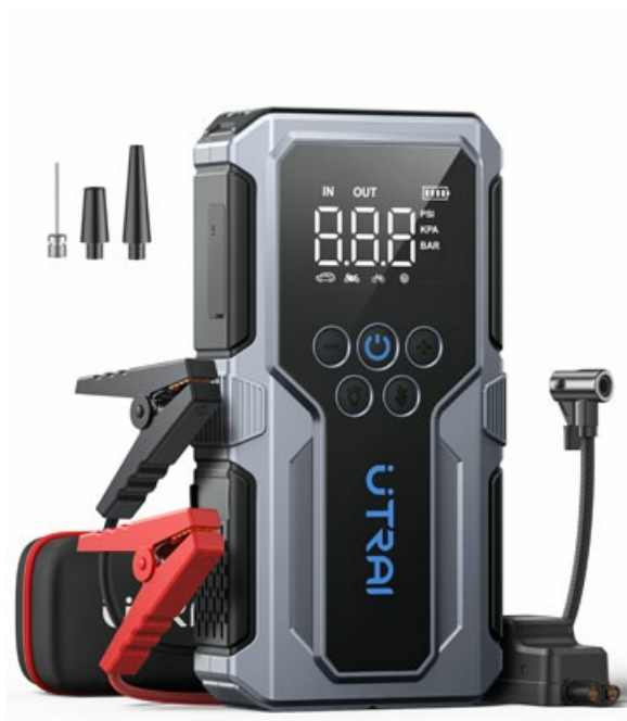
Image: UTRAI offers a 24-month hassle-free warranty and a 30-day unconditional return and refund policy.

UTRAI offers a 2-YEAR FREE Warranty, Lifetime Technical Support, and 7/24 Customer Service. For any inquiries or support, please refer to the contact information provided in your product packaging or visit the official UTRAI website.