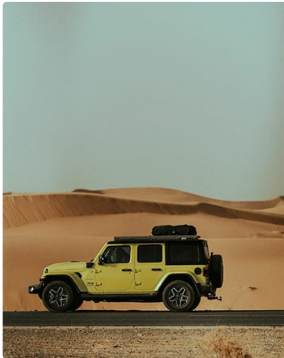
Image: UTRAI provides 7/24 customer support and lifetime technical assistance.

Image: UTRAI offers a 24-month hassle-free warranty and a 30-day unconditional return and refund policy.