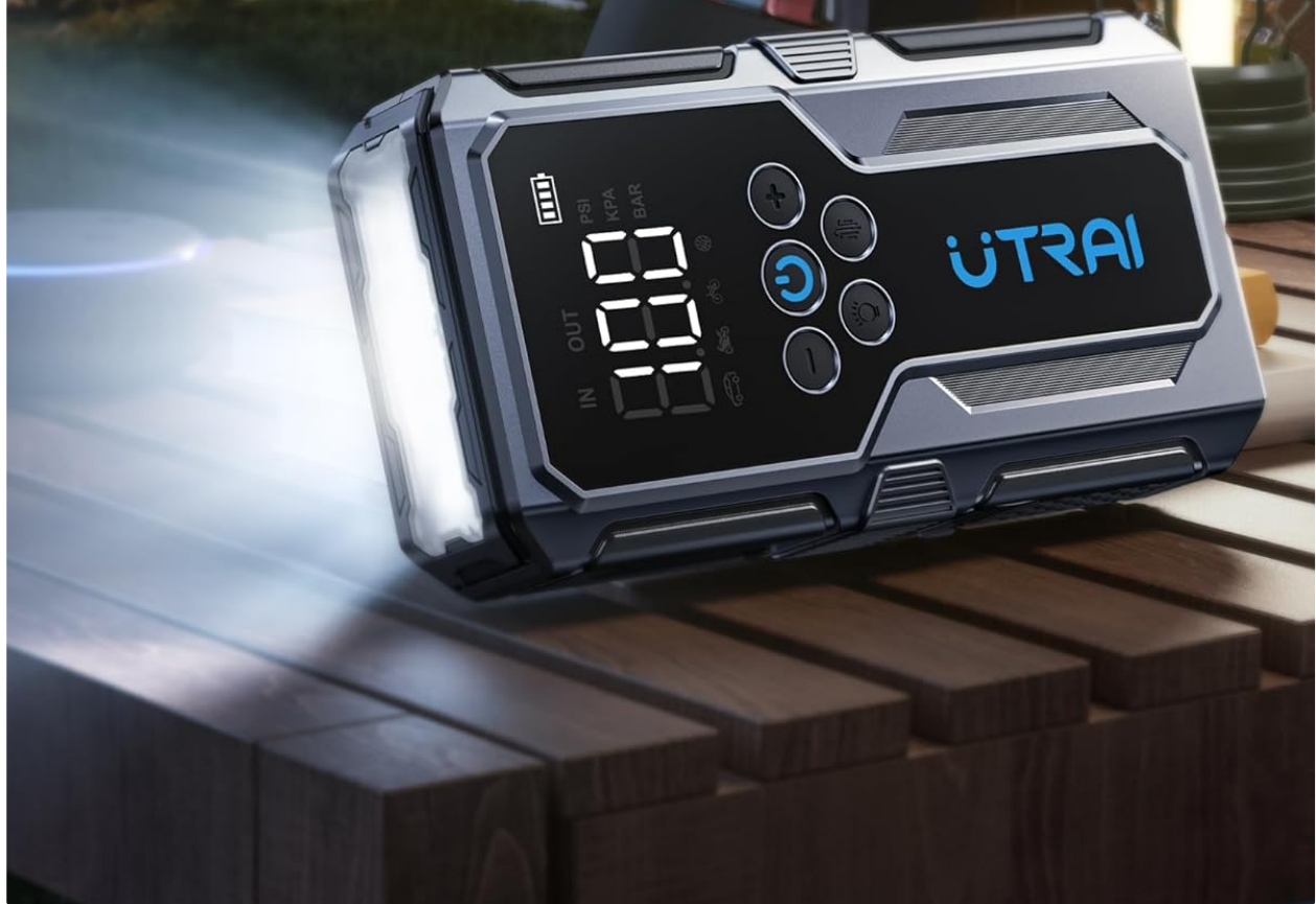
Image: The UTRAI JS-9 includes a multi-function LED light with illumination, strobe, and SOS modes for camping and emergencies.