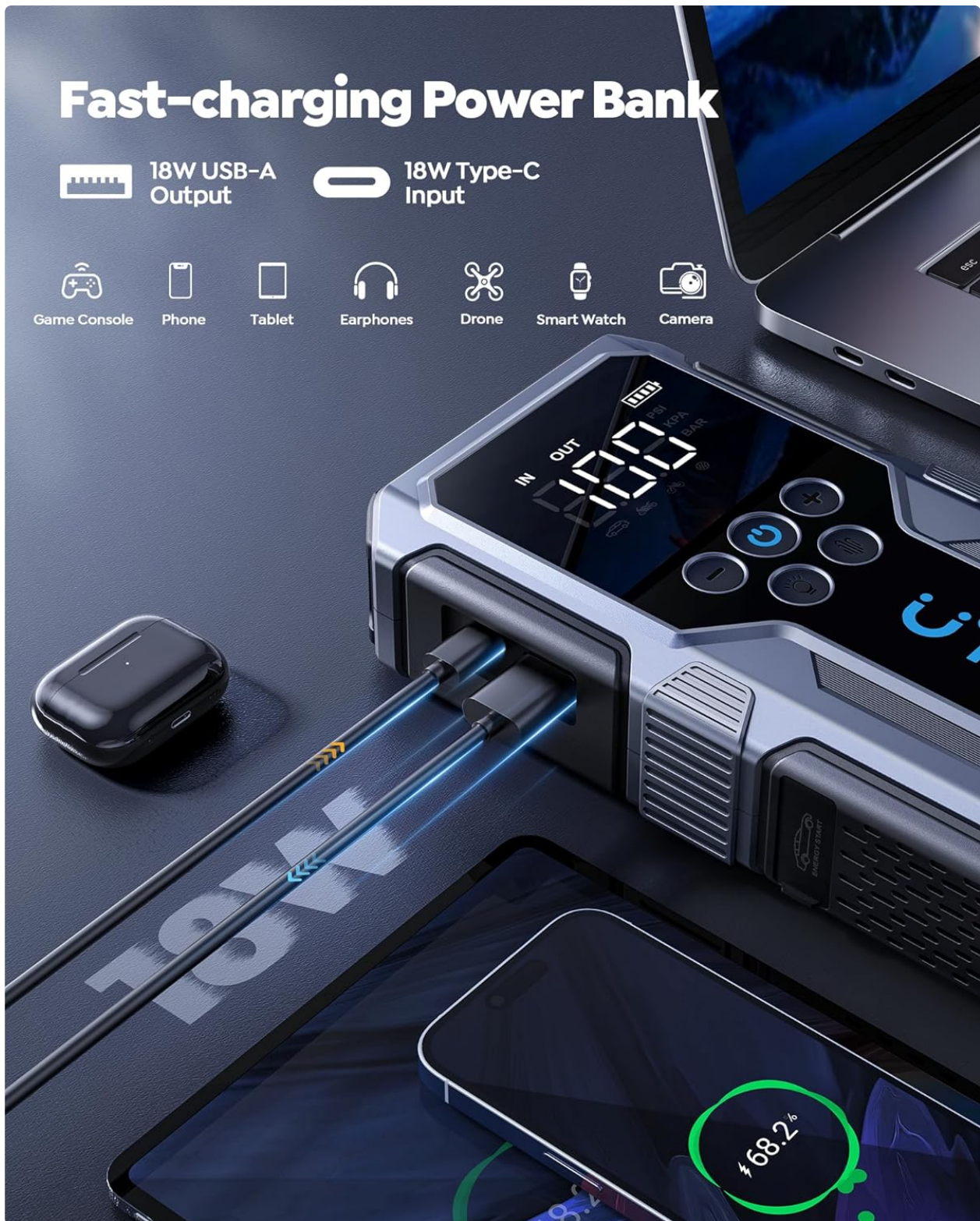
Image: The UTRAI JS-9 functions as a fast-charging power bank with 18W USB-A output and 18W Type-C input, capable of charging various devices like game consoles, phones, tablets, earphones, drones, smart watches, and cameras.