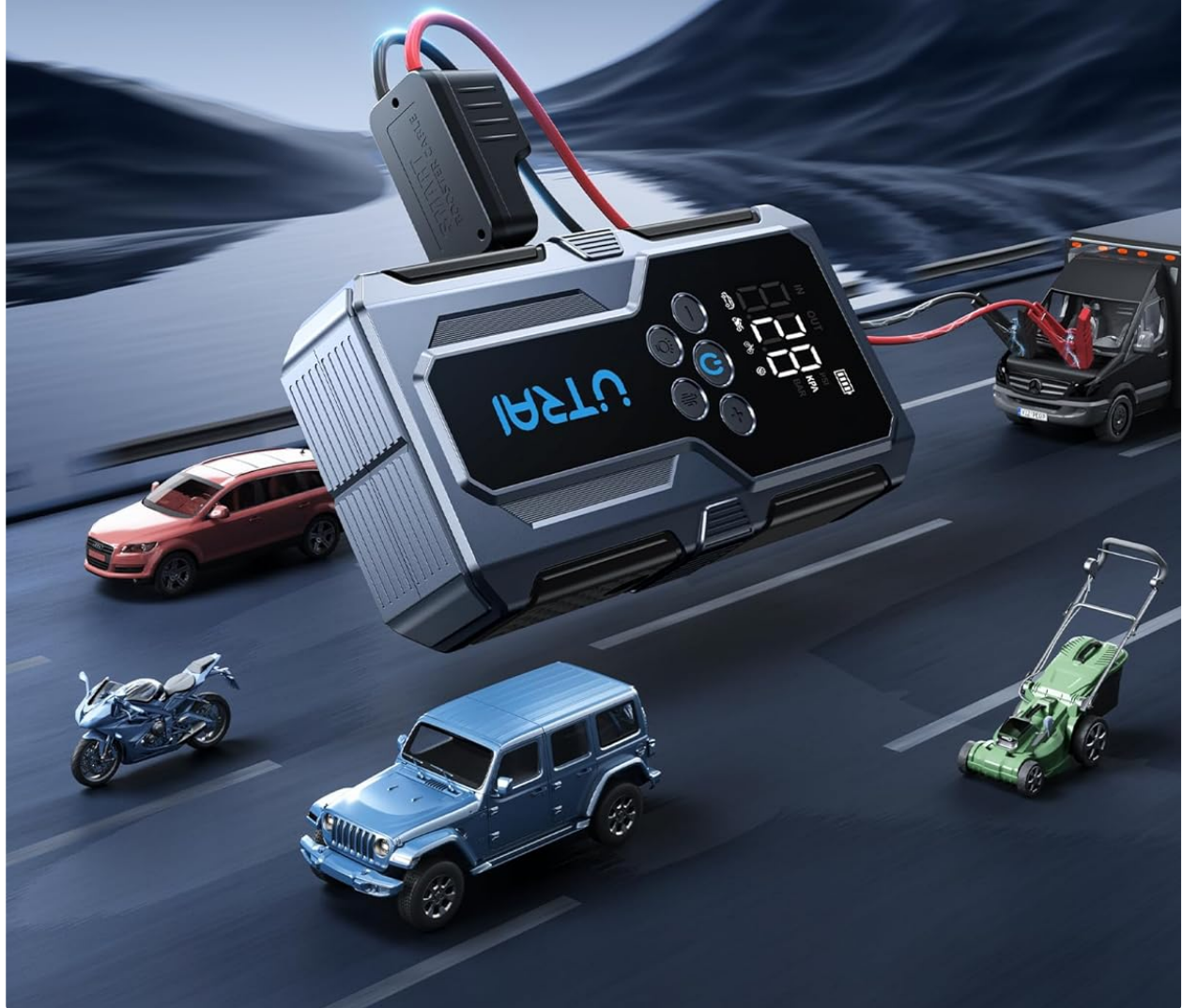
Image: The UTRAI JS-9 is an essential tool for road survival, suitable for 12V motor vehicles including lawnmowers, motorbikes, off-road vehicles, and cars with up to 8.5L gas or 6.5L diesel engines.