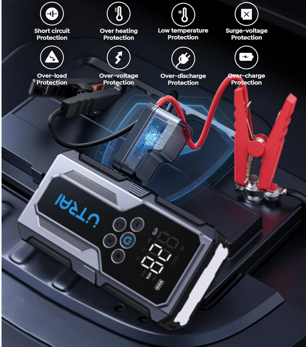
Image: The UTRA I JS-9 features a robust safety protection design, including short circuit, overheating, low temperature, surge-voltage, overload, over-voltage, over-discharge, and over-charge protections.