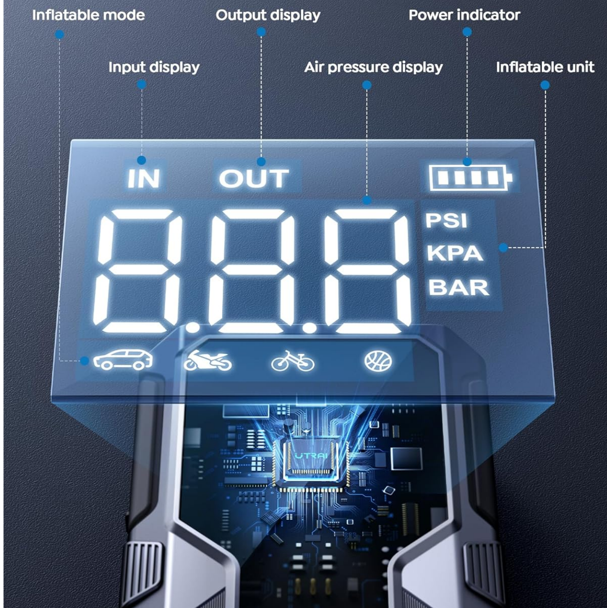
Image: UTRAI JS-9 Jump Starter and its accessories.