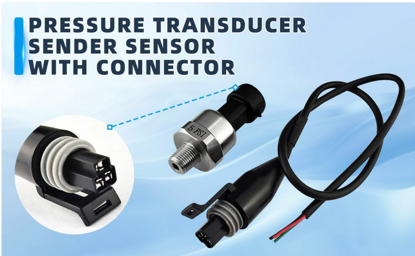
Figure 8.1: Diverse Applications of the Pressure Transducer.