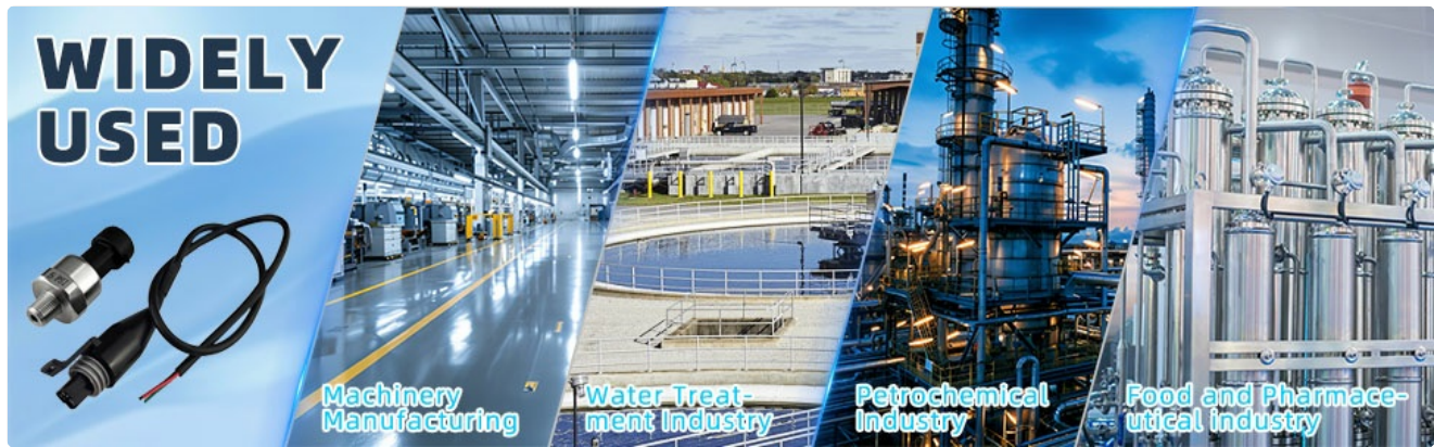
Figure 2.1: Key Features of the Pressure Transducer.