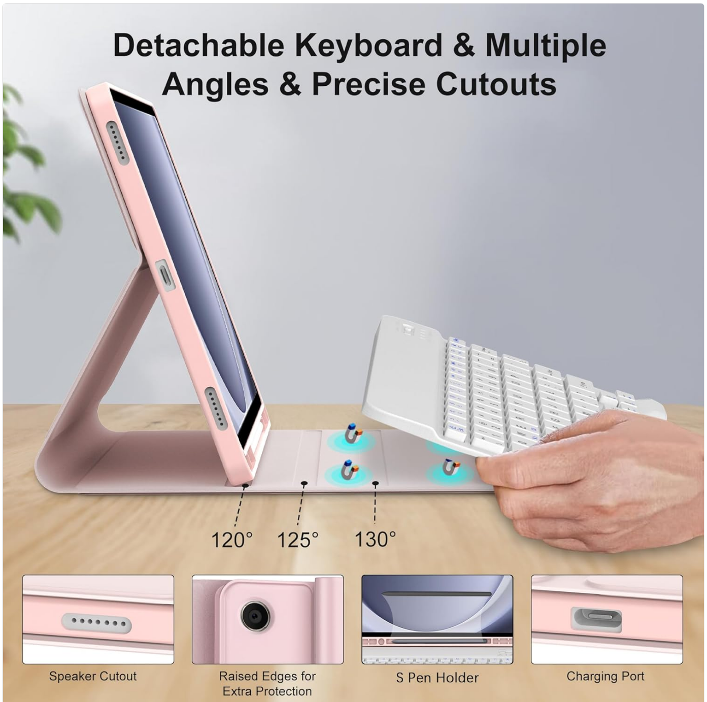
Image illustrating the keyboard case with the tablet propped up at three adjustable viewing angles (120°, 125°, 130°). Details show a speaker cutout, raised edges for protection, an S Pen holder, and a charging port.