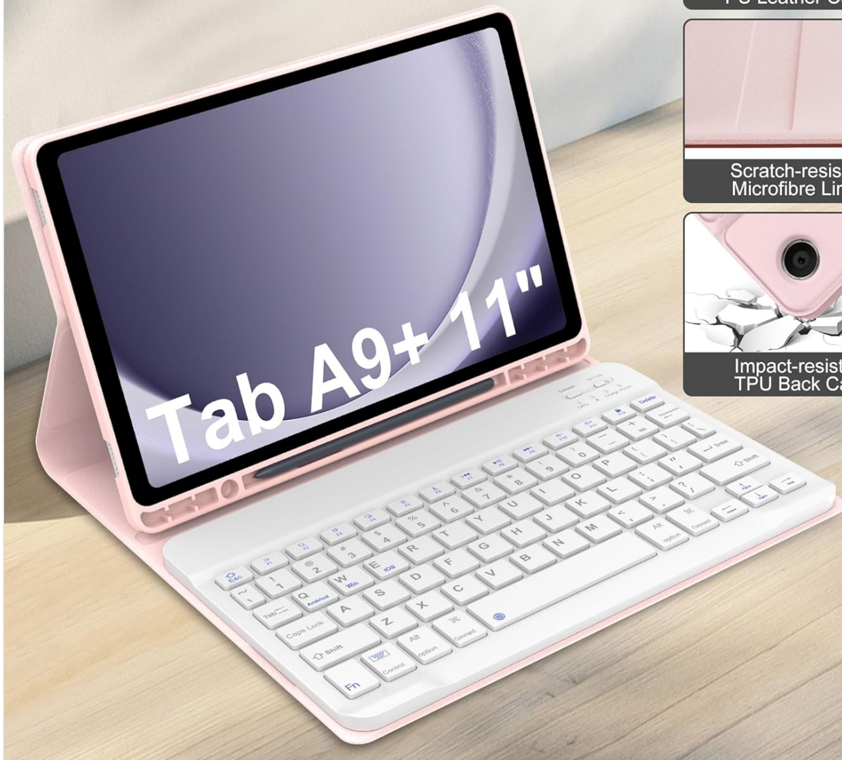
Image demonstrating the 360° protection offered by the case, highlighting the wear-resistant PU leather cover, scratch-resistant microfiber lining, and impact-resistant TPU back case. The tablet is shown in the case with the keyboard.