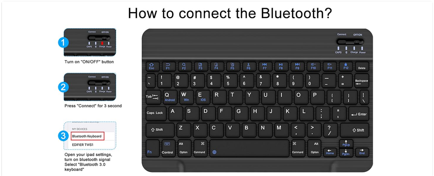
Diagram illustrating the three steps to connect the Bluetooth keyboard: 1. Turn on the ON/OFF button. 2. Press 'Connect' for 3 seconds. 3. Select 'Bluetooth keyboard' in tablet settings.