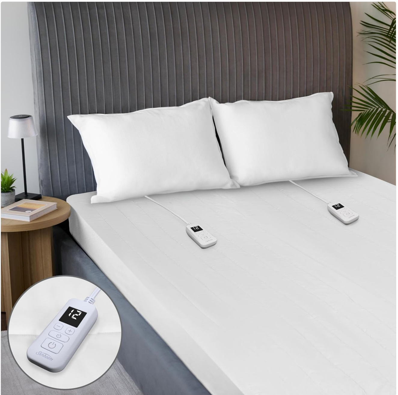
Figure 1.1: The Sunbeam Electric Restful Quilted Heated Mattress Pad installed on a King-sized bed, showing the two digital controllers.