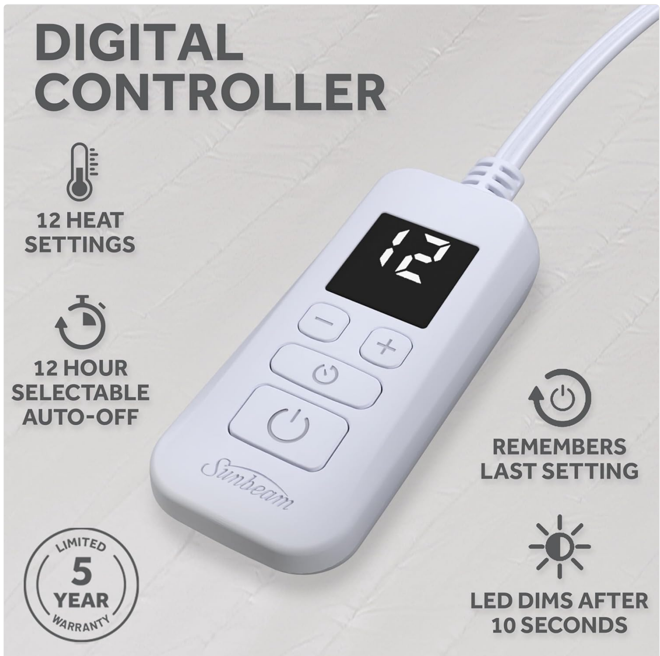
Figure 4.1: The easy-to-use digital controller with 12 heat settings and 12-hour auto-off feature.

6. Power Off: Press the Power button ( ) again to turn off the mattress pad.