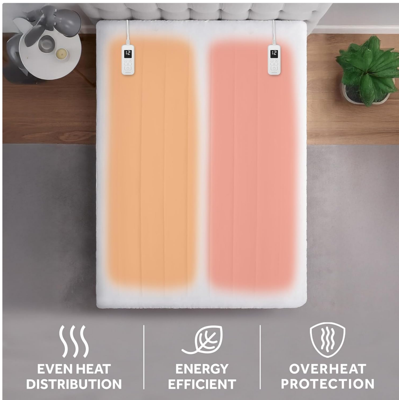
Figure 4.2: Illustration of even heat distribution and dual zone heating for personalized comfort.