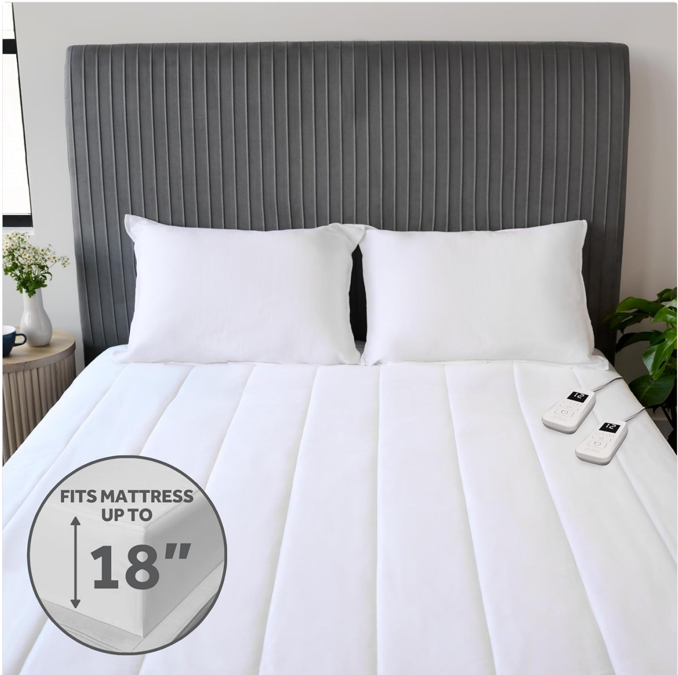
Figure 3.1: The mattress pad features a deep pocket design to securely fit mattresses up to 18 inches in depth.

6. Layer Bedding: Place your fitted sheet and other bedding over the heated mattress pad.