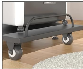
Rack with Slide Rail