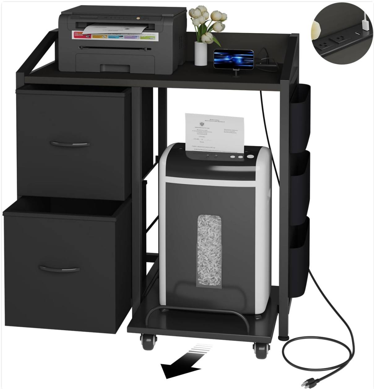
Figure 1.1: Overview of the WODRAWER Printer Stand, showcasing its storage, power outlets, and shredder compartment.