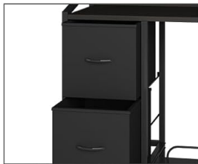
2 Large Capacity Drawers