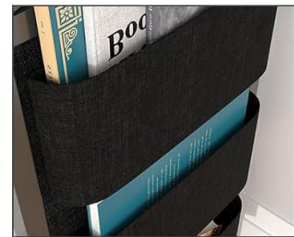
3 Large Capacity Side Bags