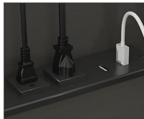
Built-in Power Outlet & USB