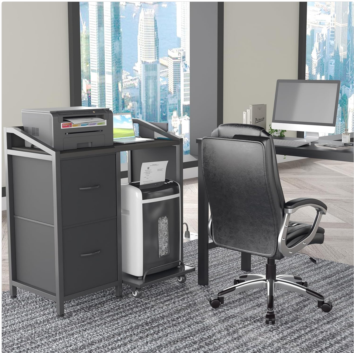
Figure 5.2: The printer stand in an office environment, demonstrating the convenient pull-out tray for a paper shredder.