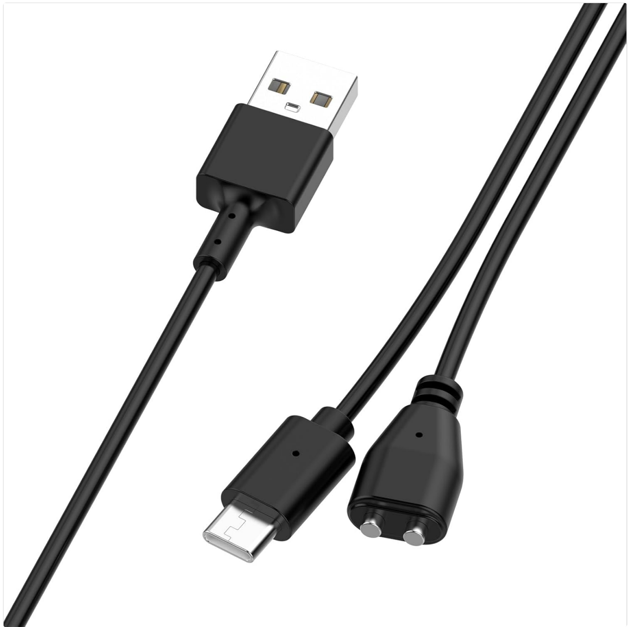
Image 3.1: Close-up view of the magnetic connector engaging with a device's charging port.