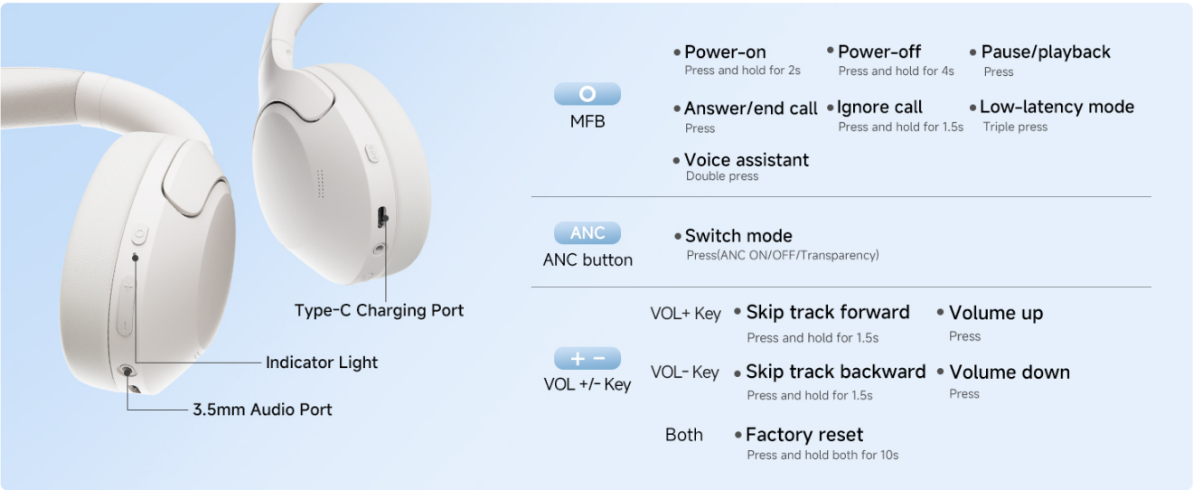
Image: Detailed diagram of headphone buttons and their corresponding functions.

The QCY H3 LITE headphones feature several buttons for easy control: