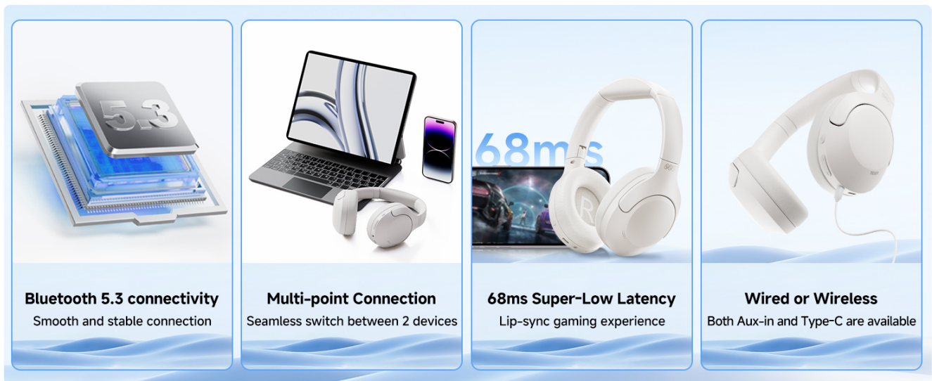
Image: Features including Bluetooth 5.3, Multi-point Connection, Low Latency, and Wired/Wireless modes.