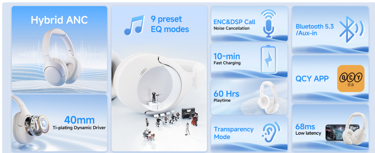
Image: Overview of QCY H3 LITE features including ANC, EQ modes, call quality, Bluetooth 5.3, fast charging, battery life, app support, transparency mode, low latency, and dynamic drivers.

The QCY H3 LITE are wireless over-ear headphones designed for an immersive audio experience with Active Noise Cancellation (ANC) and Transparency Mode. They feature Bluetooth 5.3 for stable connectivity, up to 60 hours of playtime, and multi-point connection capabilities. This manual provides detailed instructions for setup, operation, and maintenance.