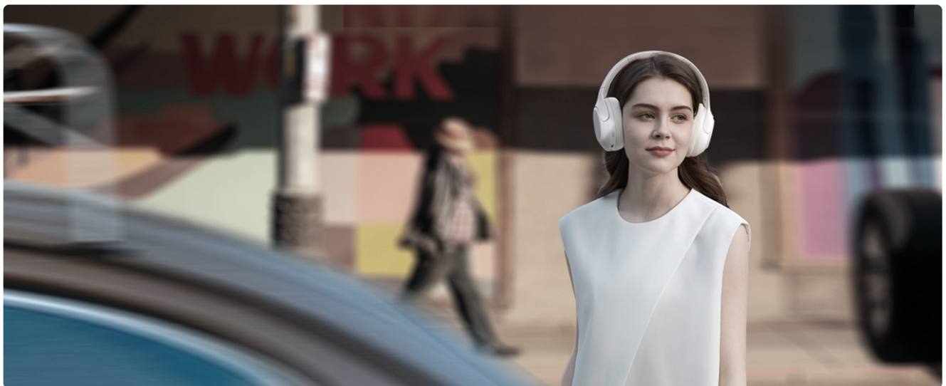
Image: Transparency Mode in use, allowing the user to hear their surroundings.

Image: Illustration of how Active Noise Cancellation reduces ambient sound.