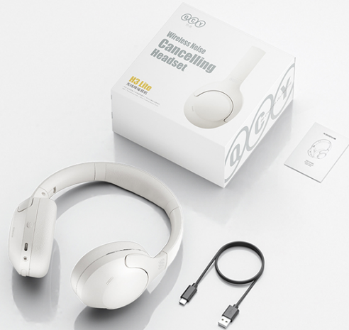
Image: The QCY H3 LITE headphones, USB-C charging cable, and user manual as packaged.