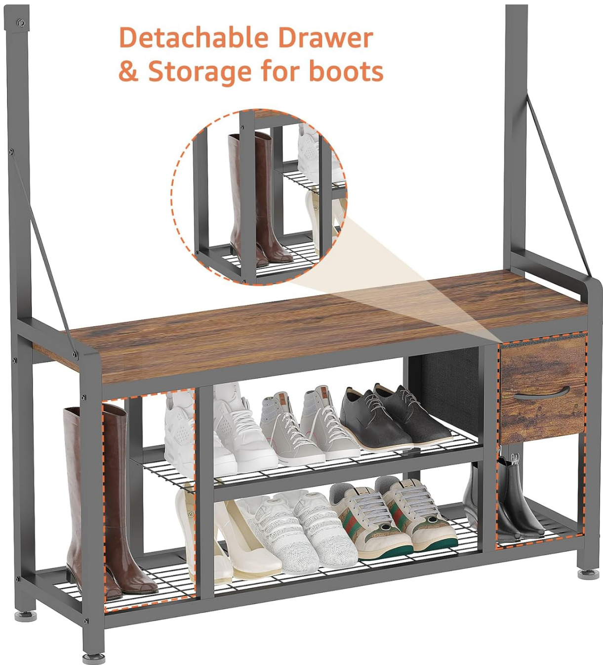
Image: Illustrates the detachable drawers and dedicated space for storing taller items like boots on the lower shelves.