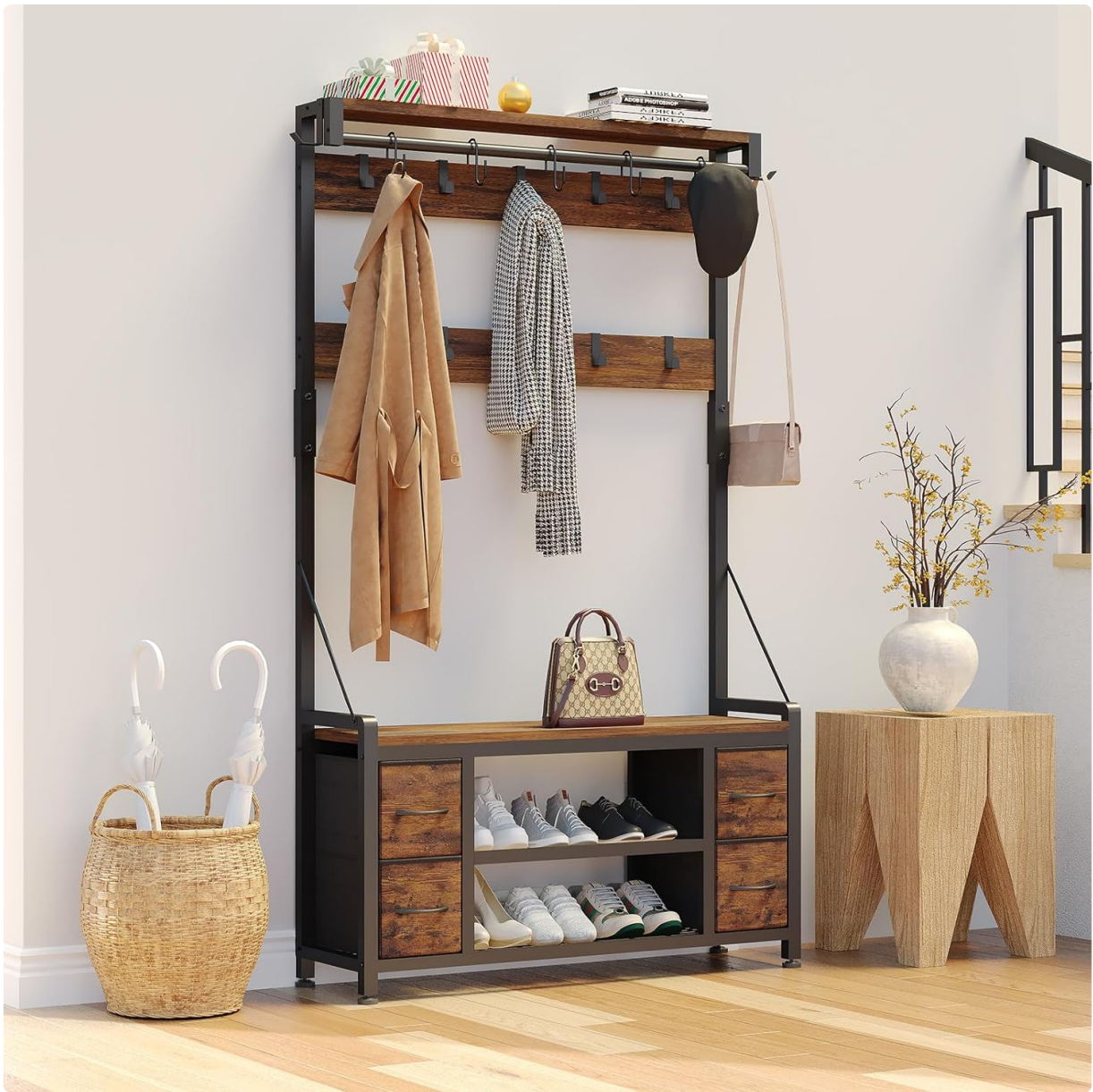
Image: The WODRAWER 39-inch Hall Tree, fully assembled, showcasing its coat rack, bench, shoe storage, and drawers in a rustic brown finish.