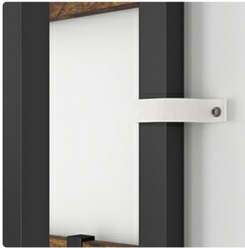
Image: A safety belt attached to the hall tree frame, designed for securing the unit to a wall to prevent tipping.