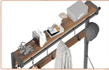
Top shelf for extra storage ✓