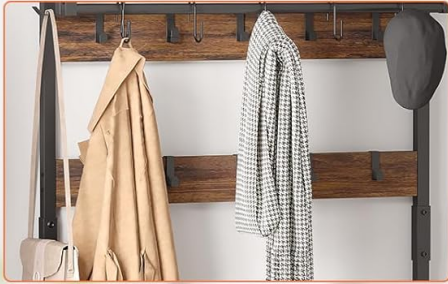
Double-layer hook storage ✓