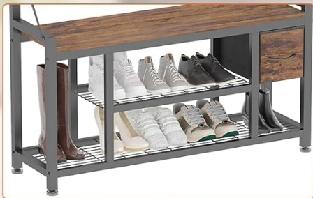
Organizer of large space ✓