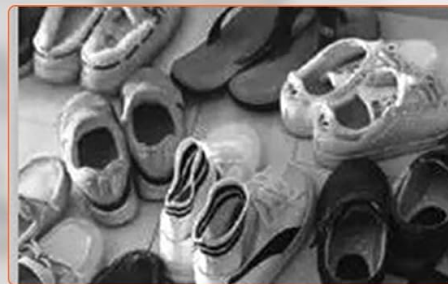
Shoe are placed disorderly ✗

Image: A visual representation of the hall tree's integrated storage, highlighting the top shelf, double-layer hooks, and organized shoe storage.