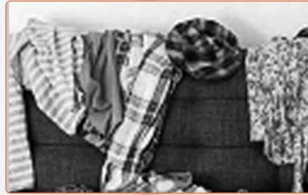
Messy bags and clothes ✗