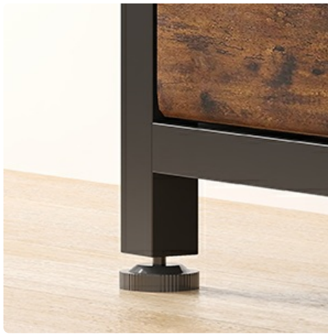
Image: Detail of the adjustable foot pads, which can be rotated to stabilize the unit on uneven floors.