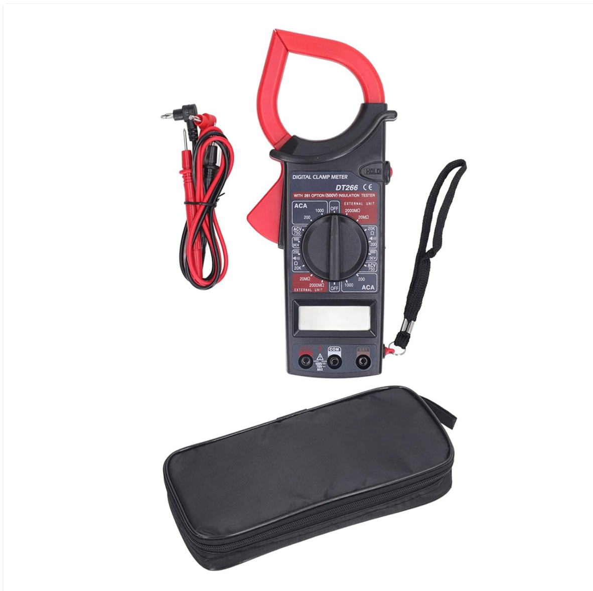
Image 3.1: Contents of the Yuecoom DT266 Digital Clamp Meter package, including the meter, test probes, and a black storage bag.