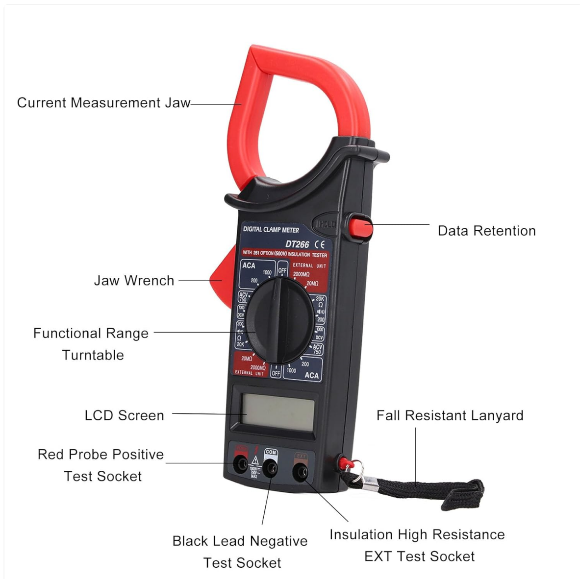
Image 4.1: A detailed diagram illustrating the key components of the DT266 Digital Clamp Meter, including the Current Measurement Jaw, Jaw Wrench, Functional Range Turntable, LCD Screen, Data Retention button, Red Probe Positive Test Socket, Black Lead Negative Test Socket, Insulation High Resistance EXT Test Socket, and Fall Resistant Lanyard.