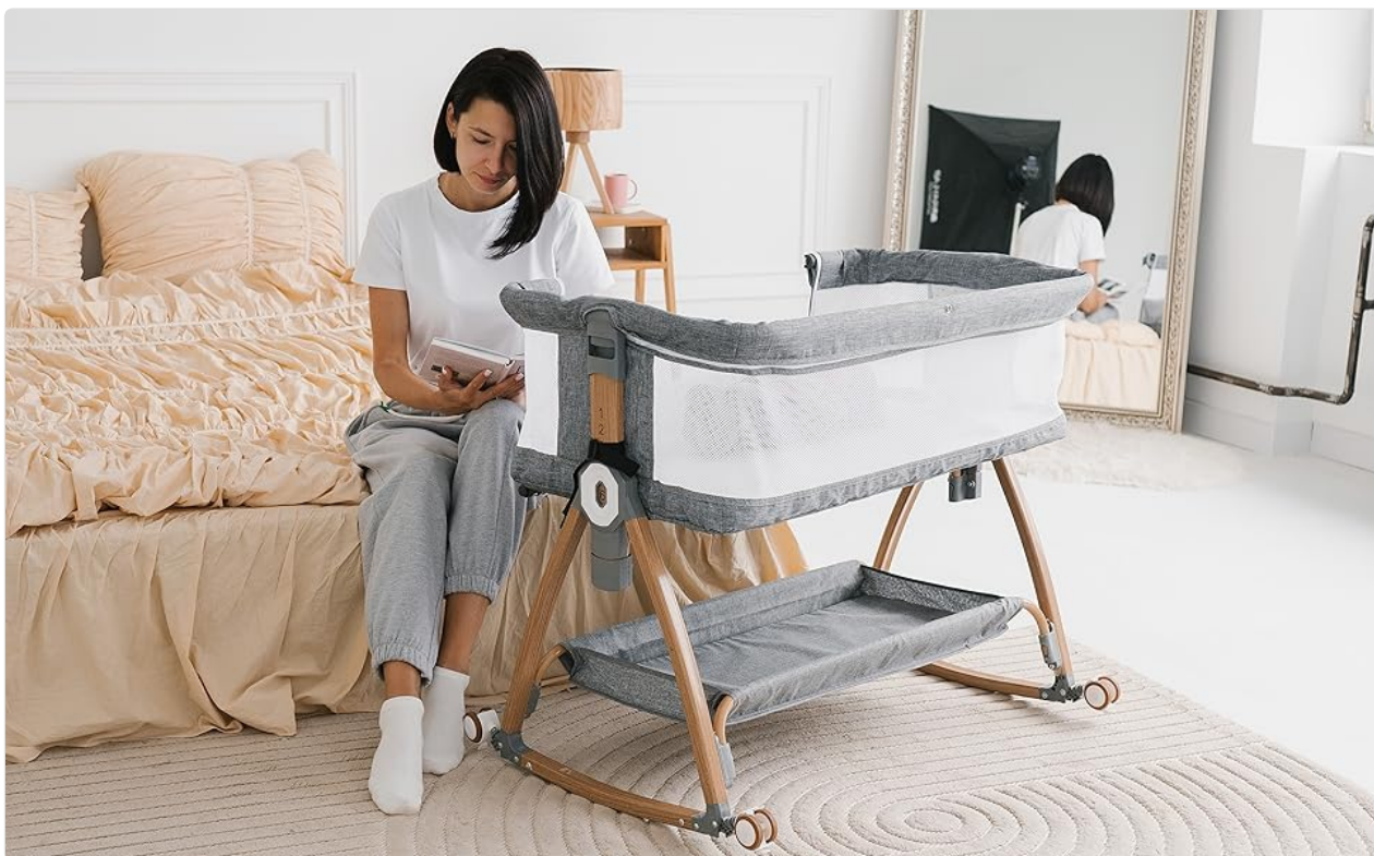
The bassinet folds compactly and fits into a travel bag for easy transport and storage.

When not in use, the bassinet can be folded for compact storage. Refer to the assembly instructions for folding steps. Store the bassinet in its travel bag in a clean, dry place away from direct sunlight and extreme temperatures.