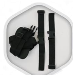
3 straps for attaching to the crib