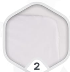
2 Comfortable mattress