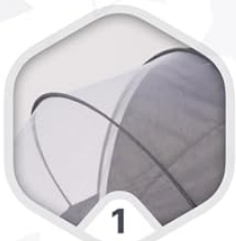
1 Mosquito net /Sunshade