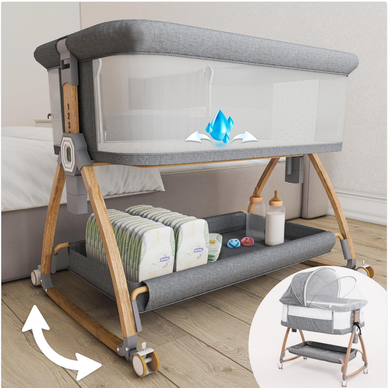
The Earth&ME Bedside Bassinet, featuring its adjustable height and convenient storage basket.