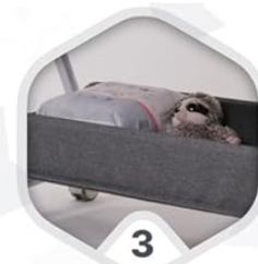
3 Storage basket