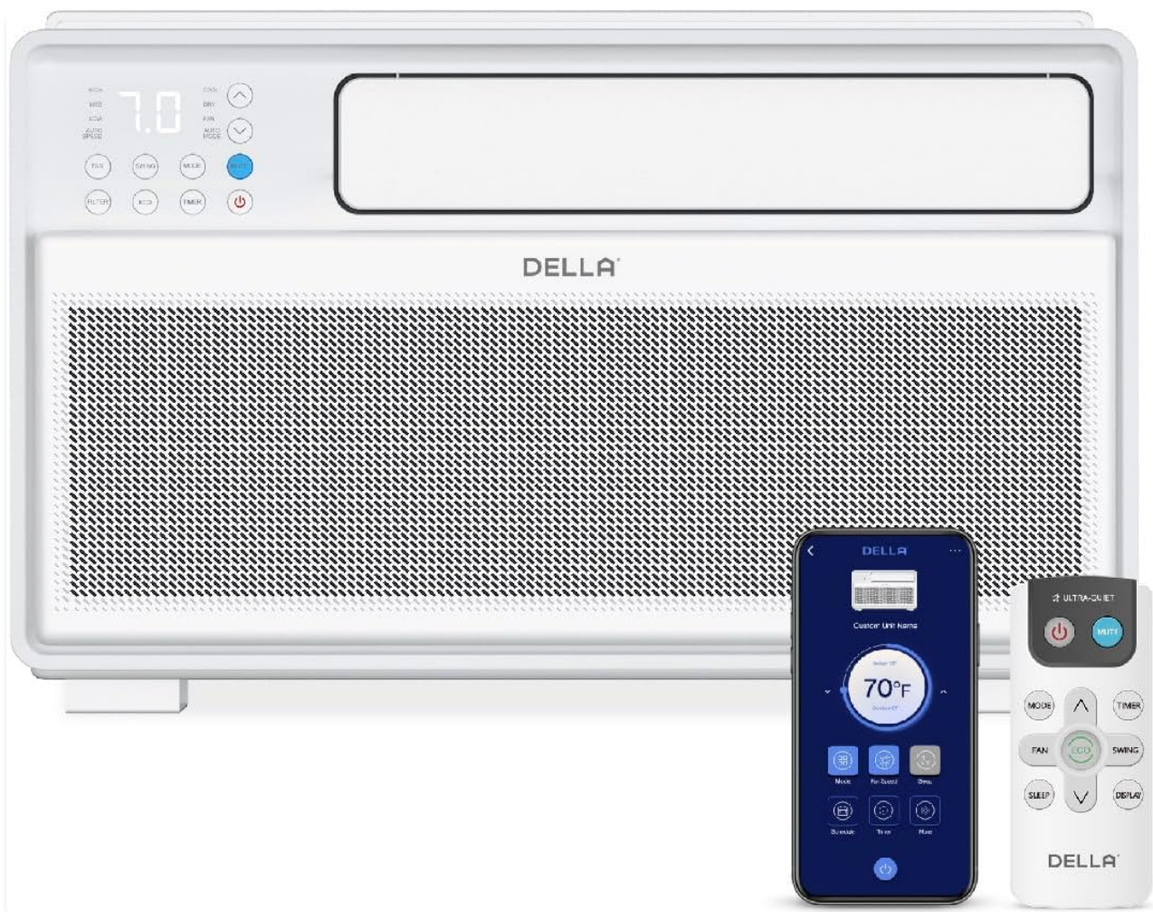
The DELLA 12000 BTU Smart Inverter Window Air Conditioner, shown with its remote control and the DELLA+ smartphone application interface.