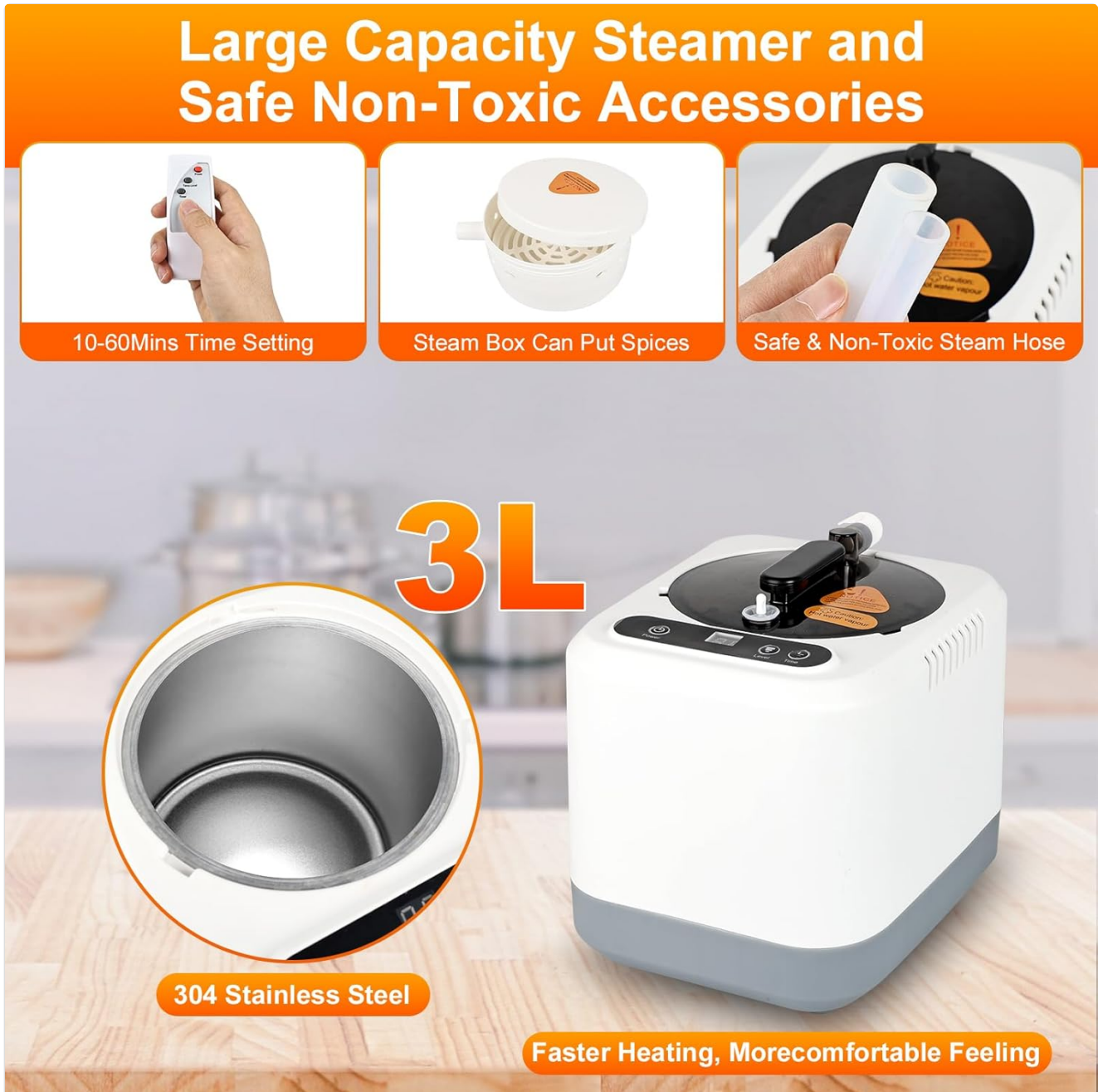
Figure 4: Steamer unit and remote control for operation.