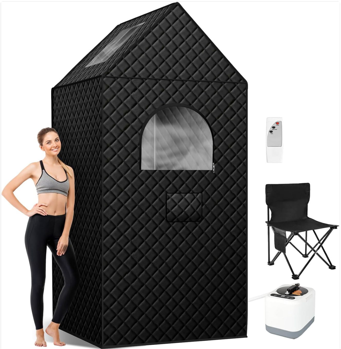
Figure 1: Assembled I-THERA-U Portable Sauna Box.