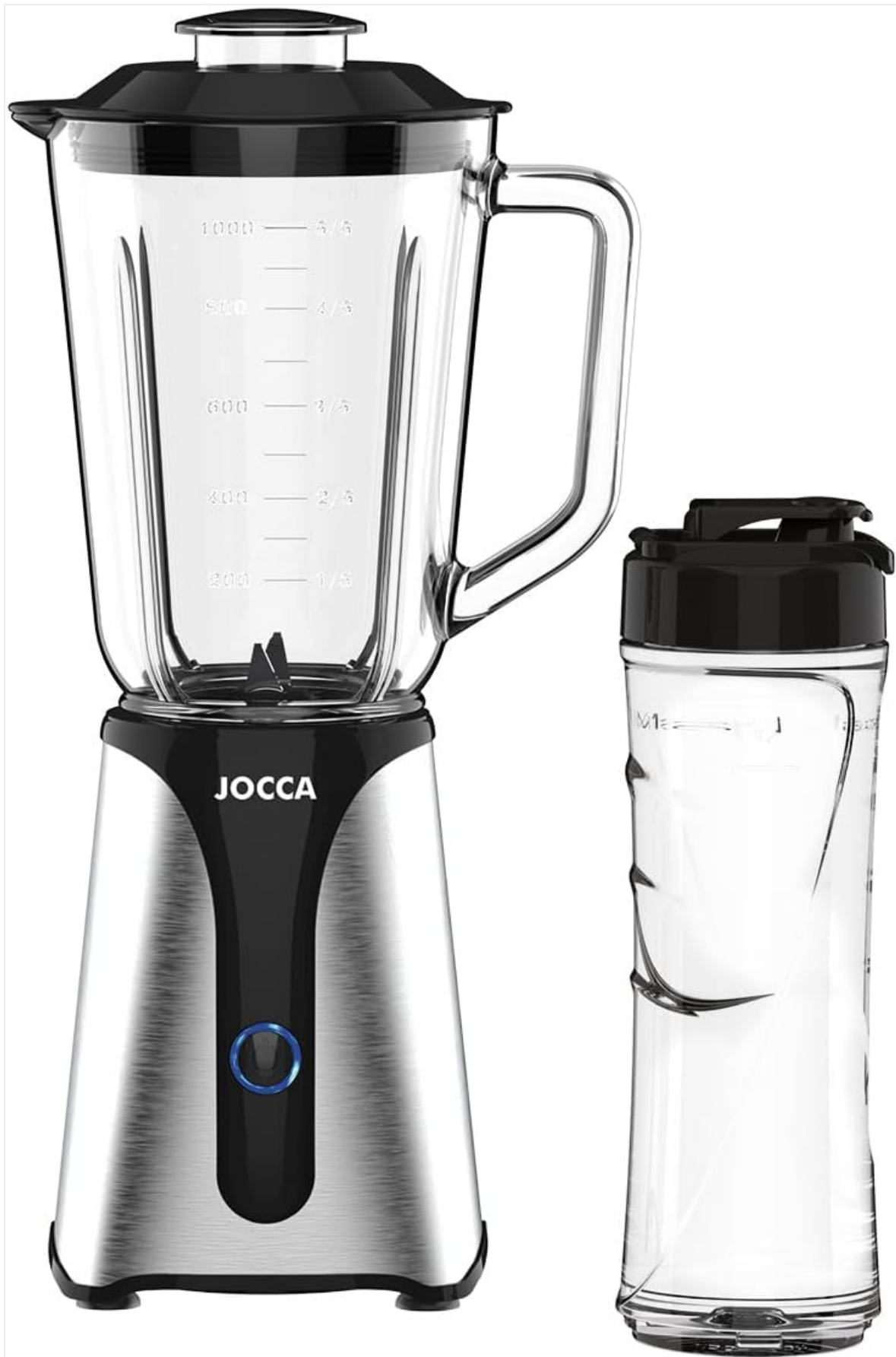
Image: The JOCCA Glass Blender with indicated dimensions of approximately 34 cm in height and 21 cm in width at the base.

Yes (Carafe, Travel Bottle, Blade Assembly)