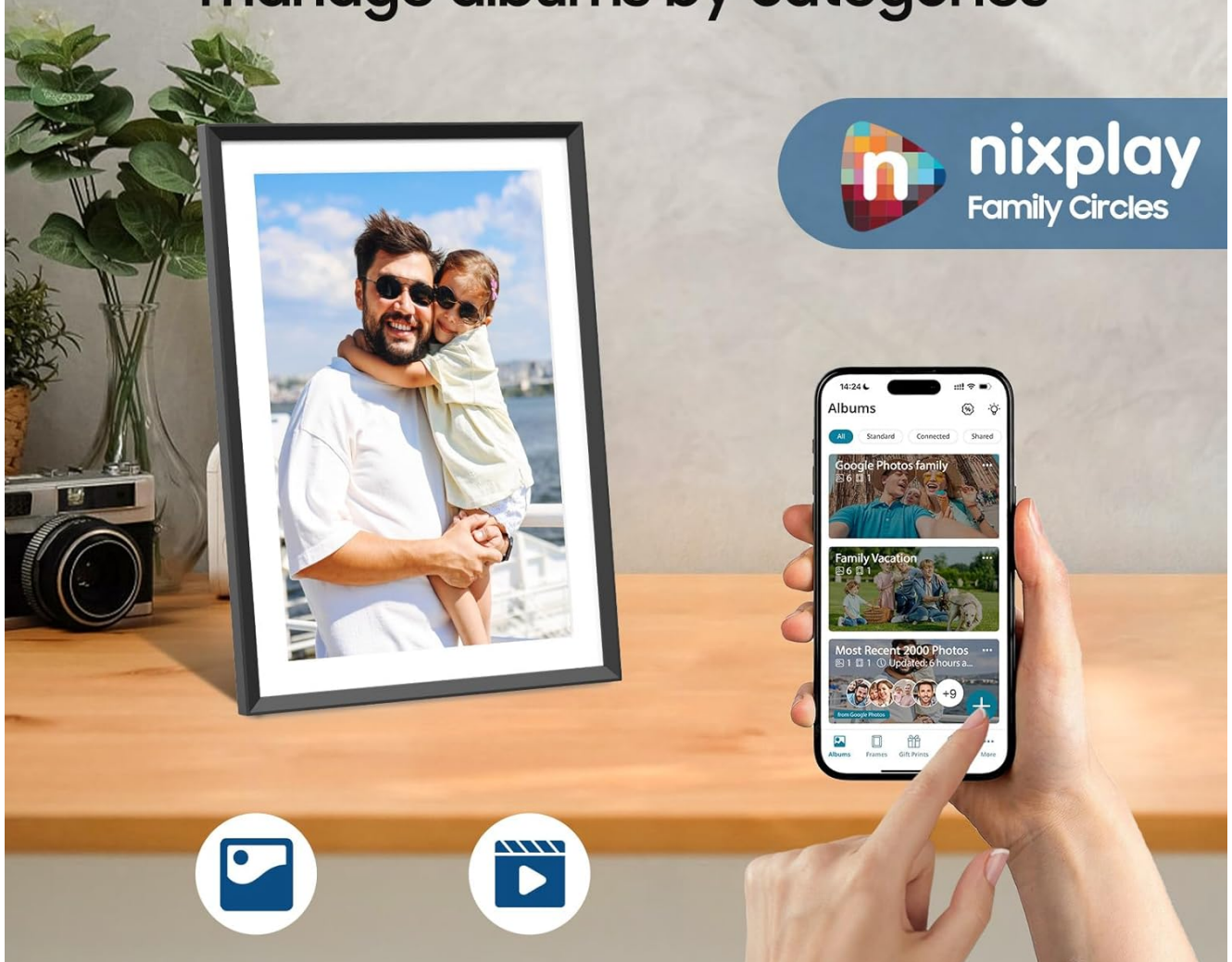
Image depicting multiple user profiles around a digital picture frame, symbolizing the Nixplay-FamilyCircles feature for shared photo and video contributions.

Allows you to invite family and friends to share their photos/videos and manage albums by categories