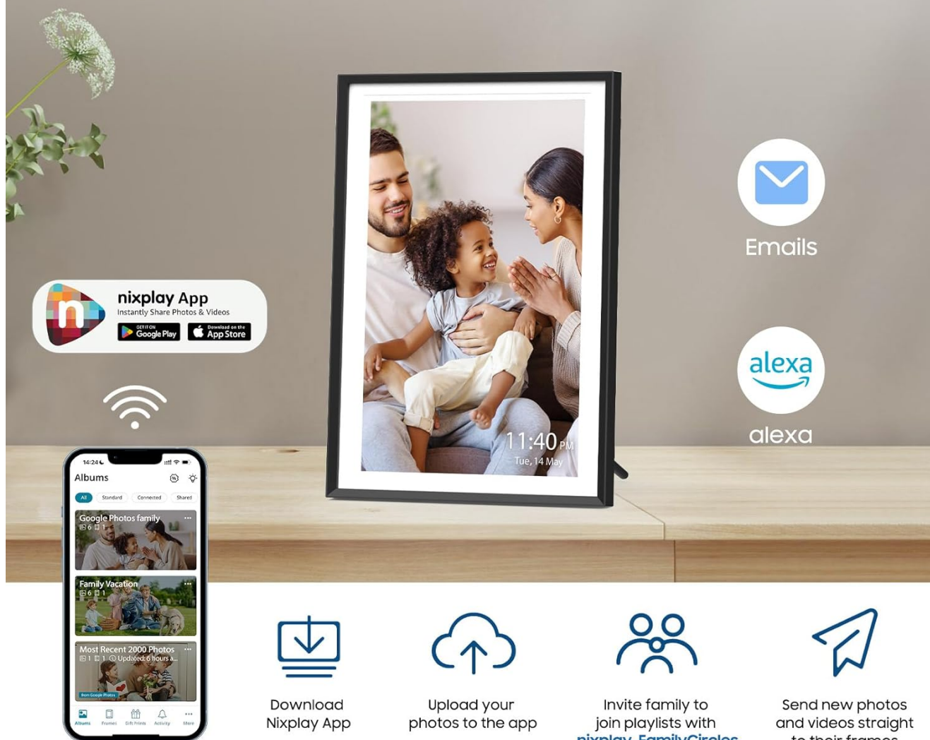
Image illustrating the Nixplay app on a smartphone, showing how photos can be sent wirelessly to the ApolloSign Digital Picture Frame.