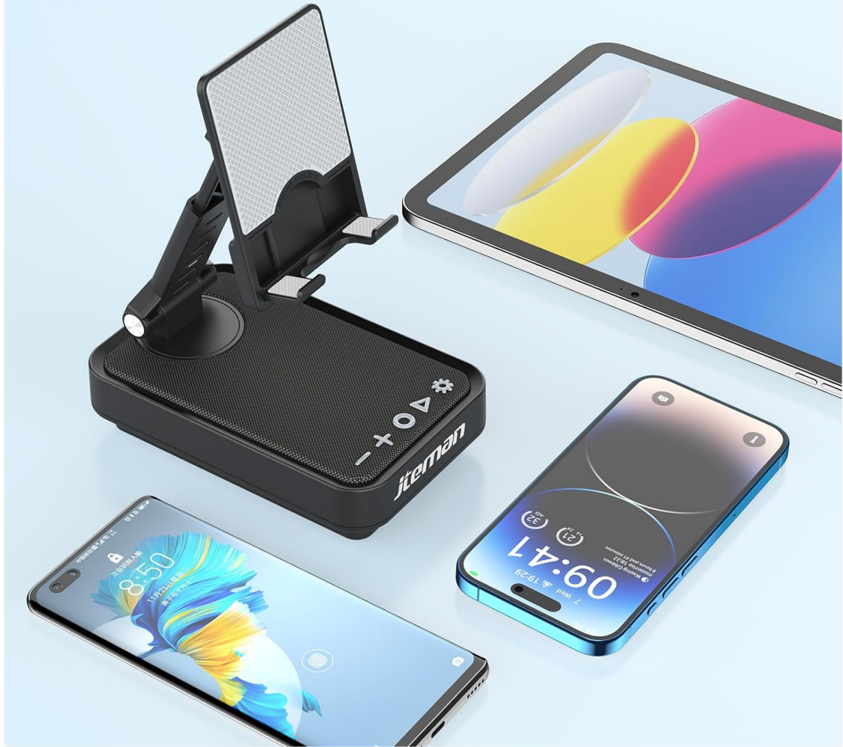
Figure 6: The phone stand supports a wide range of devices, including smartphones and tablets (4-13 inches).

Support for iPhone Android Samsung and most 4-13" devices