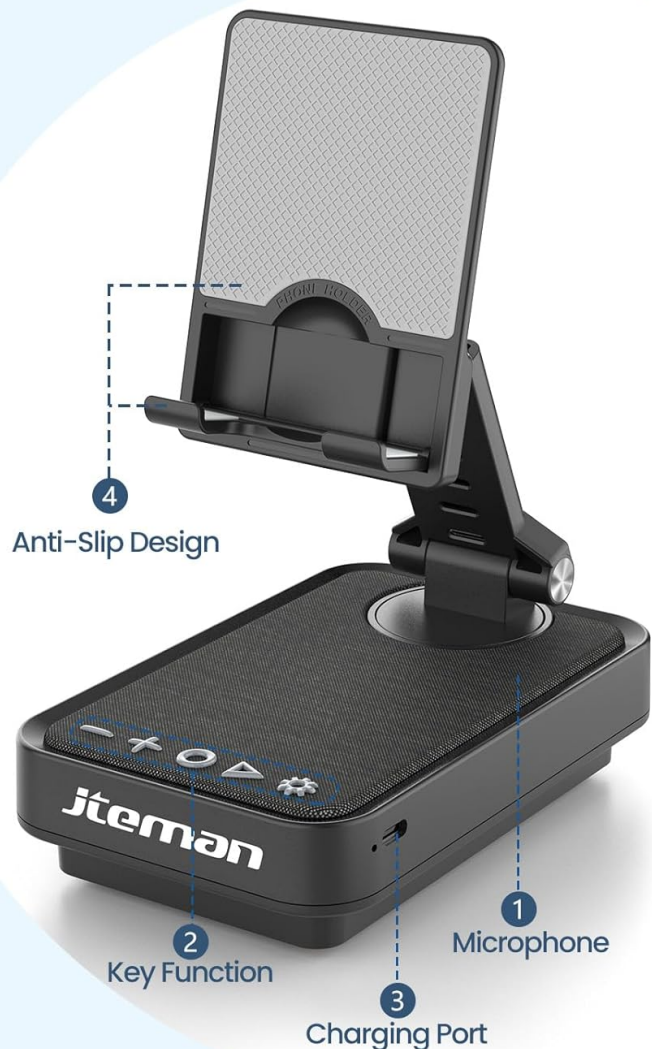
Figure 2: Product details and components. Note the anti-slip design and key functions.