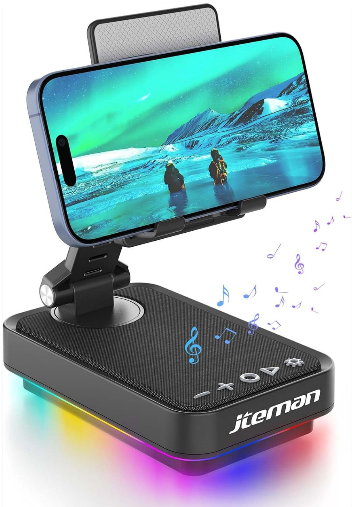
Figure 1: JTEMAN 360 Rotating Cell Phone Stand with Wireless Bluetooth Speaker with Light.