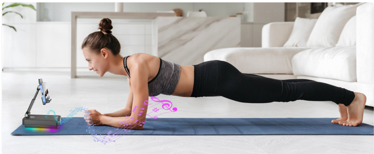
Figure 4: Bluetooth connection with a laptop, demonstrating wireless audio playback.