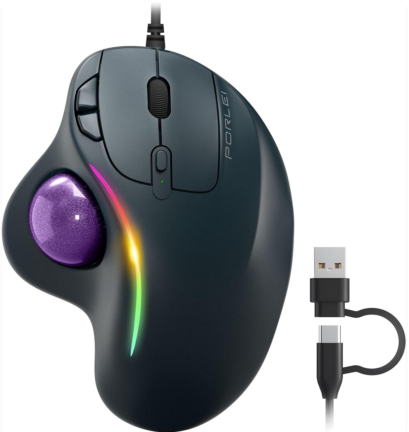
Image: The PORLEI TM551 Wired Trackball Mouse, showcasing its ergonomic design, RGB lighting, and dual USB-C and USB-A connectivity options.