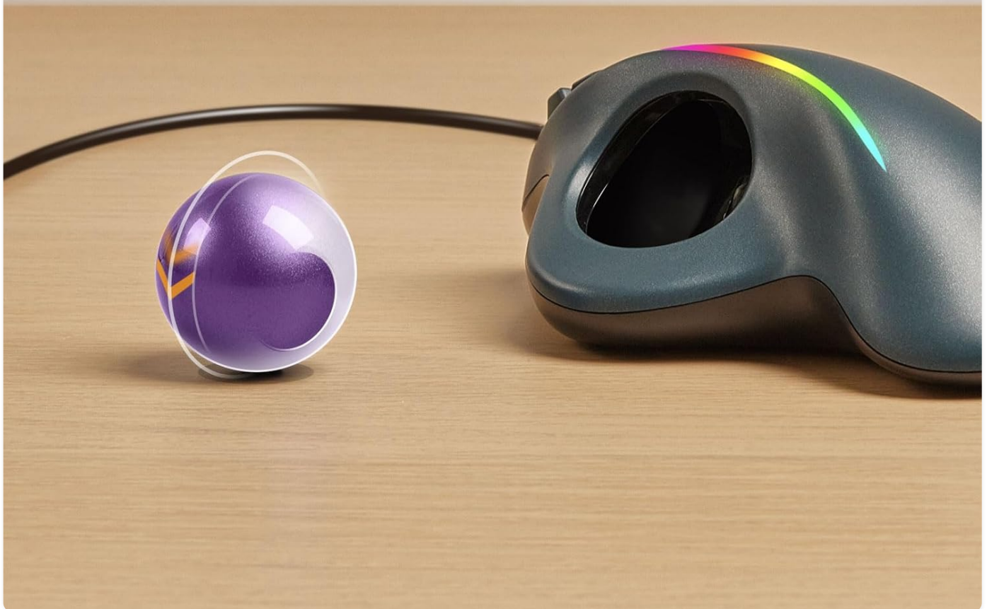
Image: The PORLEI TM551 trackball mouse with its purple trackball removed, demonstrating the ease of cleaning the ball and its housing to maintain smooth operation.

Effortlessly Remove Trackball for Cleaning