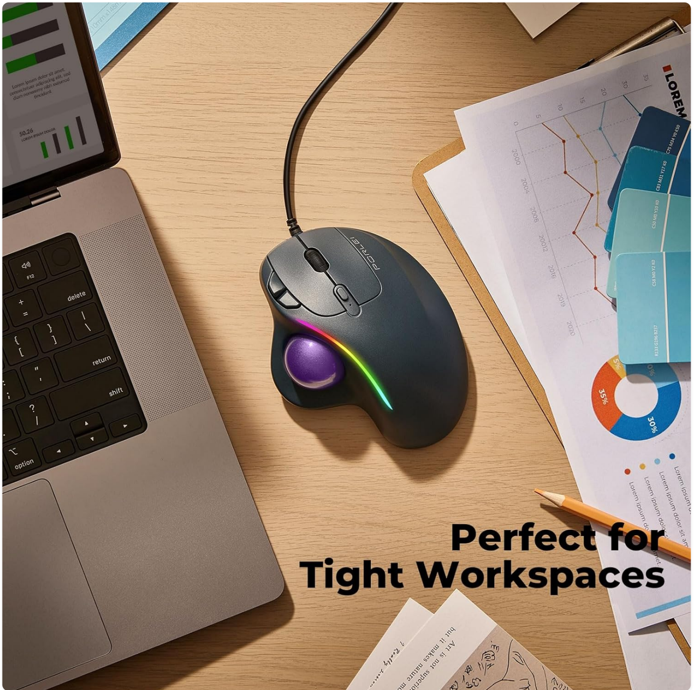
Image: The PORLEI TM551 trackball mouse positioned on a desk alongside a laptop and other items, illustrating how its stationary design makes it perfect for tight workspaces.