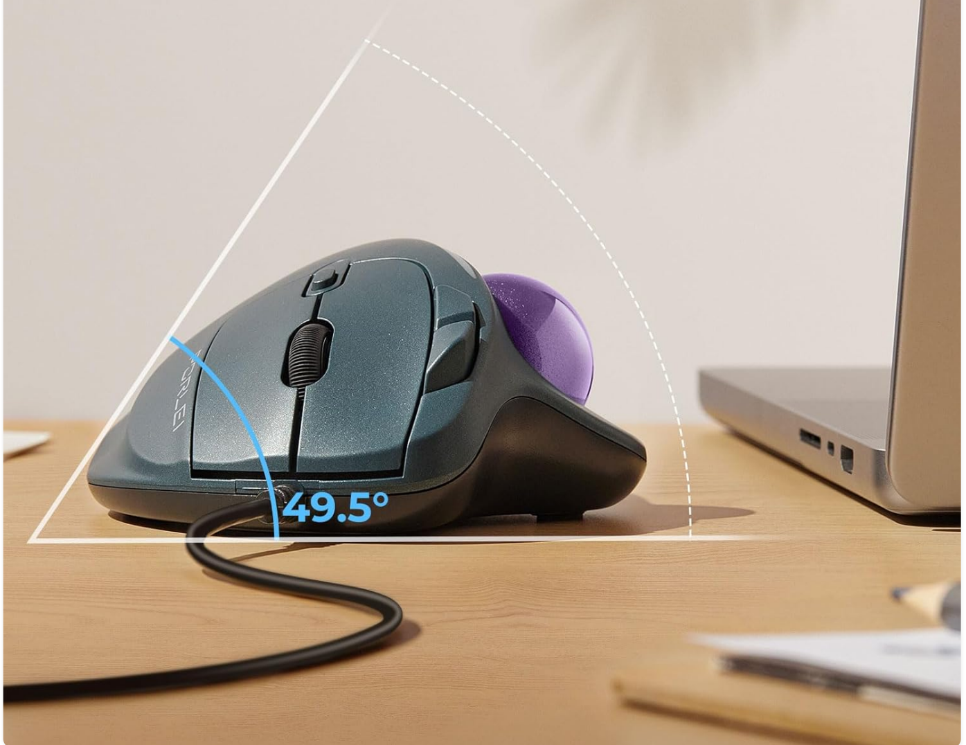
Image: A diagram highlighting the 49.5-degree angle of the PORLEI TM551 trackball mouse, designed to promote optimal wrist posture and reduce strain.