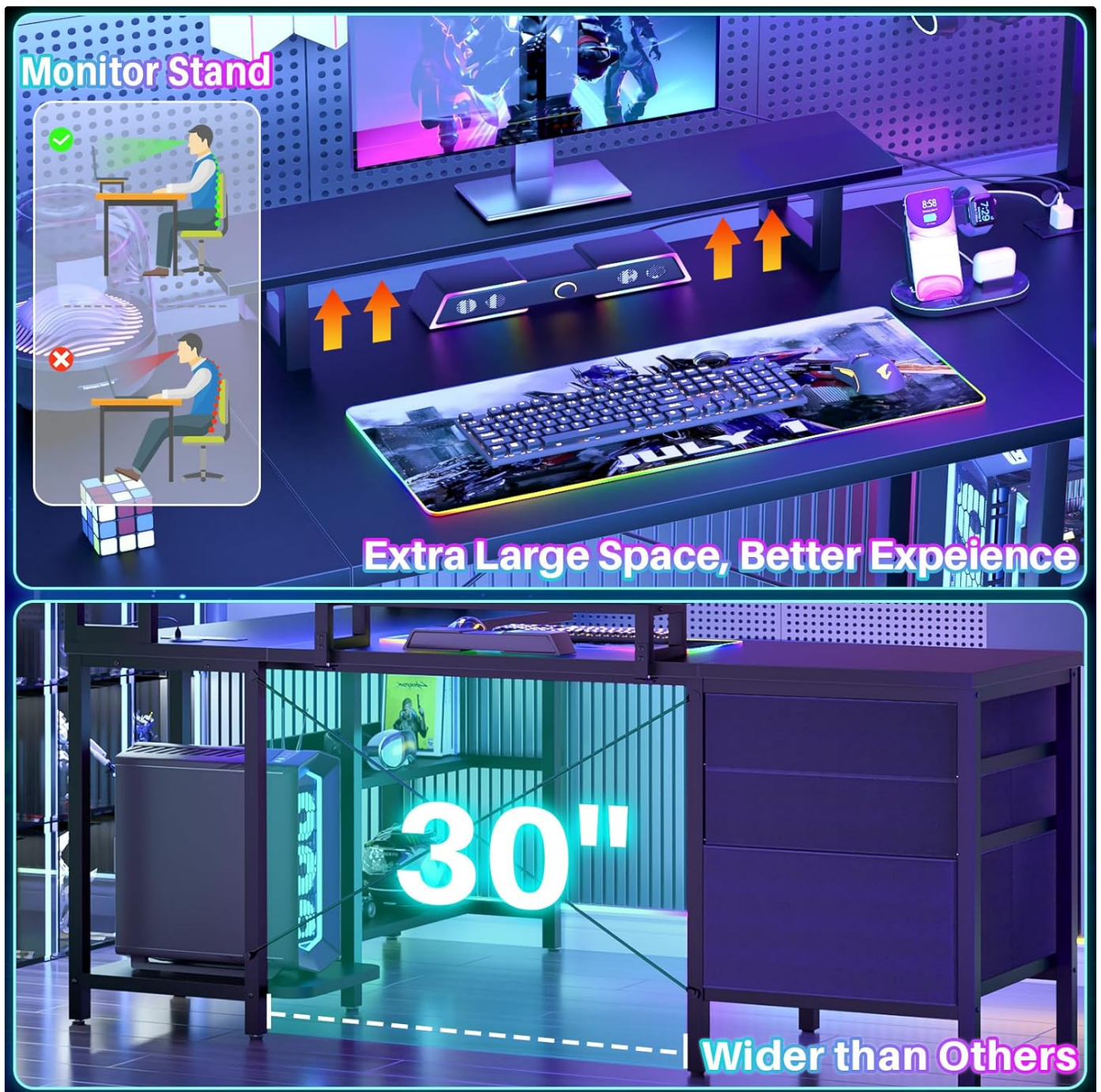
Image: A monitor stand positioned on the desk, illustrating how it elevates the screen for improved ergonomics and provides additional space underneath.