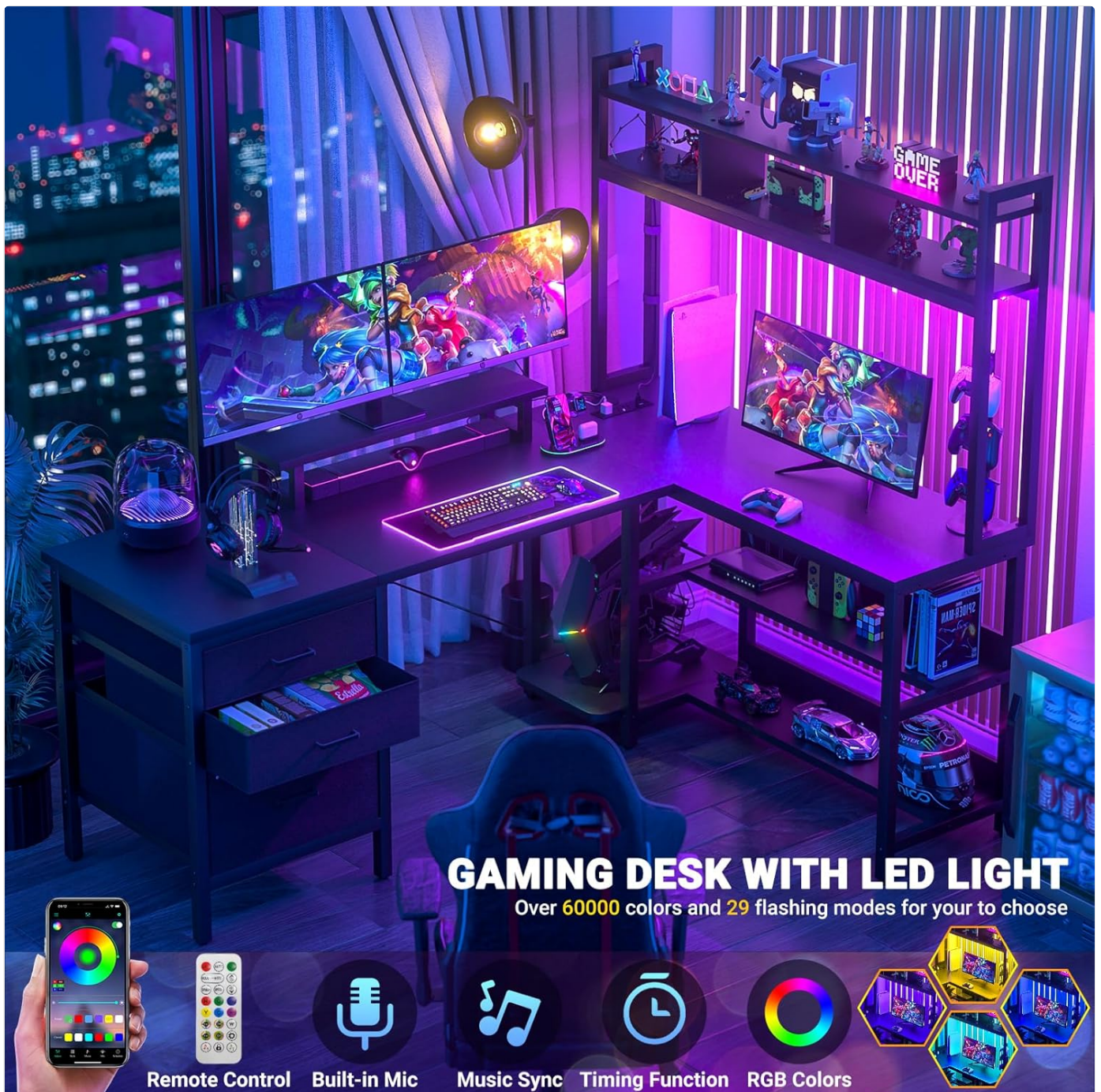
Image: A gaming setup featuring the Aheaplus L Shaped Desk with its LED lights illuminated in various colors, demonstrating the customizable lighting options and the remote control.