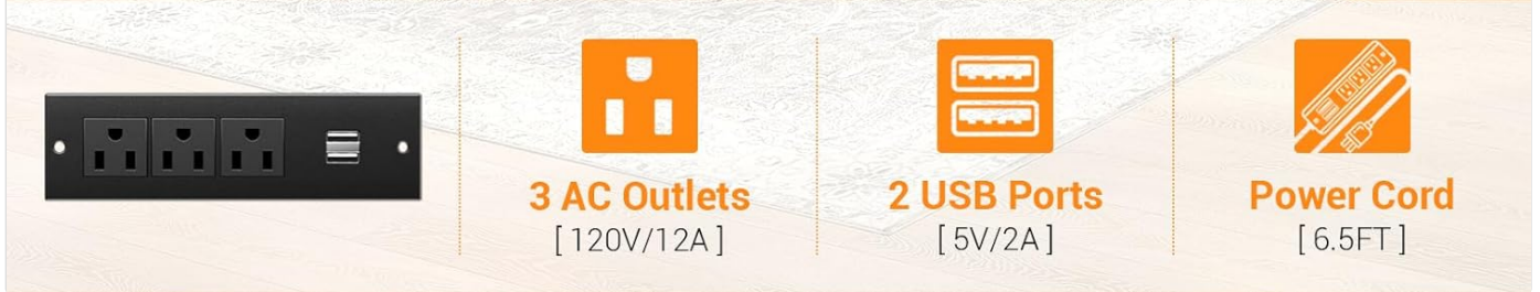
Image: Close-up view of the integrated power outlet on the Aheaplus L Shaped Desk, showing 3 AC outlets and 2 USB ports, along with the 6.5ft power cord.