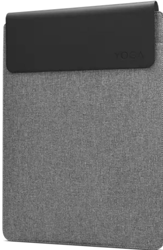
Image: The Lenovo Yoga Laptop Sleeve, highlighting its sleek and lightweight profile, designed for easy storage without adding bulk.