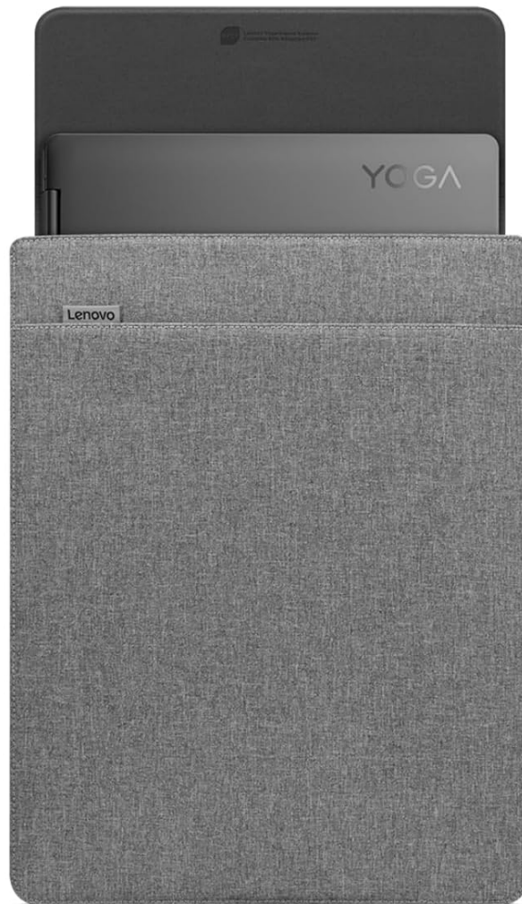
Image: The Lenovo Yoga Laptop Sleeve demonstrating its secure magnetic closure, which provides both security and convenience for accessing the device.