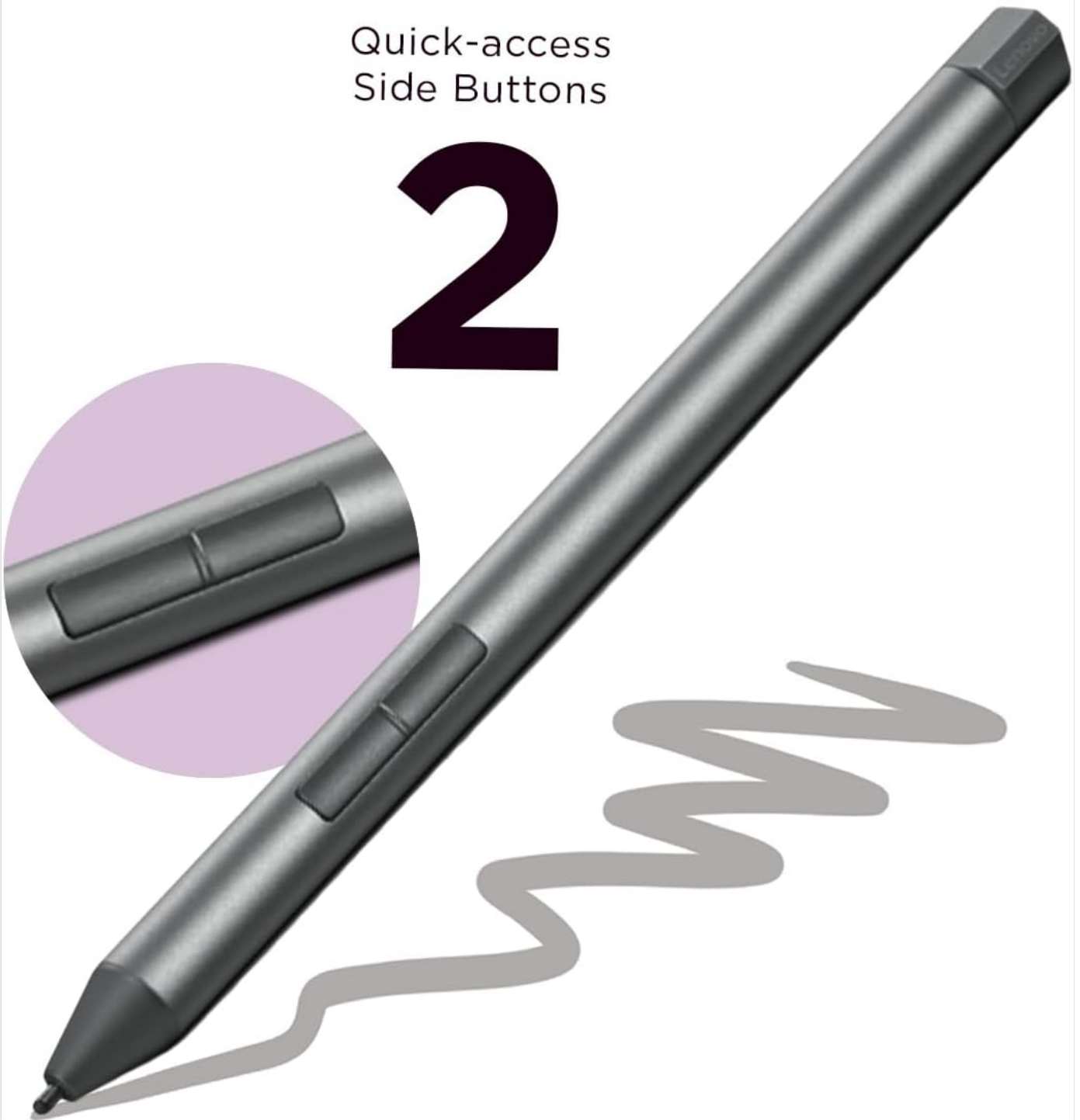
Image: A visual representation of the Lenovo Digital Pen 2, emphasizing its quick-access side buttons and long-lasting battery life for uninterrupted creativity.