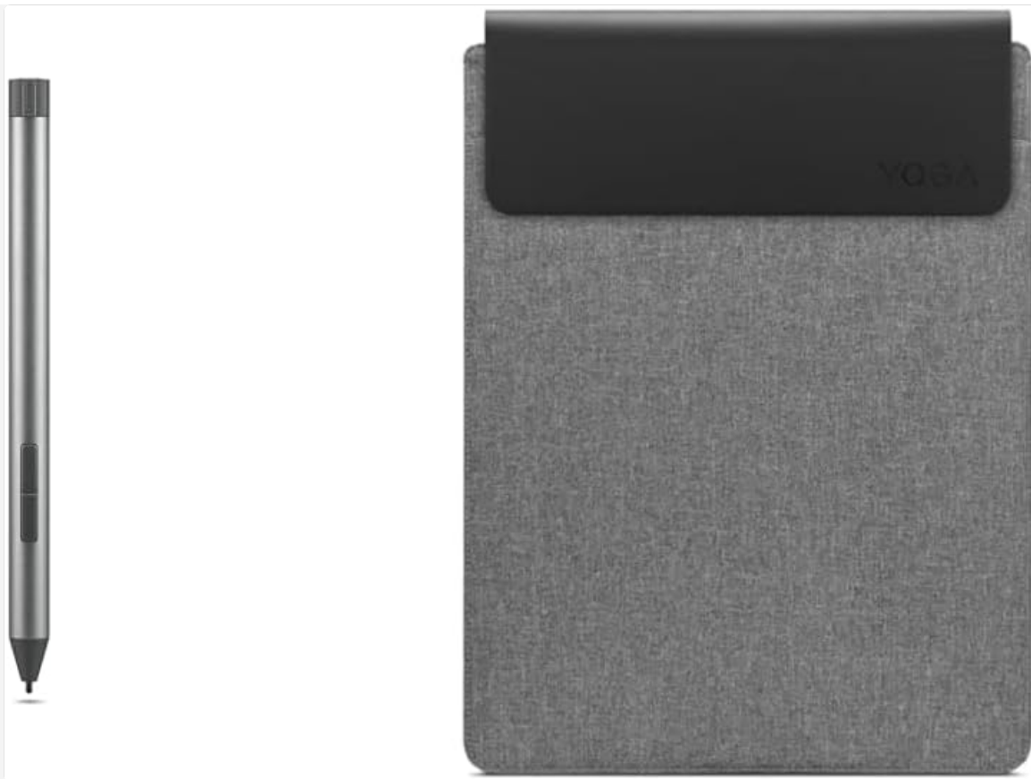
Image: The Lenovo Digital Pen 2 (left) and the Lenovo Yoga Laptop Sleeve (right), showcasing the complete product bundle.