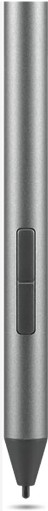
Image: A detailed close-up view of the Lenovo Digital Pen 2, highlighting its sleek, frosted all-metal construction and the two side buttons.