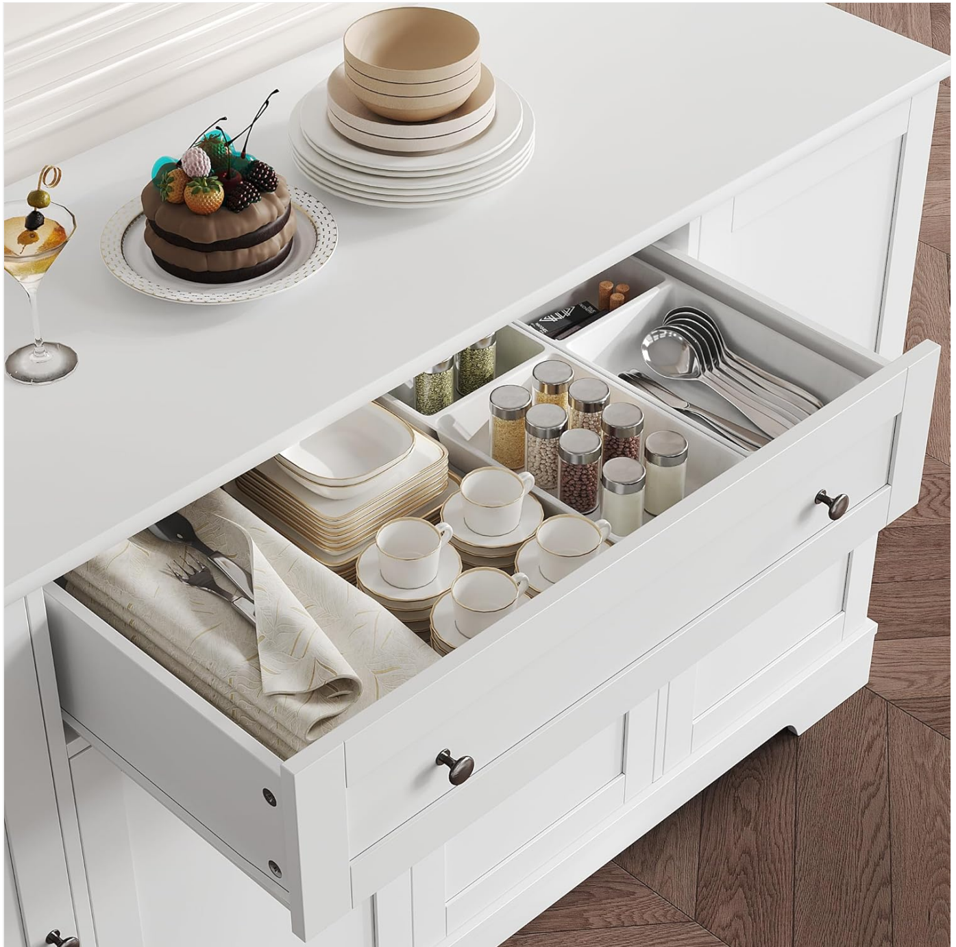
Image: A close-up of the open drawer, demonstrating its capacity for organized storage of smaller kitchen and dining essentials.