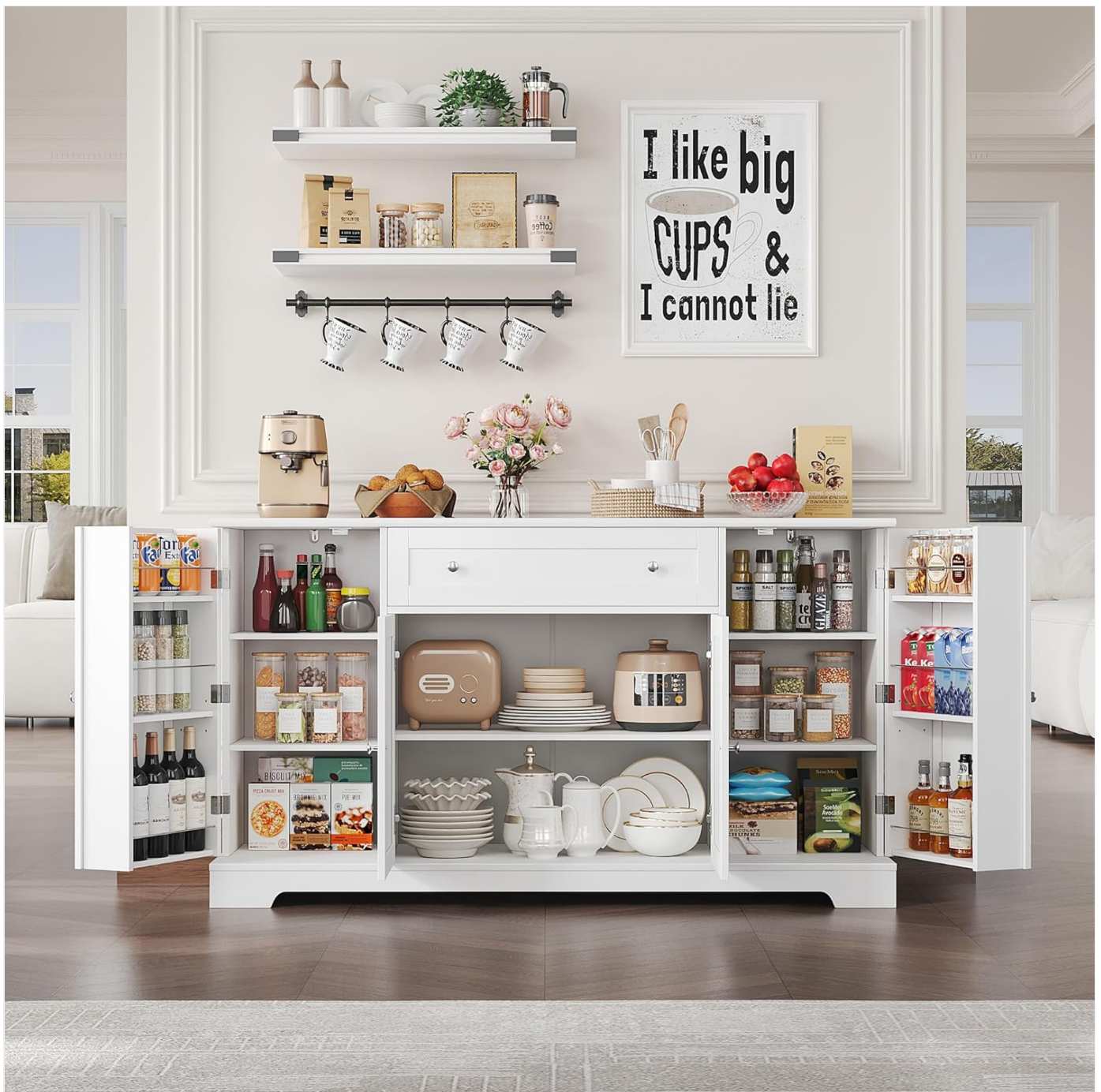
Image: The HITHOS 54" Buffet Cabinet with all doors open, revealing its extensive storage capabilities. The cabinet is filled with various kitchen and dining items, demonstrating its practical design for organization.