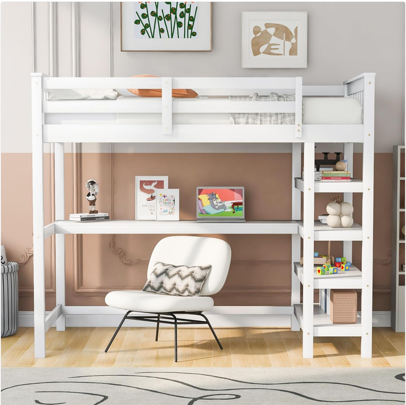
Image: The Mirightone Twin Size Loft Bed fully assembled, showcasing the integrated desk and shelving unit.