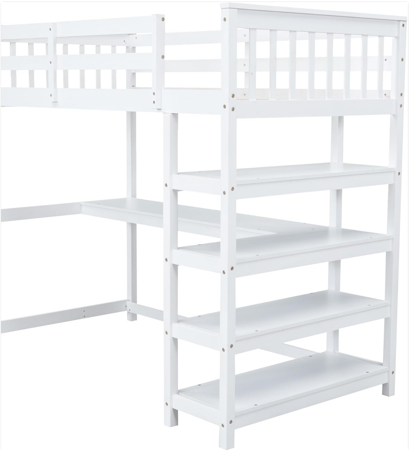
Image: Side view of the integrated 4-tier storage shelves, designed for accessibility and organization.