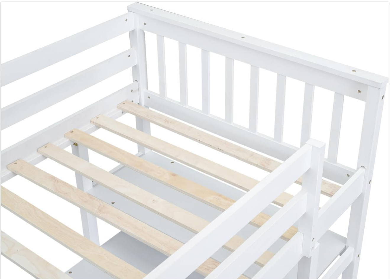
Image: Close-up view of the wooden bed slats, demonstrating proper installation for mattress support.